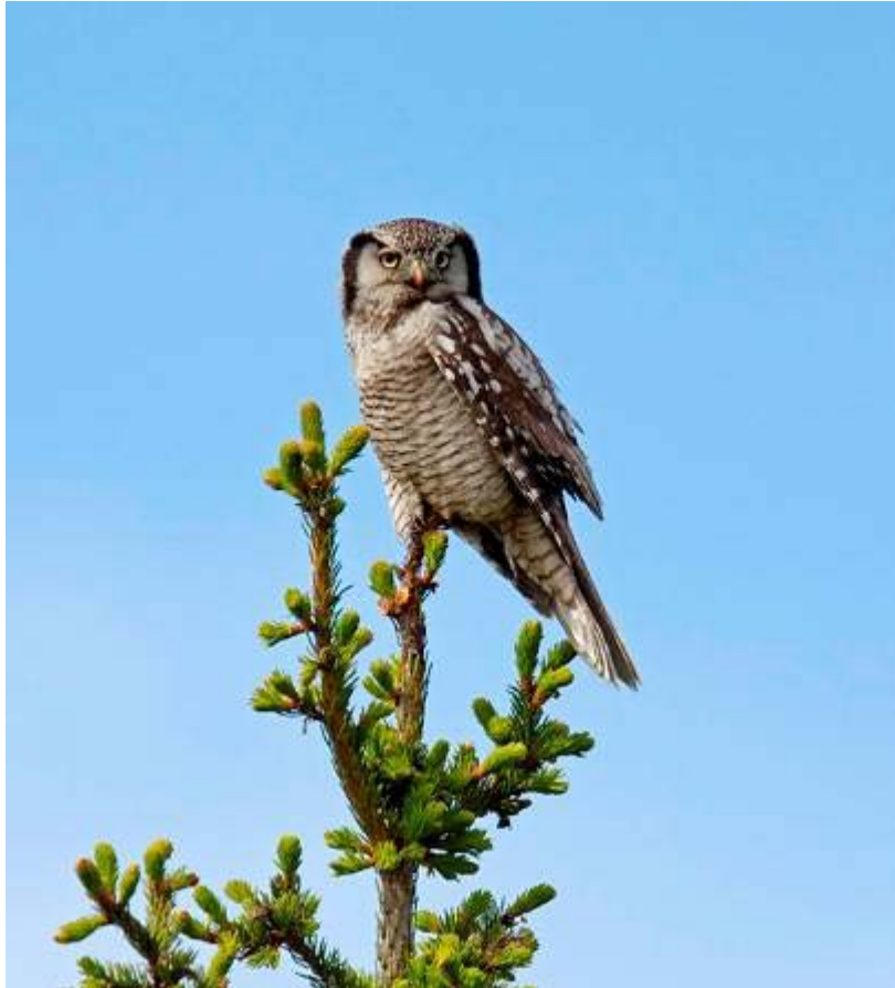
Hawk Owl (HT)

The next stop gave us magical views of a pair of Hawk Owls causing some concern as they swooped low over our heads. We decided to leave them in peace to attend to their chicks and left for Kuusamo driving through some lovely forested areas stopping once more to watch a pair of Siberian Tits feeding young. We then headed to our digs for the 'night'; the usual two or three hours that birders get on arctic trips.