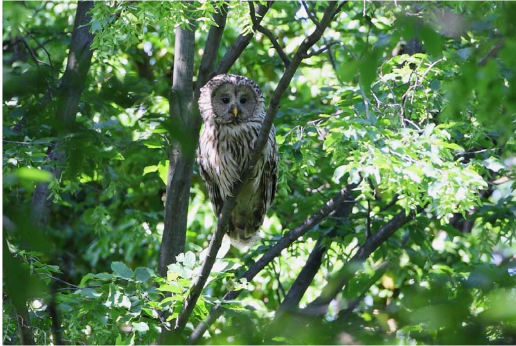
Ural Owl (JO)