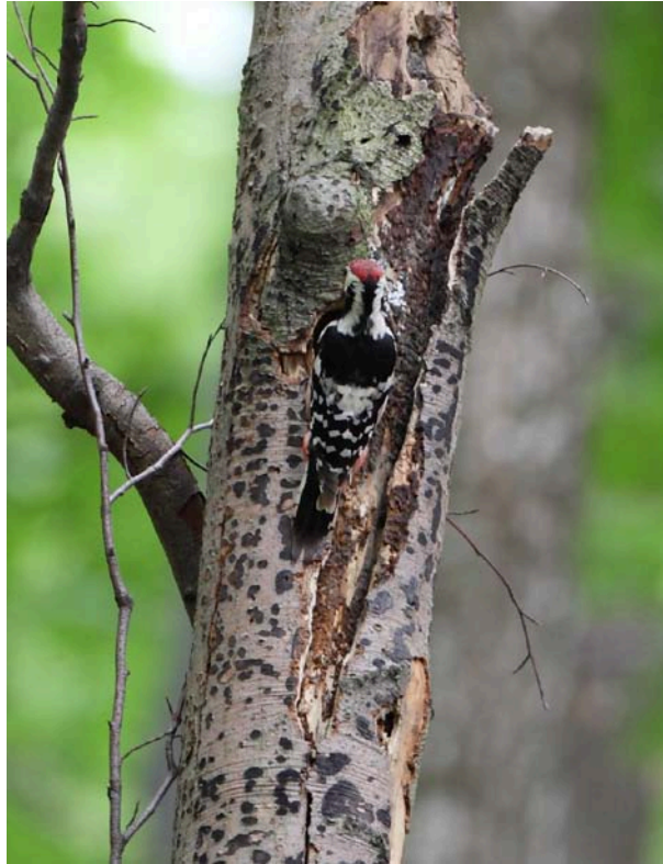
White-backed Woodpecker (JO)

We began the day with a magnificent adult Eastern Imperial Eagle before heading to Debrecen en route to the Hortobagy (Or-toe-barje); now, more swamp than steppe. We stopped at the Debrecen 'great wood' and spent an hour in a hide from which we saw Great-spotted and Middle-spotted Woodpeckers, Greenfinch, Chaffinch, Hawfinch, Nuthatch, Tree sparrow, Yellowhammer, Song Thrush, Collared Flycatcher and Blackcap in a little under an hour.