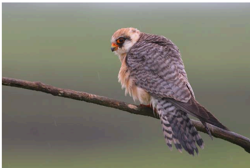
Red-footed Falcon