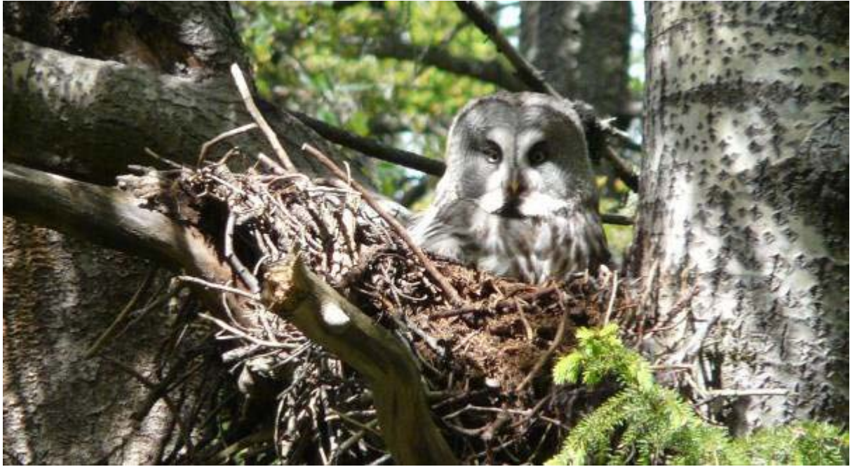
Female Great grey Owl (HT)

The following day we started with a very vocal Blyth's Reed Warbler and enjoyed exceptionally good views of this bird before returning to see the Eurasian Pygmy Owls ; a female with at least two young.