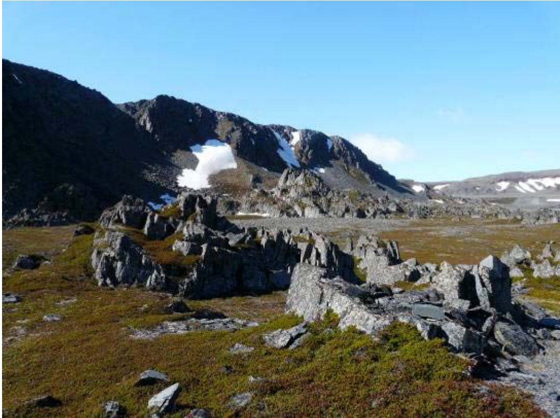
Hamningberg, Norway (EB)