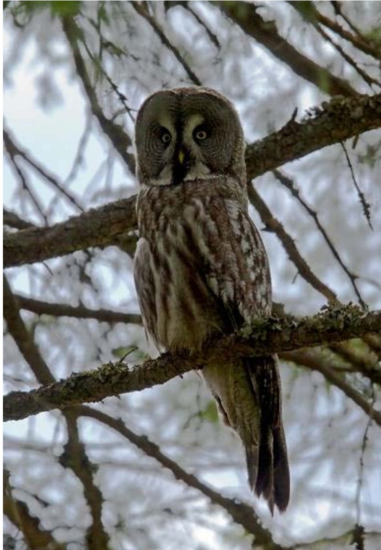
Male Great grey Owl (HT)

This was the beginning of a very memorable day as our next stop produced heart stopping views of huge female Great Grey Owl on the nest with three chicks. Harri then found the male roosting nearby and we stood and watched them and they sat and watched us for about an hour or so before we had to move on. Apart from the owls these forests seemed very poor for birds. At most stops there would be a few Redwings singing, a few siskins or Redpolls, the odd Crossbill and maybe a Black Woodpecker.