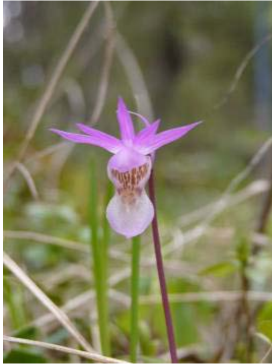
Calypso Orchid (EB)

Further exploring the Oulanka National park proved rather quiet and so we went to look at the Calypso Orchids; the plant that provides the park with its logo.