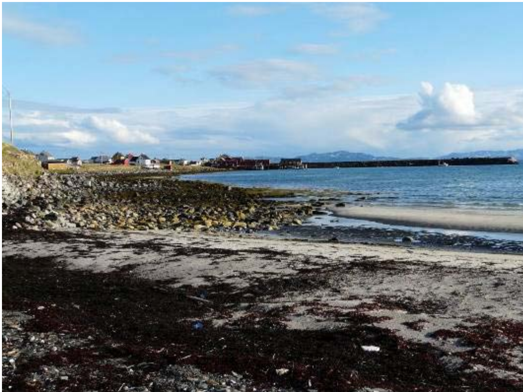
Kidberg, Varanger Fjord (EB).

Guillemots. On subsequent days we found a stunning male Steller's Eider and a sub-adult White-billed Diver completing the list of targets for the area. A 'night drive' produced a Willow Grouse, several Short-eared Owls and 18 White-tailed Eagles along the coast. Of the 18 eagles many were tearing up fish they had found or caught, often amongst flocks of sheep and lambs. These poor creatures seemed blissfully unaware that a 'notorious predator' of sheep was only meters away. Surely, if these birds were predators of lambs the ewes would be more concerned by their presence. I can think of a useful educational visit for Scottish farmers that might prove cost effective for the UK taxpayer in these straightened times.