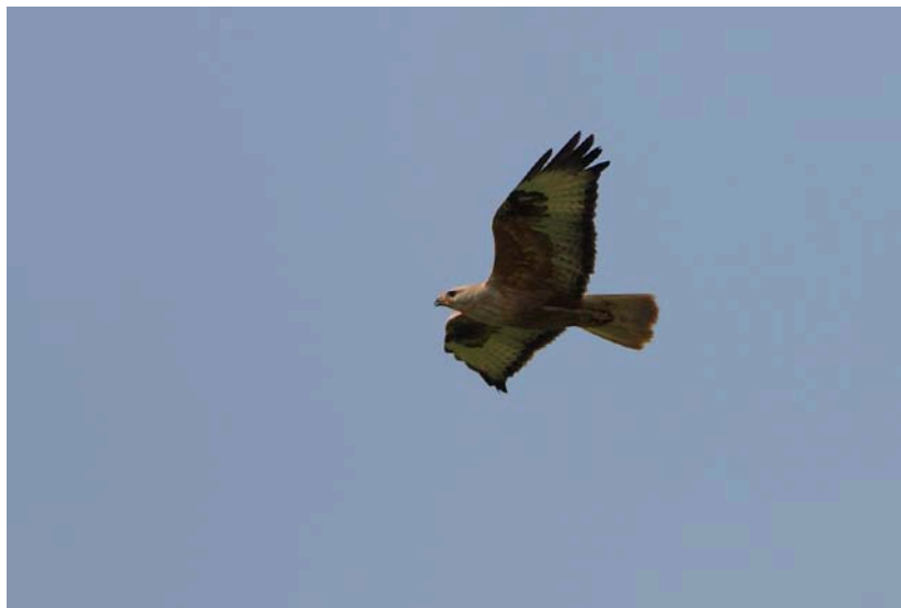
Long-legged Buzzard (JO)

We then headed to the northern Hortobagy for a magnificent afternoons birding. On the drier steppe we found a pair of Long-legged Buzzards and within minutes had spectacular views of Common, Honey and Long-legged Buzzards together, along with a couple of White-tailed Eagles . At the same site we found Hoopoe, Lesser grey Shrike, Common Crane, 16 Spoonbills and a roosting Long-eared Owl . A little further along the road we stopped to watch hundreds of White-winged and Whiskered Terns, more Common Cranes, Ferruginous Ducks and a Montagu's Harrier quartering over the grasslands. A thunder storm threatened to the north and it was time to head south to a Red-footed Falcon colony in an old Rookery ; a truly spectacular sight, after which we retreated to our accommodations.