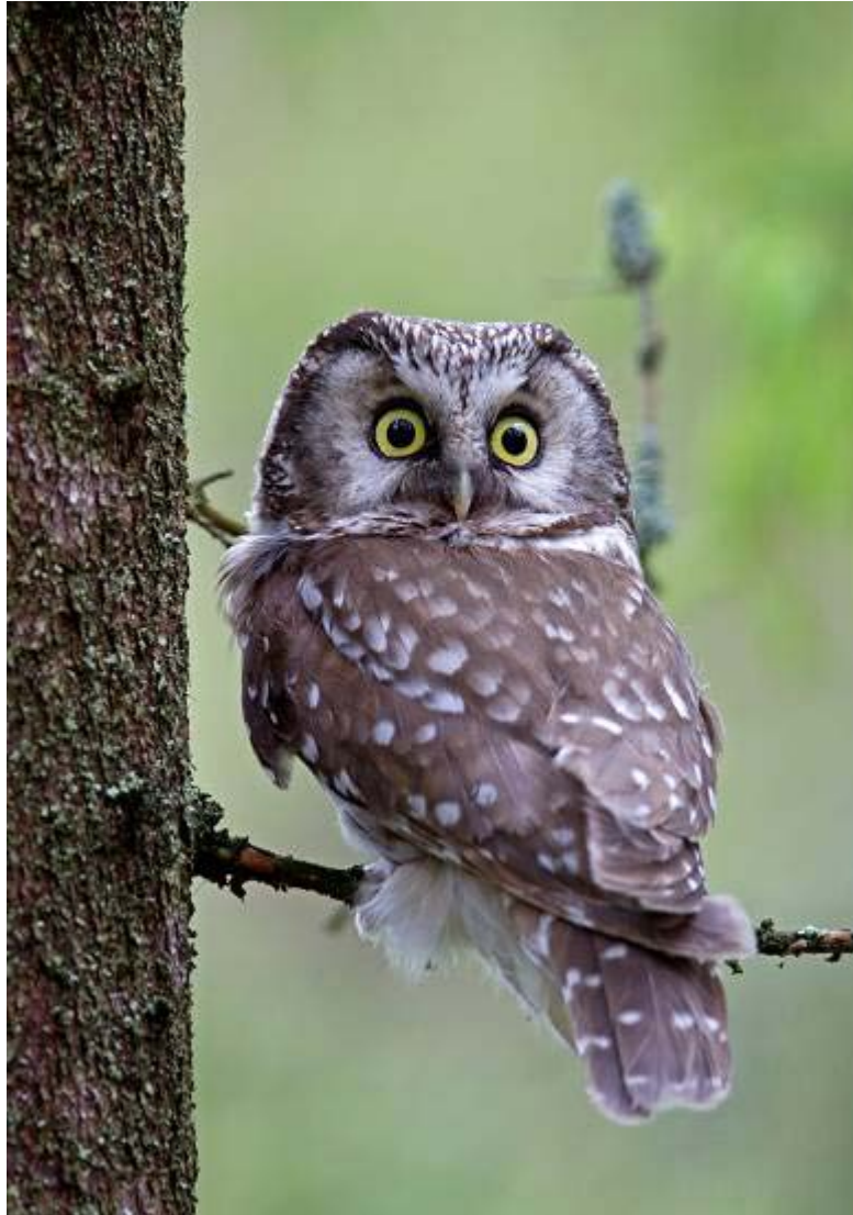
Tengmalm's Owl (HT).

Although I am not obsessed by weather, I had hoped that, once in Oulu, we would have escaped the 8/8 cloud cover, rain and gales of Eastern Europe but we were to be disappointed. On arrival we met up with Harri Taavetti and headed off for several important appointments in the teeth of biting winds and driving rain.