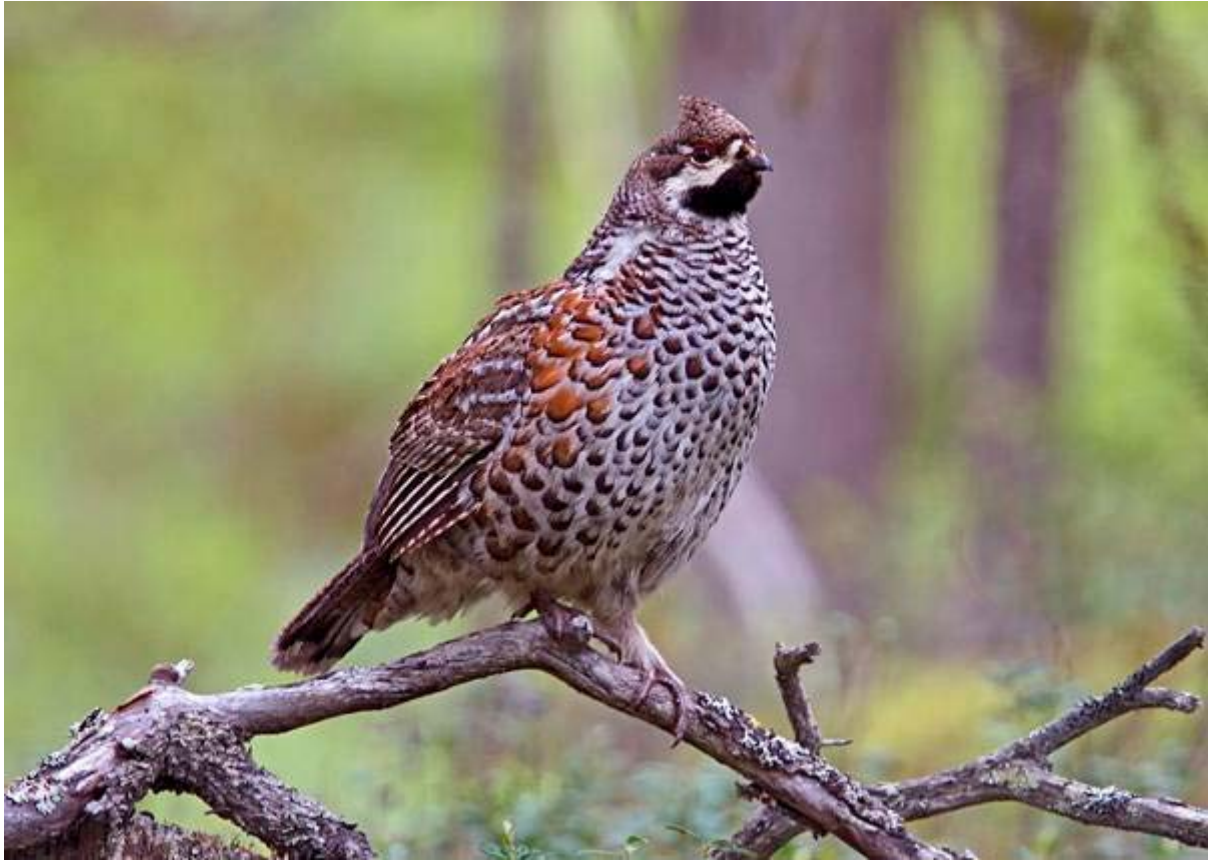
Hazel Grouse (HT).

Leaving the hotel at 3.30am we headed to a nearby Black Grouse lek which was a great spectacle. A little later we found a stunning Hazel Grouse after a few attempts and were able to watch a calling male at length, obtaining some great photos in the process. Otherwise we found Velvet Scoter, Smew, Black-throated Diver and Red-necked Grebes on the numerous lakes lining our route.