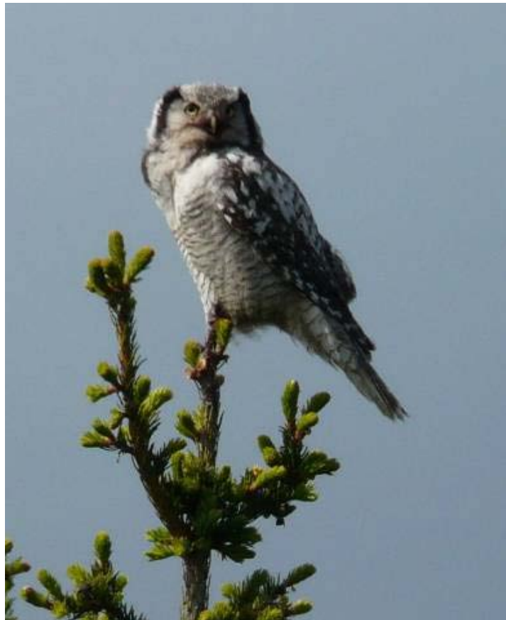
Hawk Owl (EB)