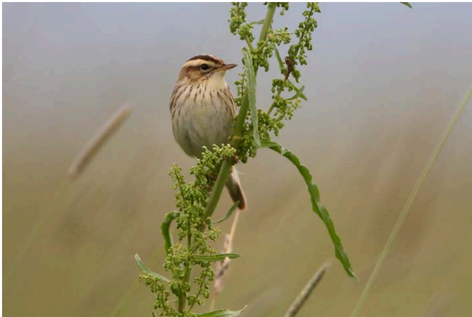
Aquatic Warbler (JO)

Nature's wake up call rang out at 5am with a simultaneous earth shattering peal of thunder and a bolt of lightning. We were beginning to think that a boat might come in handy for day two in the Hortobagy swamplands, as another 20mm of rain had fallen overnight. Our second day began with a Stone Curlew, a late (injured or educationally challenged) White-fronted Goose and a Wheatear. After an entertaining search for Quail , culminating in a single bird flying round us we headed for some new 'wetlands' to see hundreds of marsh terns, Black-tailed Godwits and Ferruginous Ducks; always a thrill, but no Moustached Warbler . The next site was better and eventually we saw one singing in the reeds, which was not a moment too soon, as two thunders storms converged on our position and soaked us. Not to be deterred from our mission we headed south to where it had not rained for two days, which seemed impossible. The track out to the marsh was drivable and we headed off for our appointment with several pairs of Aquatic Warblers . They certainly lived up to their name as we waded out into the marsh, with Fire-bellied toads calling and marsh terns fishing around us, to wait for the warblers to start singing, which they duly did at 6.10pm. Thunder rumbled all around us and darkening clouds threatened but the rain held off. Somewhat relieved and certainly surprised we then headed back to base camp having found all of our Hortobagy targets.