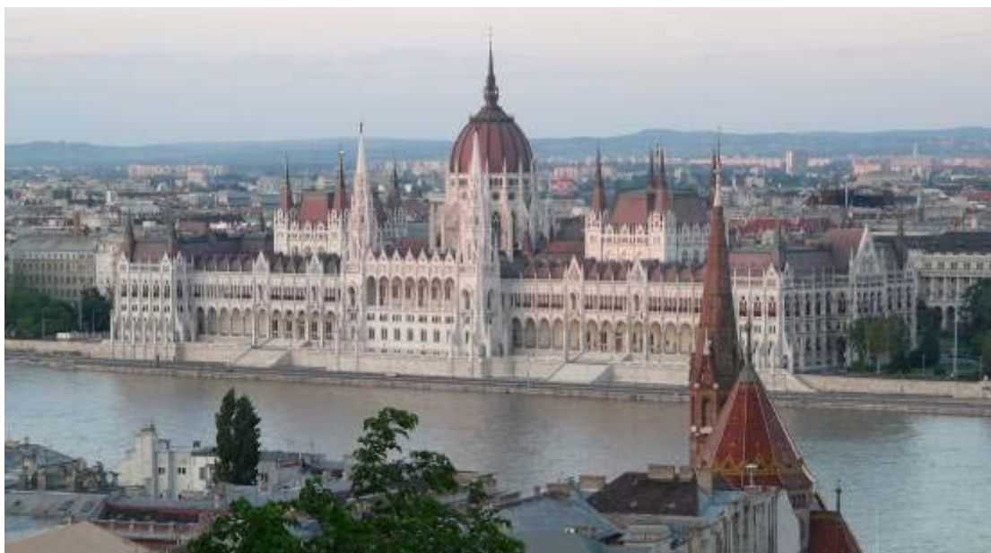
Budapest parliament buildings (EB)