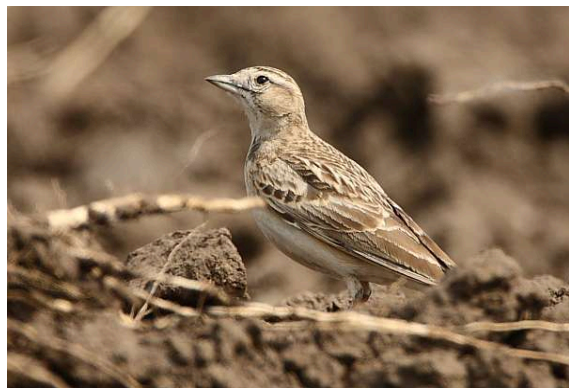
Short-toed Lark, Újfehértó