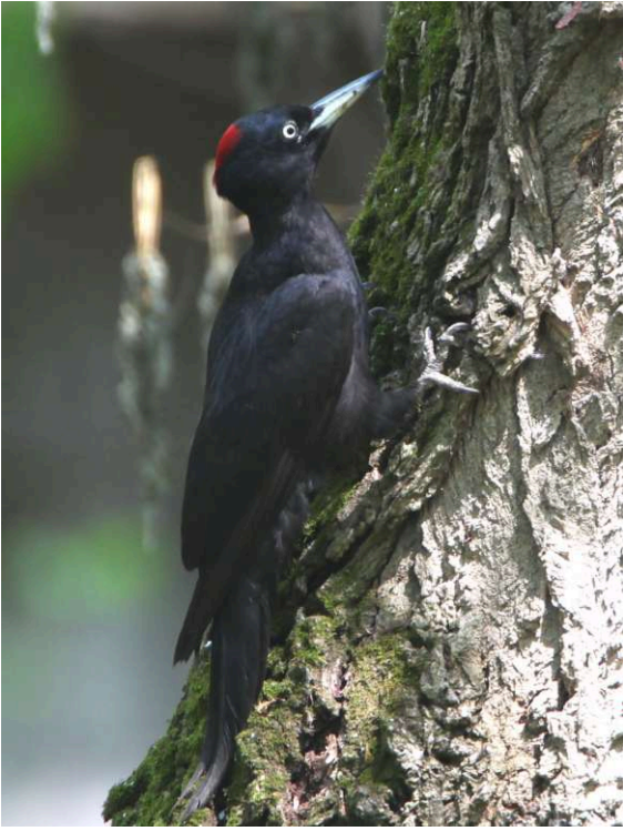
Black Woodpecker, Hortobágy