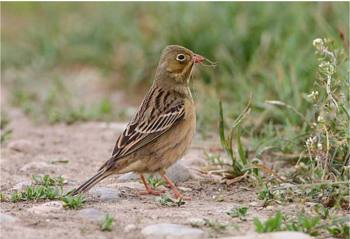
Ortolan Bunting female, Transylvania