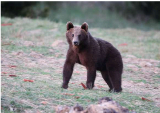
Brown Bear, Transylvania