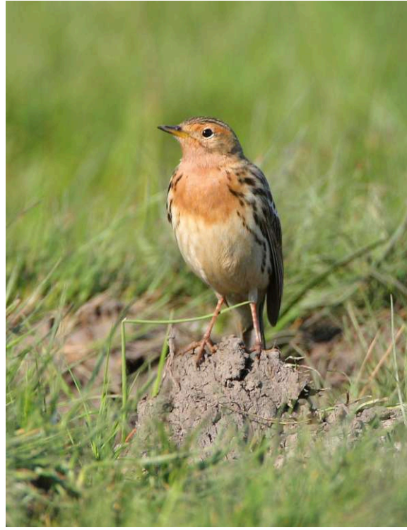
Red-throated Pipit, Transylvania