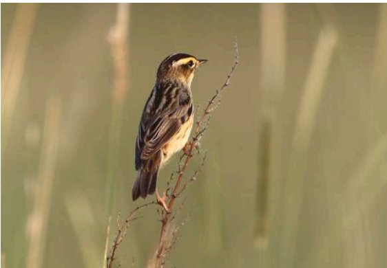
Aquatic Warbler, Hortobágy National Park