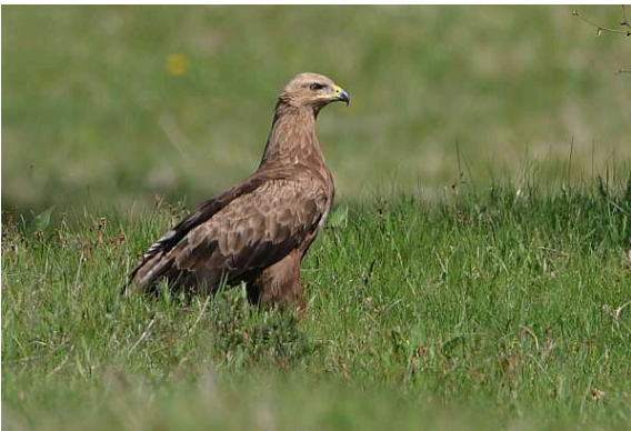
Lesser Spotted Eagle, Transylvania