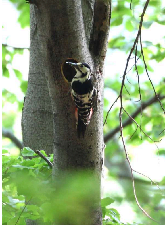
White-backed Woodpecker, Zemplén Hills