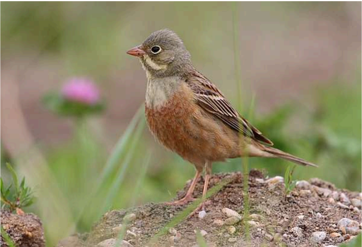
Ortolan Bunting male, Transylvania