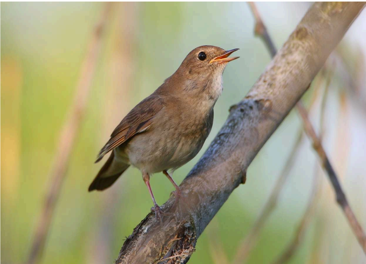
Thrush Nightingale, Transylvania