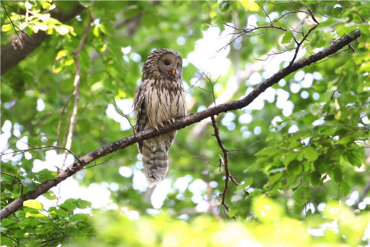
Ural Owl, Zemplén Hills