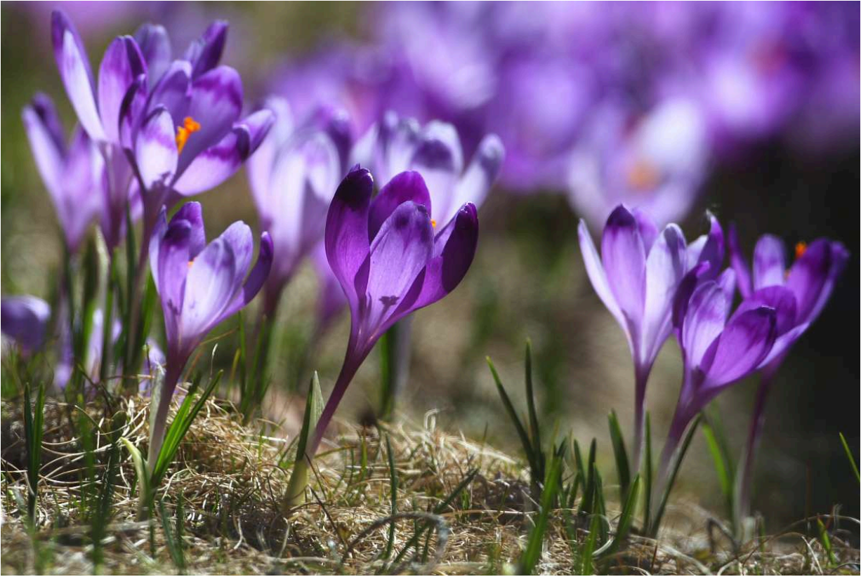
Crocus heuffeliana , Transylvania