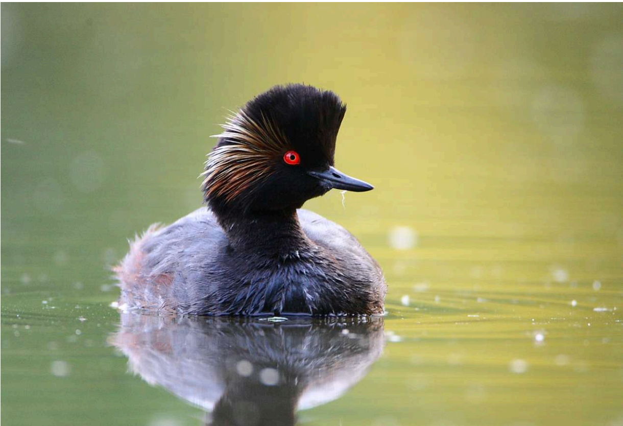
Black-necked Grebe, Hortobágy National Park