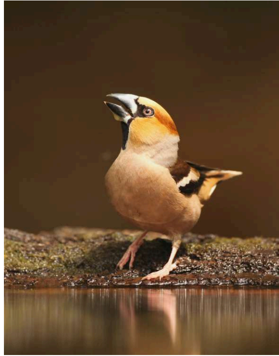
Hawfinch, Debrecen Great Wood