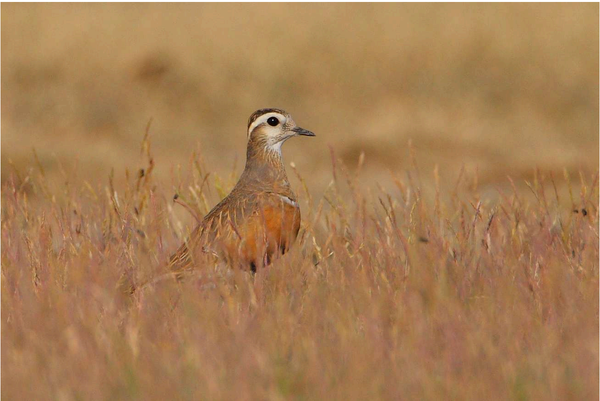
Dotterel, Hortobágy National Park