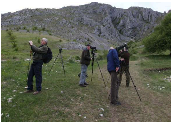
The group at Torockó