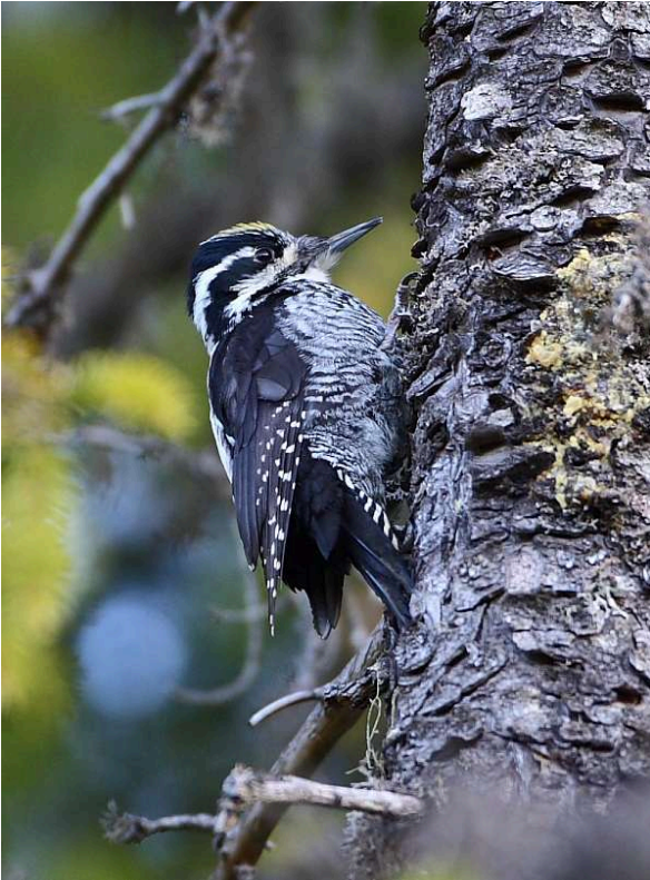
Three-toed Woodpecker, Transylvania