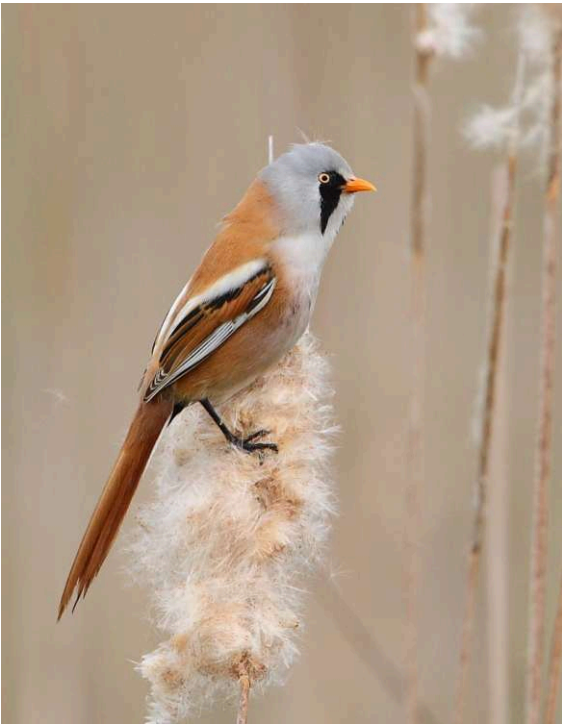
Bearded Tit, Hortobágy National Park