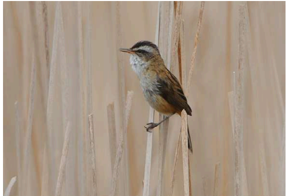
Moustached Warbler, Hortobágy National Park