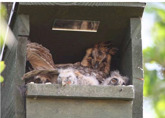
Long-eared Owl with 3 chicks, Hortobágy