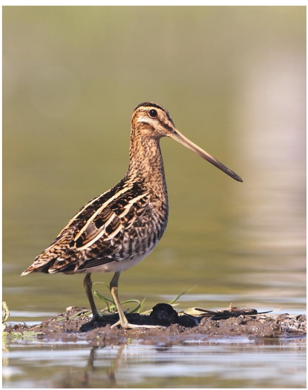
Saker Falcon on pylon and Snipe (János Oláh)

Peregrine Falcon Falco peregrinus: One adult was recorded on a pylon only 600 meters far from a Saker Falcon.