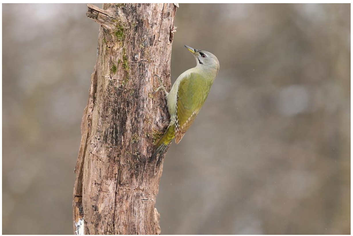
Grey-headed Woodpecker

Grey-headed Woodpecker Picus canus: We had a fantastic view of two birds on our second day close to the accommodation.