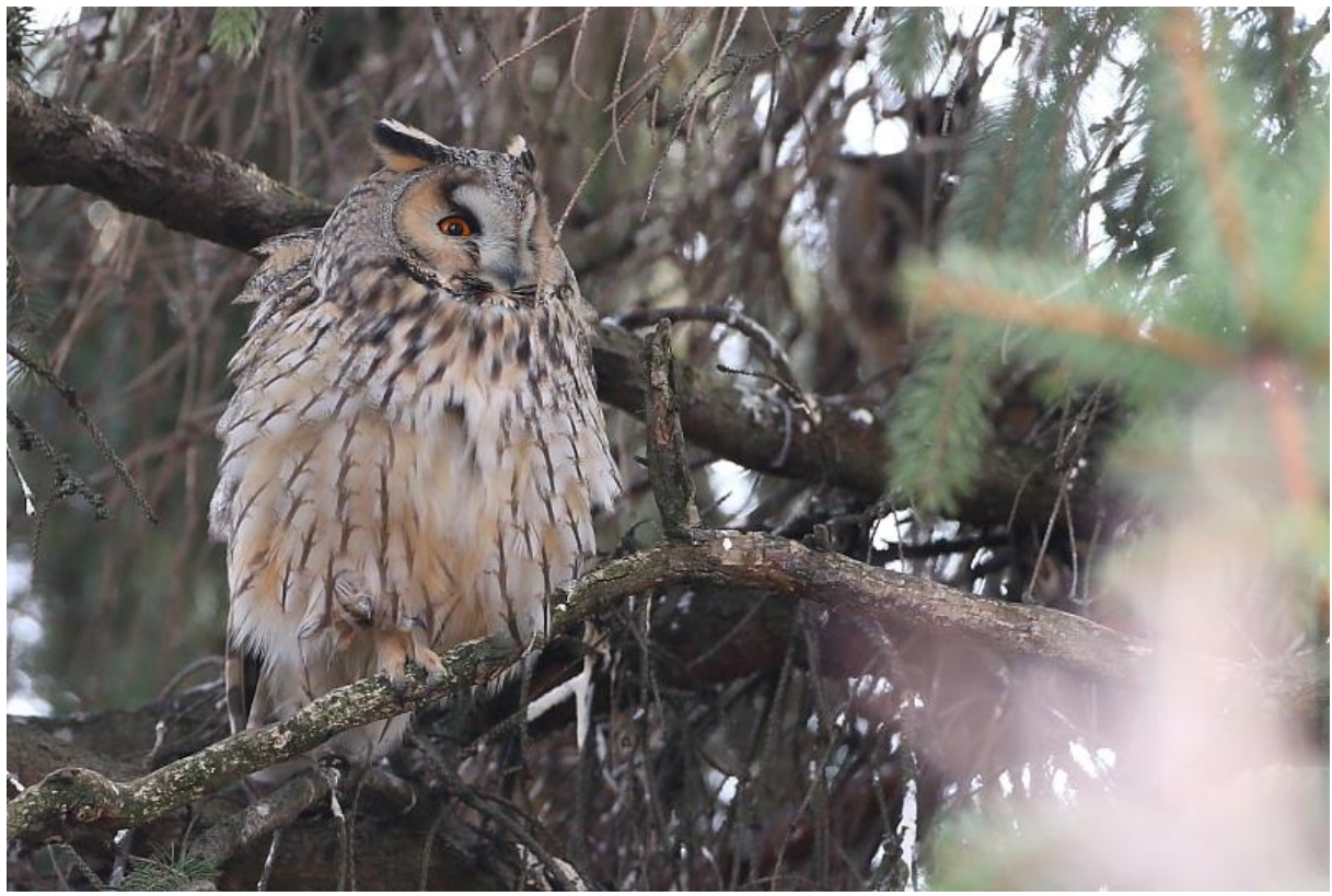
Roosting Long-eared Owl in Balmazújváros (János Oláh)

Hortobágy National Park where we had chance to see Dotterels. It was the first time when we saw Red-throated Pipits on the ground and we counted more than 200 birds together! In the Angel House puszta area well hidden away we found a small lonely shepherd's house with a Little Owl on its roof and within minutes 22 Dotterels and 20 Eurasian Golden Plovers appeared on the short grassy field close to the house as well. While we watched thses lovley and special waders a female Merlin flew cross. Dotterels use the Hortobágy as a major stopover and moulting area and probably around 200-800 individual pass through. After the successful morning we spent the afternoon in the Debrecen Great Wood. It was woodland birding and the first of this kind on the tour so many new species were encountered on the relaxing walk amongst the huge oak trees. We saw a migrant Firecrest, Long-tailed Tits, Short-toed Treecreeper, Hawfinches, Black, Green Woodpecker, Middle and Lesser Spotted Woodpeckers. We left the forest in time to reach a Crane roosting area back in the Hortobágy. Although the sunset was stunning as the last lights painted the sky and the open water to golden and pinkish red the cranes did not land in the roosting place yet. They just flew over us in endless lines. It was a very nice moment of the tour. While we enjoyed this great scenery we also had an Otter and some unidentified waders. That's why we decided we will come back here for better views at another time.