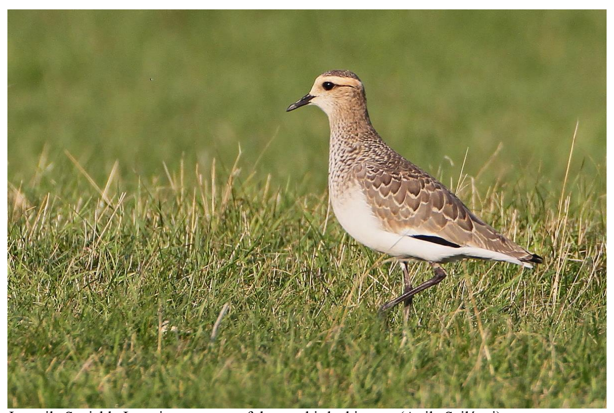
Juvenile Sociable Lapwing was one of the star birds this year (Attila Szilágyi)