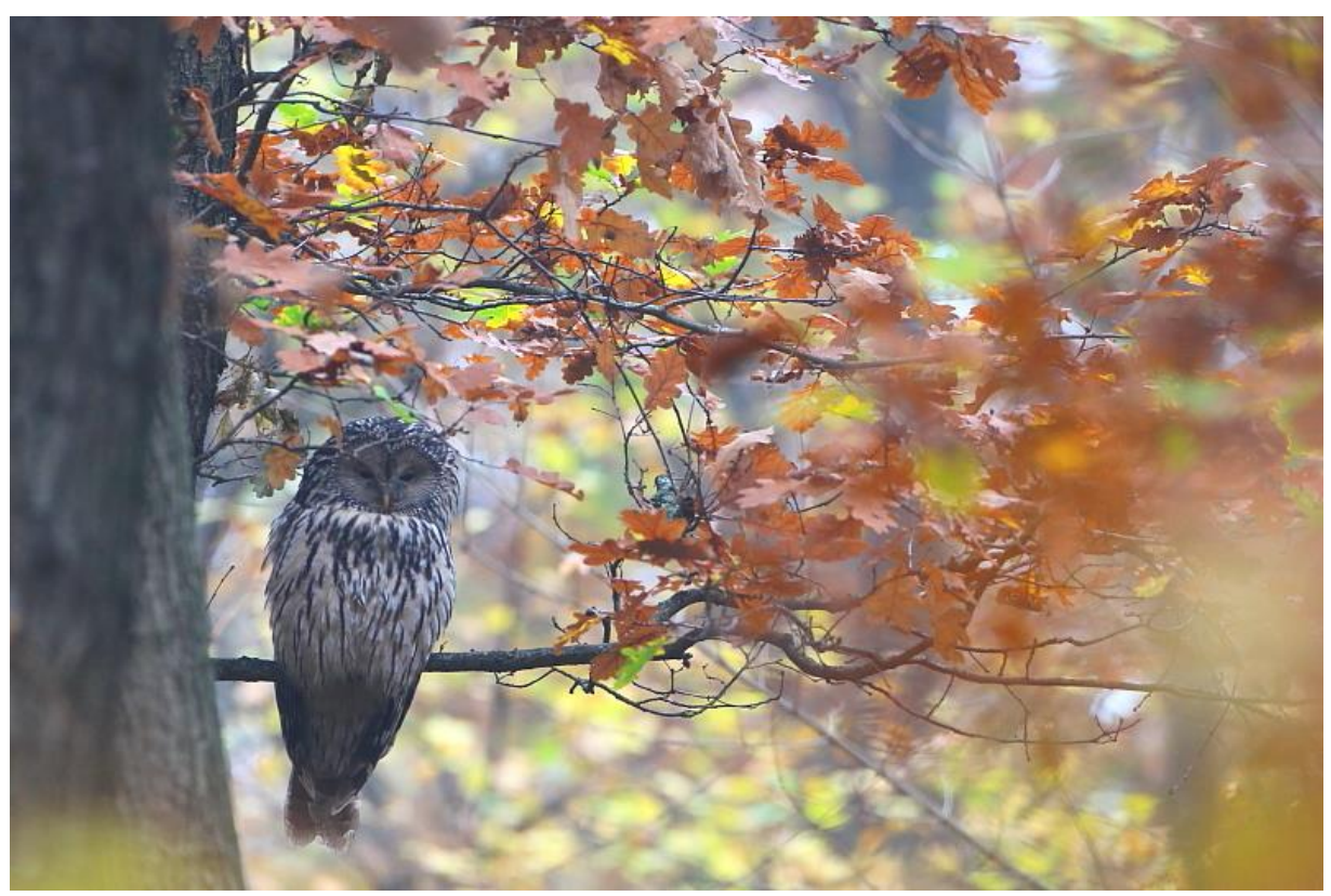
Ural Owl in the Zemplén Hills (János Oláh)

in the dark forest. This area also holds Ural owl but we had no signs of it. Our final place and forest area was near to an old castle. We took a nice and tranquil forest track up the hill and our well-deserved Ural Owl was finally located — plus a White-backed Woodpecker in the very same time! At first we could not decide which one to look at but fortunately the owl settled on a beech tree close to us and totally relaxed started to sleep so we had endless time to admire this fantastic bird. It was in the very last minute but we got it and what a bird to finish this successful tour! We drove back to Budapest where the tour ended.