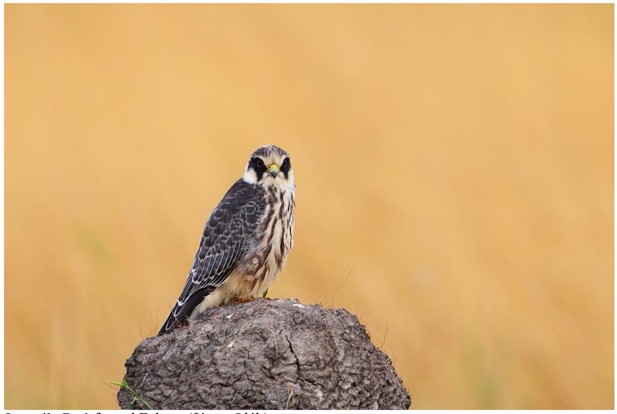
Juvenile Red-footed Falcon (János Oláh)

hopes we went to the last pond of this system. This huge lake is a perfect roosting place for cranes and geese as well as a major wader feeding areas. We saw Pied Avocets, up to 200 Dunlins and many Common Snipes. Suddenly a big flock of White-fronted Geese took off as two White-tailed Eagles disturbed them. In the very same time the small flock of Lesser White-fronted Geese arrived and landed on the water. We counted 21 birds together of this threatened species, one of the major goal of the tour! We noticed (just a few seconds later) that an Arctic Skua flew in as well - which is a rare bird in this landlocked country! On the walk back we got our first Bearded Reedlings and Penduline Tits in the extensive reed bed. Another great sighting was a flock of 200 Ferruginous Ducks! It was a great morning indeed and a nice lunch at the Hortobágy Csárda was our next port of call. The afternoon programme was grassland birding, particularly looking for falcons. In late September we usually have roosting places for the migrating Red-footed Falcons and we have visited such a roosting place where we saw about 70 juvenile birds. It was magical as they were circling around us but when an adult Saker Falcon landed nearby we were speechless. In the same time we even had two Eastern Imperial Eagles in the opposite direction. Wow! After admiring these beautiful birds we found three Great Bustards in a distance. A superb birding day in the Hortobágy National Park!