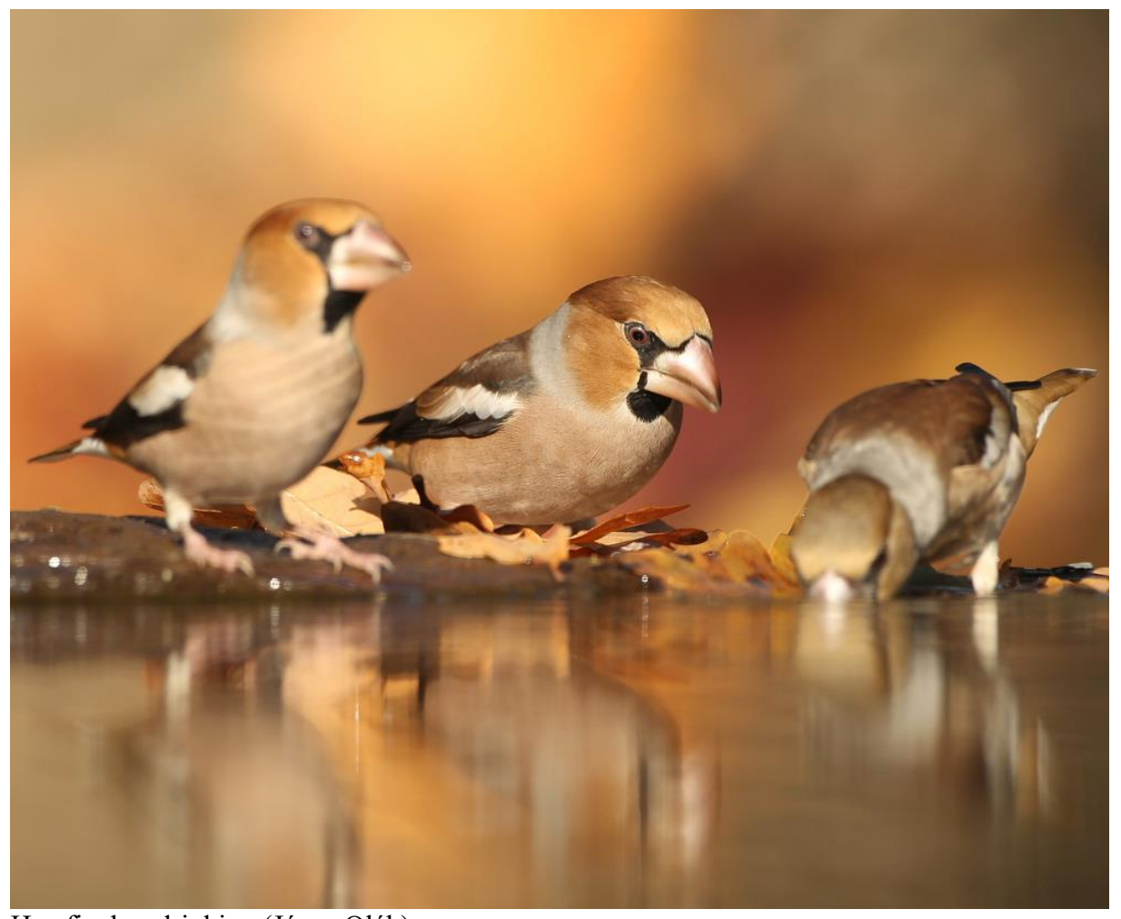
Hawfinches drinking (János Oláh)

Eurasian Siskin Carduelis spinus: Small flocks were seen mainly in the villages and around the fishpond.