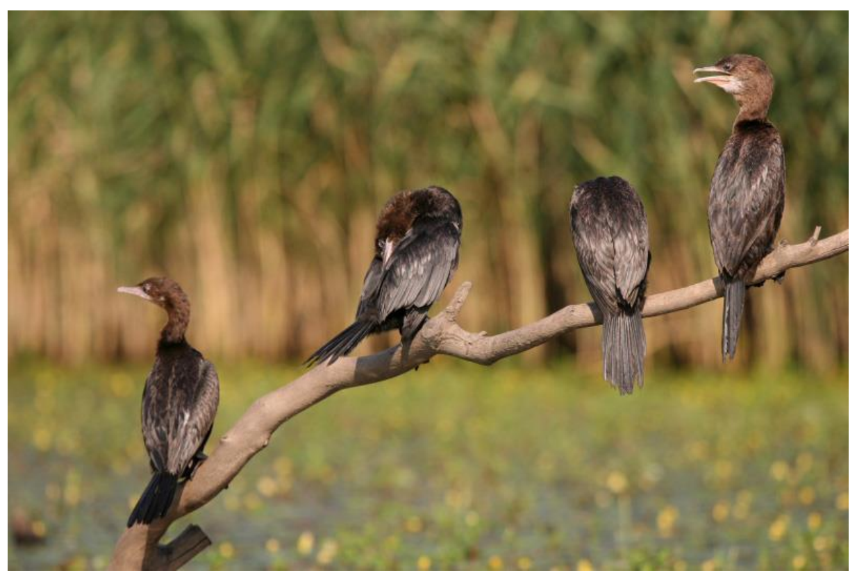
Pygmy Cormorants in the Hortobágy area (János Oláh)

Pygmy Cormorant Phalacrocorax pygmeus: Several birds were seen at Hortobágy-fishponds.