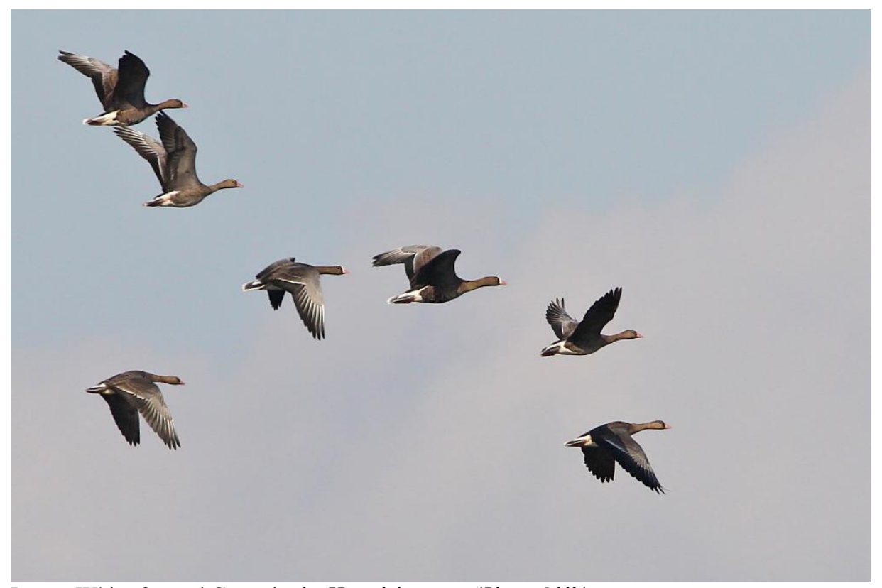
Lesser White-fronted Geese in the Hortobágy area (János Oláh)

but a big truck disturbed them so we could see them perfectly. A nearby gravel pit hold Great Crested Grebes, a Kingfisher, Black Tern, and Little Egret too. Next we drove amongst agricultural fields and grassland patches which is a perfect combo for Great Bustard in the autumn period. And indeed we found a big party of 47 Great Bustards as they fed on a large rape field. We could watch this magnificent creatures as long as we wanted. What a start of a tour! A picnic lunch was very welcome by this stage and the afternoon produced a range of goodies in this very birdy area including Eastern Imperial Eagle (good comparison with White-tailed Eagle when they sat on the same tree), Eurasian Hobby, Black and Green Woodpeckers and a juvenile Red-necked Phalarope. It was time to leave however for the Hortobágy and it was dark by the time we rolled into the newly opened Bíbic Nature Lodge in Balmazújváros on the eastern side of the park.