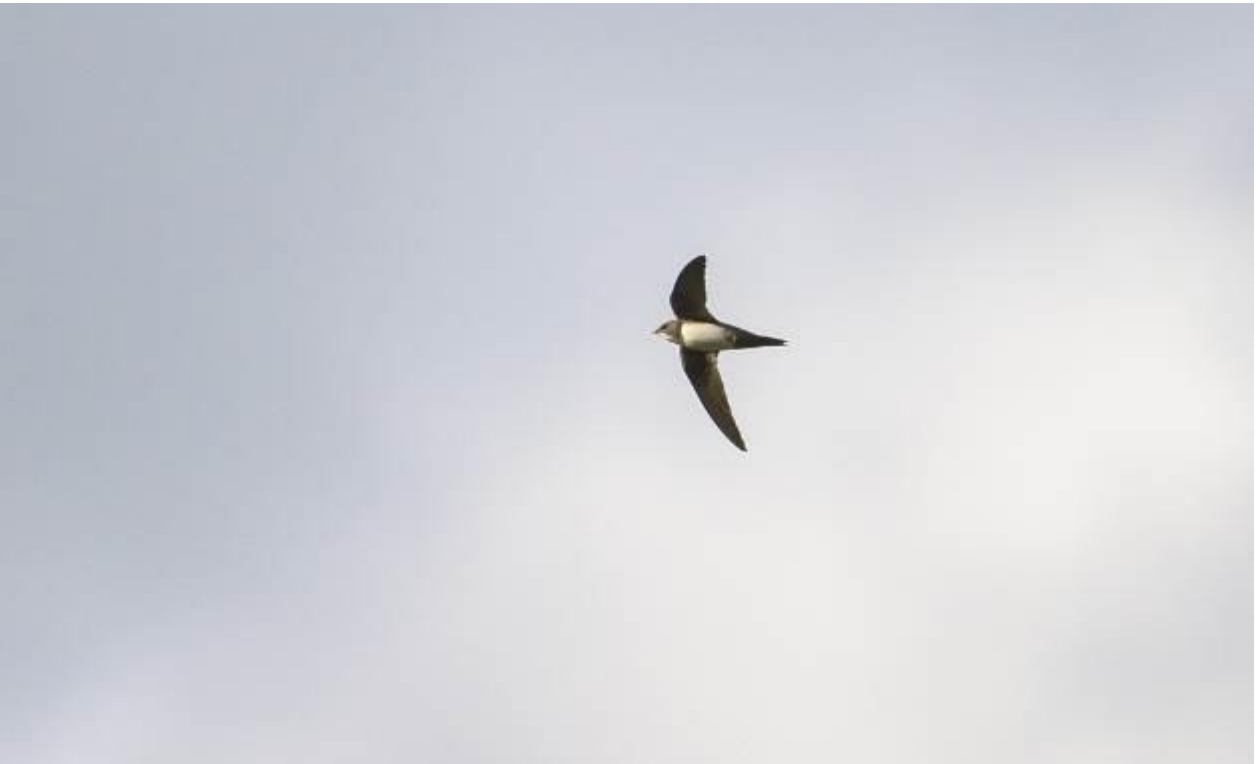
Barn Owl guttata race (top) and Alpine Swit (Simay Gábor)

Common Swift Apus apus: Recorded on four days.