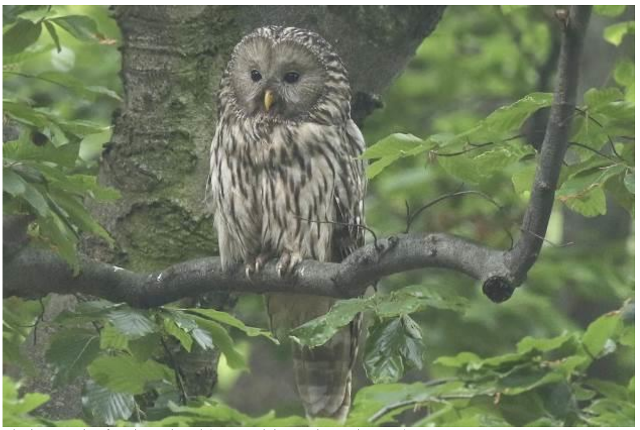
The impreessive female Ural Owl (tour participant Björn Johansson)

Following a short ride by bus we walked a few hundred meters through dense forest to reach a a more open woodland. Here we had two nice Middle-spotted Woodpeckers carrying food for their chicks as well as many Great-spotted Woodpeckers. We didn't have to wait too much until we spotted our main target here, a fantastic Ural Owl, of which we had extremely good and prolonged views! For sure, this species was on the wish list of many of the tour participants. After we left the area we drove up on a dirt road to walk into a similar beech forest. First we had a pair of Lesser-spotted Woodpeckers on a dead tree, a few singing Wood Warblers, a Black Woodpecker calling and flying overhead and more Collared Flycatchers were seen too. We spent some time in the territory of the scarce White-backed Woodpecker because for unknown reason they abandoned their nest hole we found a few days ago at this location. If the exact breeding hole is not known they can be really difficult to find in the canopy as they are really shy and wary this time of the year. The weather turned against us as and it started to rain. However, after a while we heard the picking of a woodpecker, which turned out to be a White-backed, but unfortunately it disappeared before most people could have a glimpse of it. We kept trying which was rewarded by short flight views for some of us, but that was all. Not very satisfying after much effort.