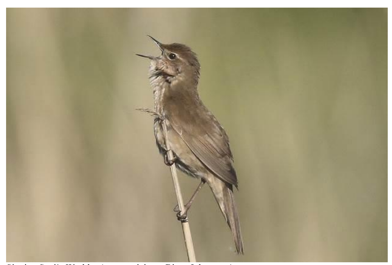
Singing Savi's Warbler (tour participant Björn Johansson)

The group members arrived from different locations and the meeting point was the Liszt Ferenc Airport in Budapest. From here, we took the M3 motorway till Miskolc and from there to the Zamplén Hills. These gentle hills are found in north-eastern Hungary with beech and oak forests, wide valleys and foothills with grasslands, vineyards and orchards. On the way we had one short stop, where we had our sandwiches and saw our first species to mention: a few Crested Larks – typical species of the parking areas or garages – and a somewhat distant adult Eastern Imperial Eagle in the scope. Our first proper birding stop was in a quarry where we were looking for Eagle Owl. The female was quickly found, but unfortunately it moved too behind a bush. Despite we waited there for a while it didn't appear again. European Turtle Doves, Red-backed Shrike and Hawfinches were also seen here. On a nearby area later on, we found another adult Eastern Imperial Eagle much closer than the first one, and also a perched Saker Falcon. The nearby marshy habitat produced Savi's, Grasshopper and Great Reed list. Warblers. A pretty amazing first afternoon! As we did the birding till dusk, it was already dark when we arrived to our hotel deep in the Zemplén Hills.