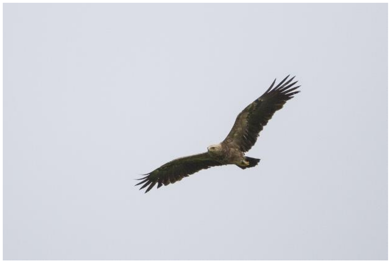
Lesser Spotted Eagle (Simay Gábor)

After we took a small forest road, we left our van behind and walked up on a forestry road into a nice old spruce-beech forest. The evergreen trees held plenty of Crested Tits and a few Bullfinches. After we heard a distant White-backed Woodpecker calling, we managed to find the female on a tree top and we had good scope views of it. No much later the male bird was also seen by some of us. After the struggle yesterday it was amazing to get such a good looks of this rare woodpecker! Right after this a calling Hazel Grouse drew our attention. After some effort it was found and seen a couple of times, sometimes really well. It was a very good bird to get on our list! Again by early May they usually not calling much but the cold spring and the cold weather was helping with this bird. After this we tried hard to find Tengmalm's Owl, but we had no luck with this species. This year was - sadly – a particularly bad year for the small owls anywhere in the Carpathians. While searching for the owl, we found the nest hole of Black Woodpeckers and had great views of the pair. While a Nutcracker also turned up on a tree top. The lights had started to fade and it was time to walk down the road and drive to our hotel near Dobsina.