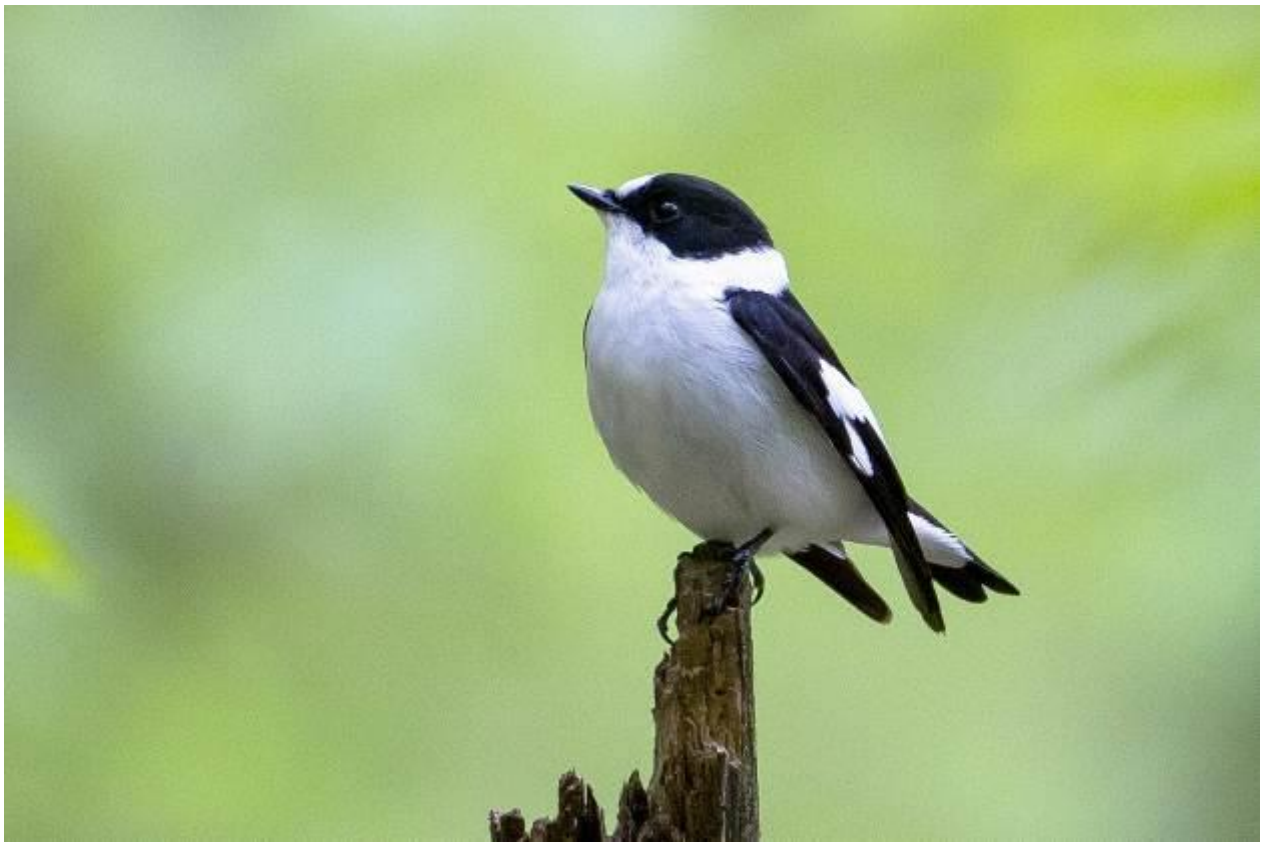
Collared Flycatcher in the Zemplén Hills (Simay Gábor)