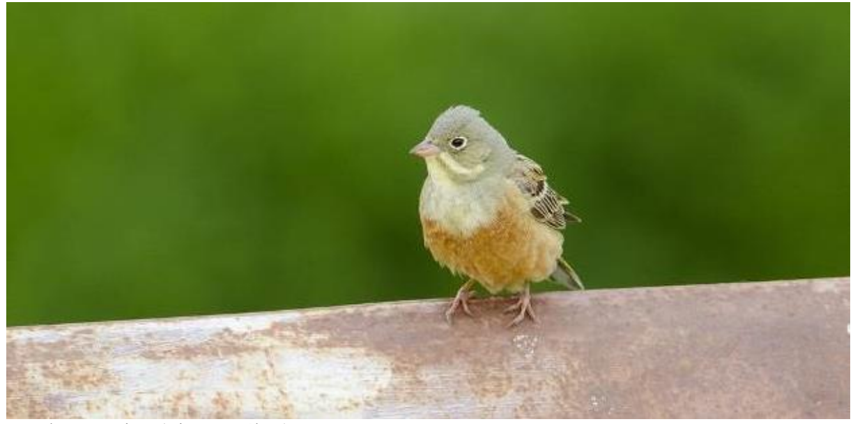
Ortolan Bunting

A grassland area gave us a soaring Long-legged Buzzard (a rare breeder of the Hungarian grasslands) and also a Hobby and a Hoopoe. Our next stop was by some reservoirs where we had our picnic lunch. We had no time for checking the huge lakes thoroughly, but five Rednecked Grebes were spotted among the many Greater-crested Grebes. We also saw singing Ortolan Buntings and a Tawny Pipit made a short appearance too. A soaring Short-toad Eagle gave better views then the one in the Zemplén Hills and was a very welcome addition!