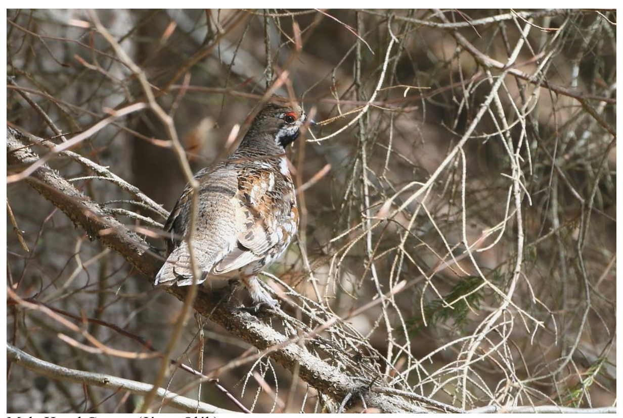
Male Hazel Grouse (János Oláh)

We had a Black Kite on the drive and in the afternoon we stopped for an Isabelline Wheatear – a rarity in Hungary, and a somewhat unexpected addition to our bird list. Though it was getting late and we still had some distance to cover to the hotel, we couldn't resist the temptation and stopped for birding by a fishpond system. We had very good views of a pair of Penduline Tits, plenty of Spoonbills were feeding in the shallow water and Pygmy Cormorants and Black-crowned Night-herons were flying around. Whiskered Terns were hunting for insects, while from the bushes Common Nightingales were singing away. It was a nice evening for sure. We drove to our hotel near Nádudvar and arrived in the dark.