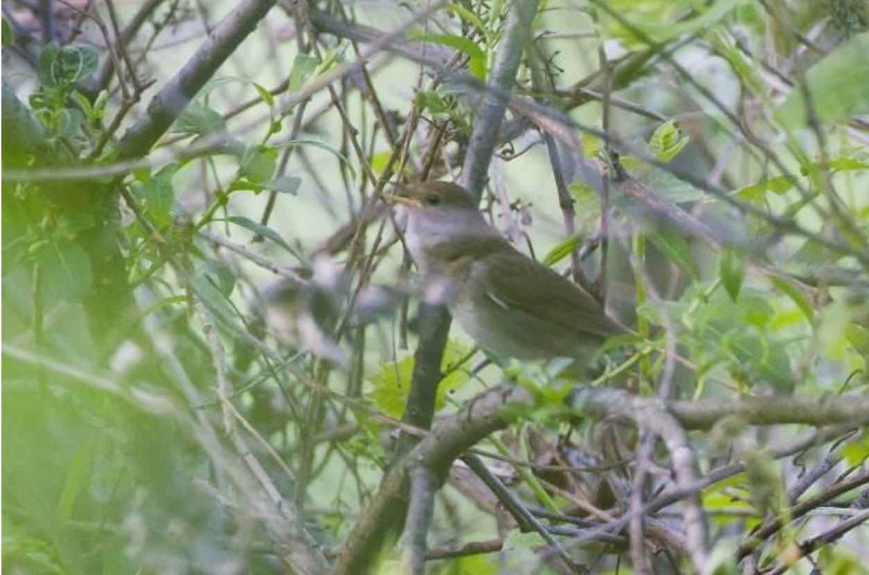
Singing Sombre Tit (top) and Thrush Nightingale (Simay Gábor)