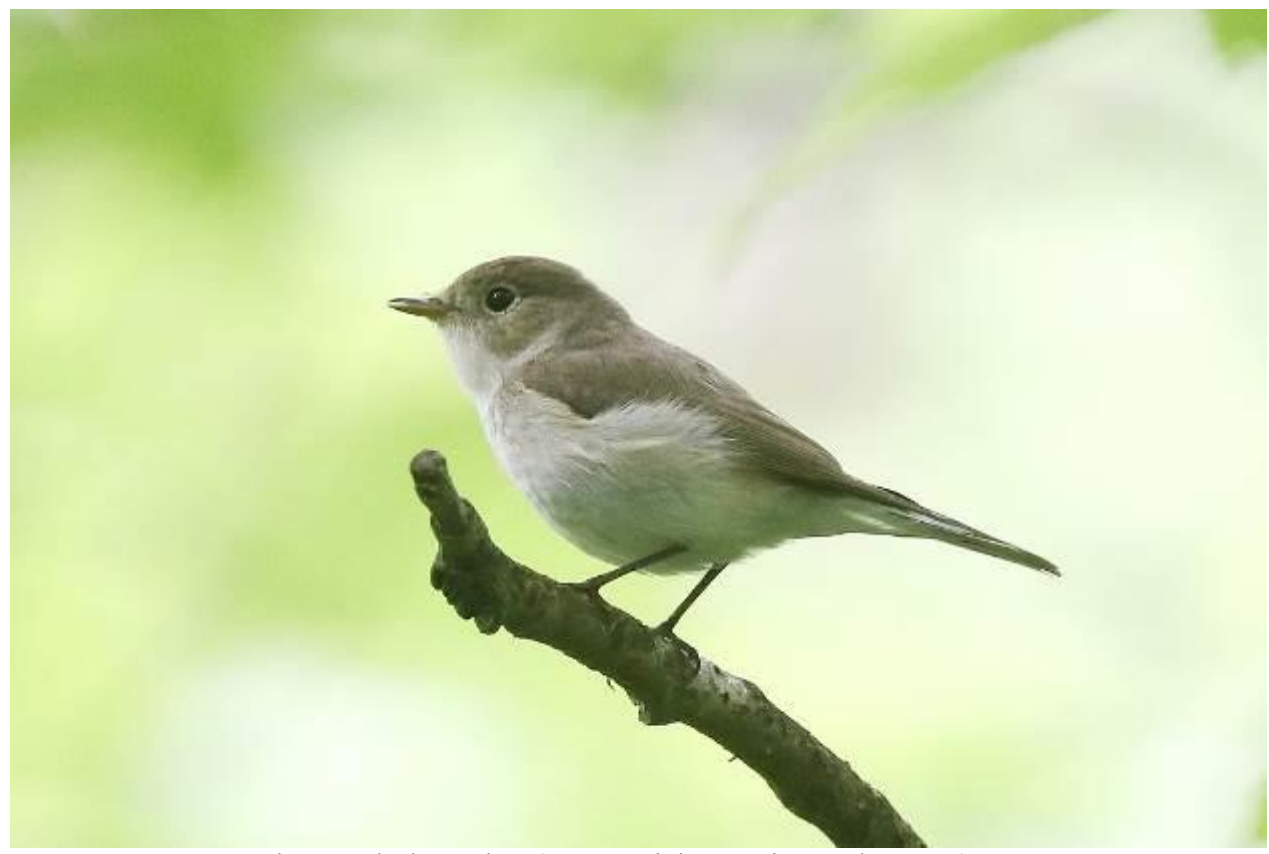
Immature male Red-breasted Flycatcher

spotted Woodpecker, and a Common Redstart here, and also Collared Flycatchers were around. Finally we located two immature male Red-breasted Flycatchers as they were singing and both of them were close enough to provide great views. We also had a Black Woodpecker flying parallel to the road.