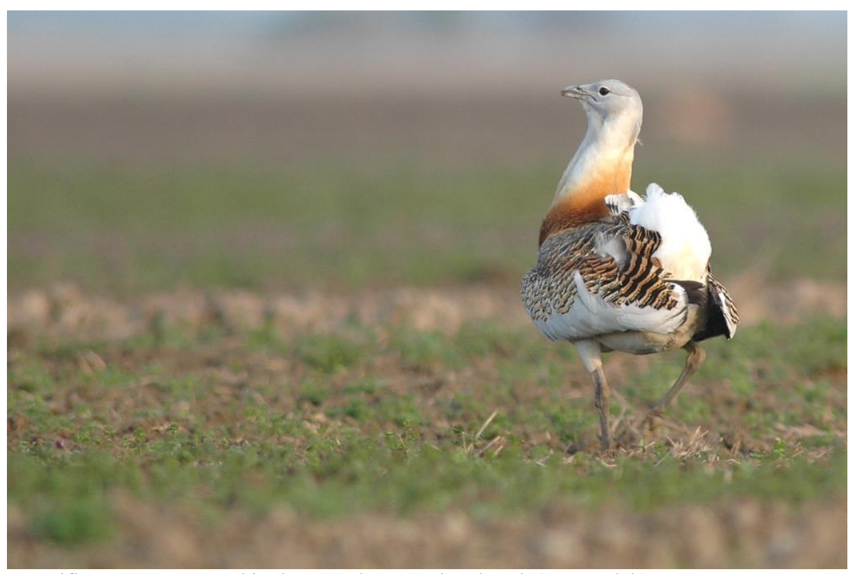
Magnificent Great Bustard in the Hortobágy National Park (János Oláh)

was late spring, the display time was coming to its end, but males are usually still hanging around these places. After a very short walk we spotted seven males of these magnificent birds. They are very shy, but as we had some reed cover we could have good views of them as they were walking around. It is indeed a fantastic bird and the heaviset flying bird on earth! As we still had some time to visit another buffalo grazed wetland where new birds included a nice perched Hobby and a Whinchat on a wire: the last birds of the day. It was a full-action-packed day with great birds!