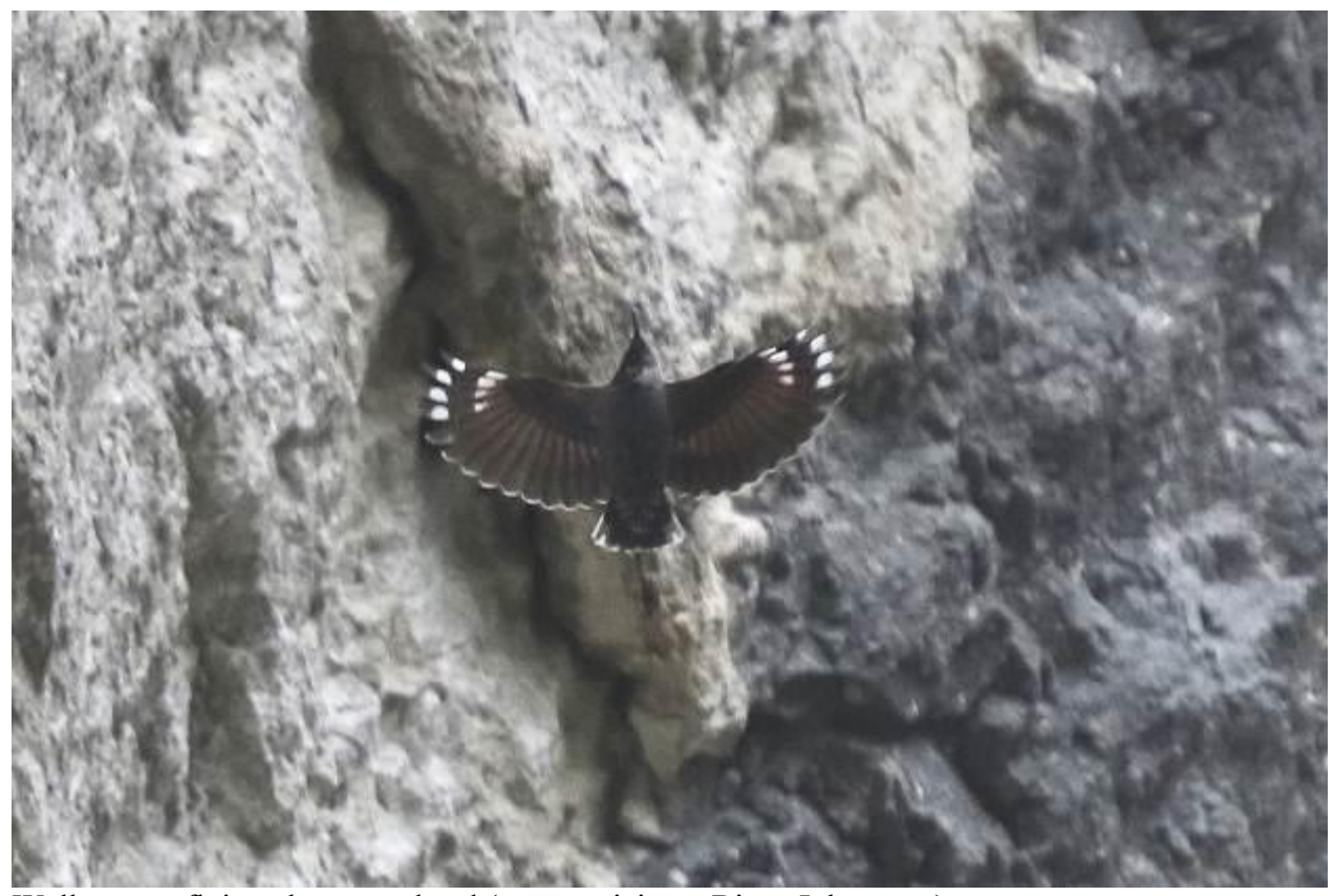
Wallcreeper flying above our head (tour participant Björn Johansson)

were looking for the special Wallcreeper. You can walk along the cliff face or sit around (the latter is better considering the traffic) both strategy can be good. We opted for the sitting around and after about 10 minutes the first bird appeared quite high, flying form one rock face to the other. Later on no less than three birds were flying around often chasing each other along the cliffs. From time to time, they landed on the cliffs, and we had time to set our scopes on them. So eventually everyone had great look of these special birds not only in flight but on the rocks as well. At the background a White-throated Dipper family entertained us as the adult were hunting and swimming in the water, while the juveniles were waiting for them on the nearby rocks.