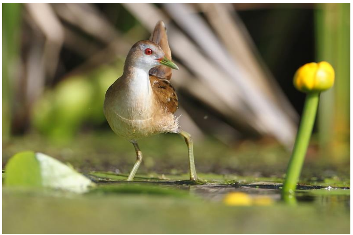
Female Little Crake (János Oláh)

In the afternnon we saw another Saker and also a fine Eastern Imperial Eagle, this time in flight. A few Black Terns were flying around and also Garganeys and a superb male Little Bittern were seen too. We spent a lot of time trying to find a Little Crake, but despite we heard a few we had only glimpses of them. Late afternoon however they became more active and eventually we had fantastic and close views of three different birds! This is a real Central European specialty! This great day was finished in a wine cellar where we tasted plenty of different kind of local (Tokaj) wines and had a fantastic dinner too. From the vinery we drove back to the hotel, where we decided to skip the bird list in such a late hour and leave it for tomorrow morning.