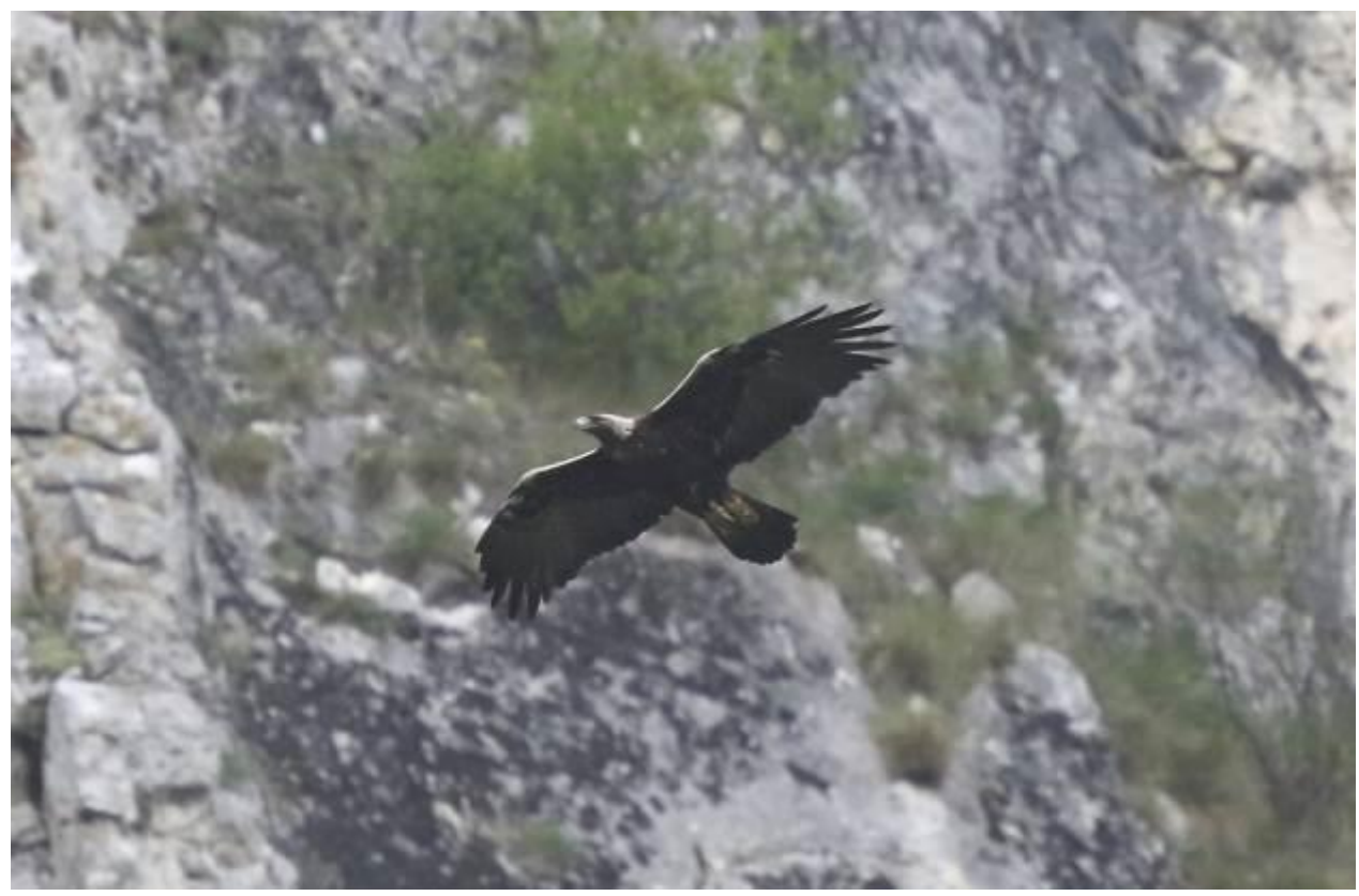
Golden Eagle near Torockó (tour participant Björn Johansson)

Golden Eagle Aquila chrysaetos: Three birds were seen in Transylvania.