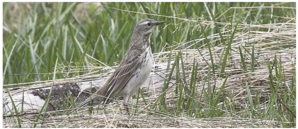
Water pipits were displaying in the Hargita Mountains