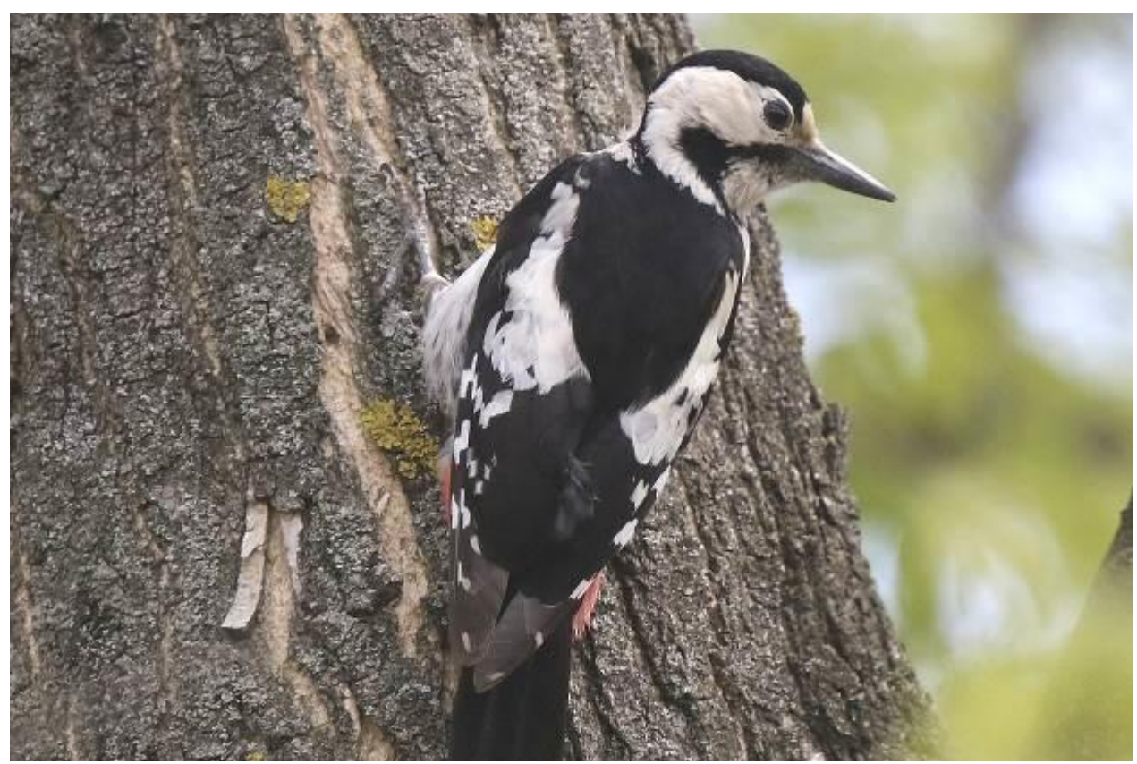
Syrian Woodpecker is a village bird in Hungary

From this bird reach area we drove to the Bíbic nature Lodge in Balmazújváros, to have lunch. The lodge itself is very well located and from its terrace we had an overview of an alkaline pond with grassland around and local breeds of different grazing livestock (we stay here on our autumn tours but in spring it is full with our photography tours). On the pond, among others a few Black-necked Grebes and Ferruginous Ducks were nice to see. On the islands Pied Avocets, Black-winged Stilts and Little-ringed Plovers were sitting on their nests. A small street nearby gave us two long and close views of Syrian Woodpeckers – a typical village bird, always found away from real forests. After a fine meal, we visited a grassland area where Red-footed Falcons were hunting around and nice breeding plumage Ruffs were feeding in the shallow water. We thoroughly checked the wet parts of the area, and we managed to flush one Great Snipe which made a big round around us while we could have a really good view of this scarce species. While we were driving on a rough little road, we stopped by a similar habitat, where we managed to find another Great Snipe, along with plenty of Red-throated Pipits. On a bush, a nice Long-eared Owl was found right in the open, and a male Montague's Harrier also turned up. By a ruined farm building we saw two Barn Owls of the race guttata.