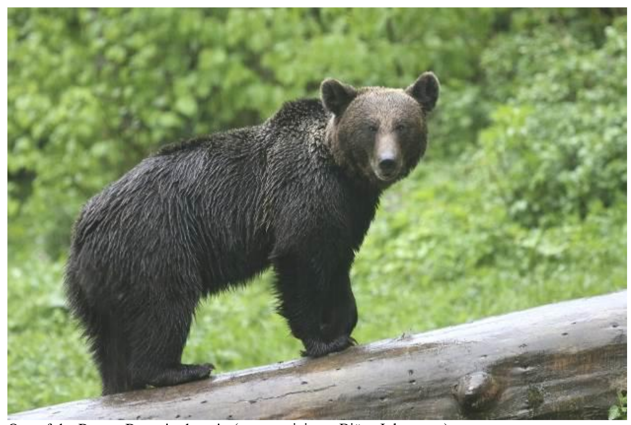
One of the Brown Bears in the rain

we returned to our hotel as it started to rain again and we decided to have a little rest instead of going out in the heavy rain. Later on we took a short walk around though it was still raining. A few White-throated Dippers – one adult, but more freshly fledged juvenile – were seen along the nearby streams. However an ecxiting activity was still coming up for the evening: Carpathian Brown Bear watching! Sakertours now operates sveral bear hides in the region and we picked one which had good activity recently. It was still raining but after a short drive and a little walk we got to the hide. The Brown Bear population is strong and stable in the surrounding mountains, but one has a small chance to meet a bear without a good hide. Though we had to wait about an hour without any bears, eventually they arrived and during the evening we saw no less than seven different bears: small young females, older females and also two huge males. Five bears were the maximum in front of us at one time. It was an amazing evening a fine ending to our somewhat rainy day.