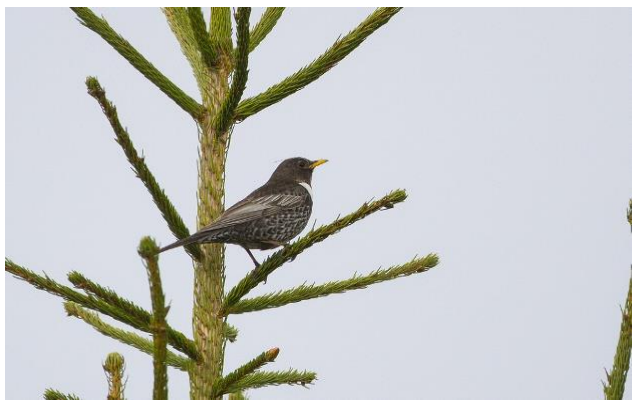
Ring Ouzel (Simay Gábor)

Eurasian Blackbird Turdus merula: A common species, recorded on 12 days.