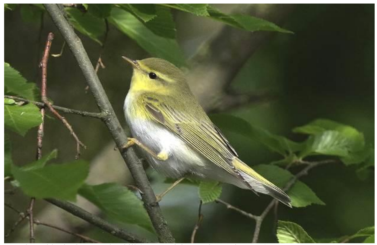
Wood Warbler in the Zemplén-hill (tour participant Björn Johansson)

Blackcap Sylvia atricapilla : We heard them singing on seven days, but we saw them only on a few occasions.