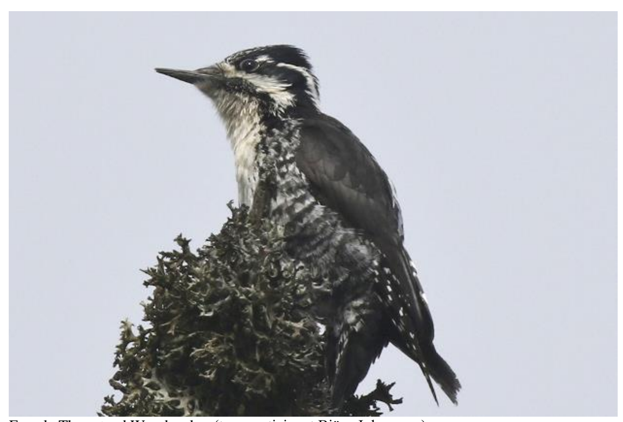
Female Three-toed Woodpecker (tour participant Björn Johansson)

The walk back was easier in the good weather with more Firecrests and other common birds along the trail. We drove close to the peak and had a nice coffee and the nerby grassy area had a few displaying Water Pipits. We had lunch in a restaurant down in the valley and after that