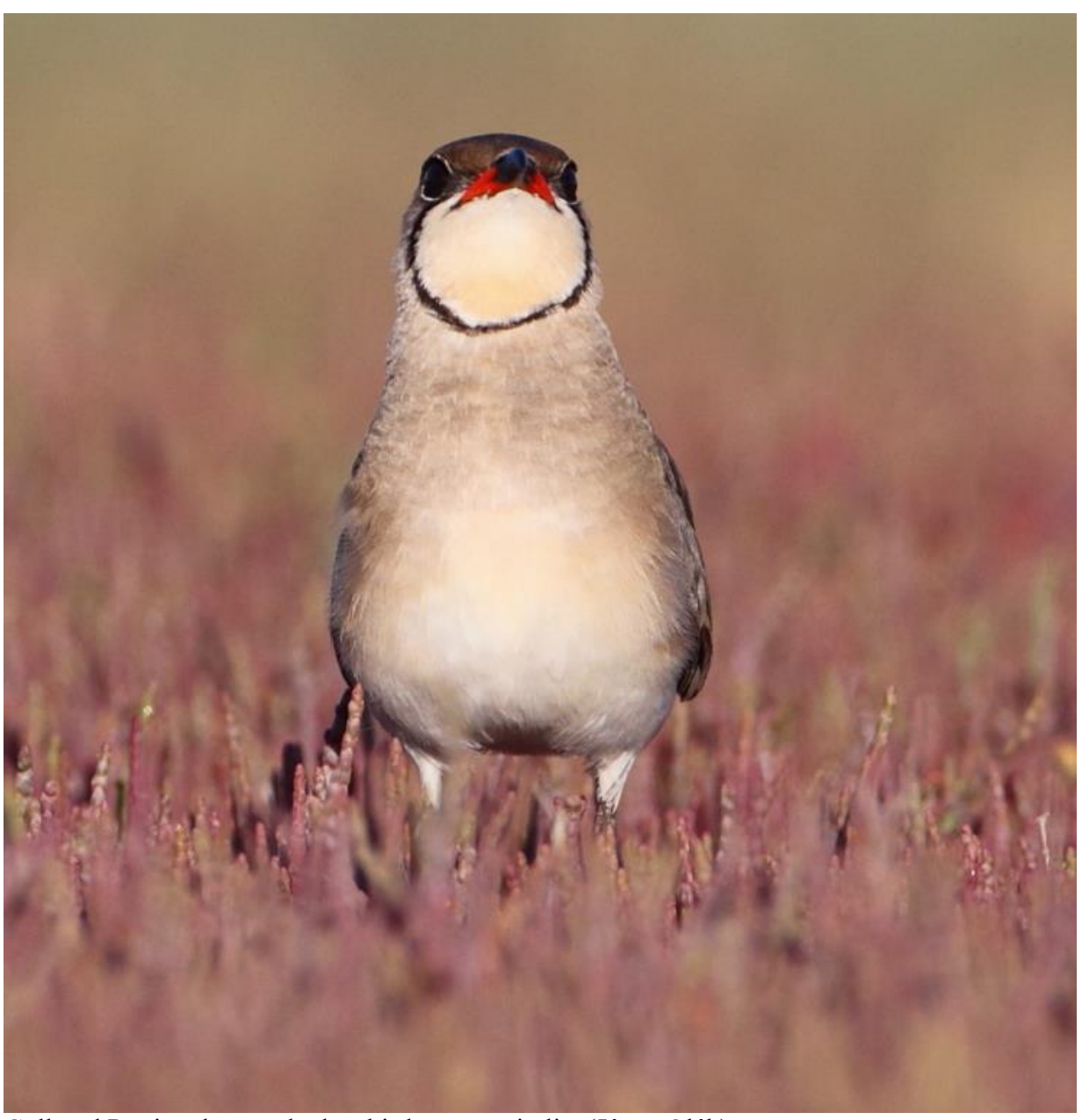
Collared Pratincole was the last bird on our trip list (János Oláh)

ground. These amazing waders are in sharp decline all over their European breeding grounds and it is a very prized bird to see nowadays. In Hungary we only have 60-80 pairs breeding. This was the last new bird for our bird-filled Hungary, Slovakia & Transylvania GT in 2017, and species number 223. We arrived in time to the airport where we said goodbye to each other after a productive 12 days, during which we had many good species, many good views. In general we spent some really good time in the three countries and visited an amazing selection of habitats.