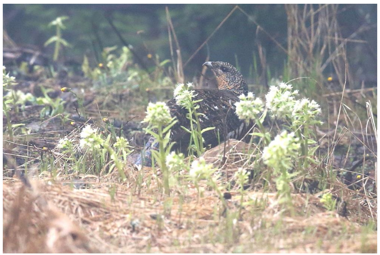
Roadside Western Capercaillie in the Hargita Mountains (János Oláh)