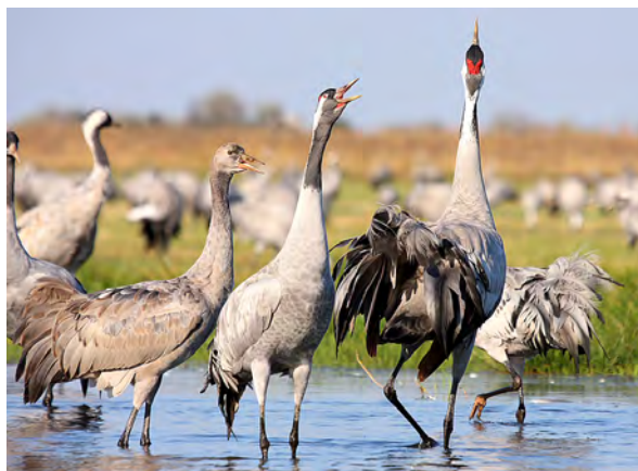
Photos (clockwise, from top left): Hortobagy highlights... juvenile Red-footed Falcon • Saker • Juvenile Dotterel • Common Cranes • juvenile Little Crane • Broad-billed Sandpiper

report compiled by tour leader: Gabor Simay