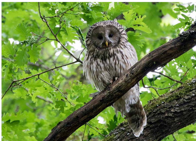
Every Spring group had seen Ural Owl

We do kindly ask please do not upload a nesting sites of any bird species seen on these tours with GPS coordinates to any website! Thank you for understanding!