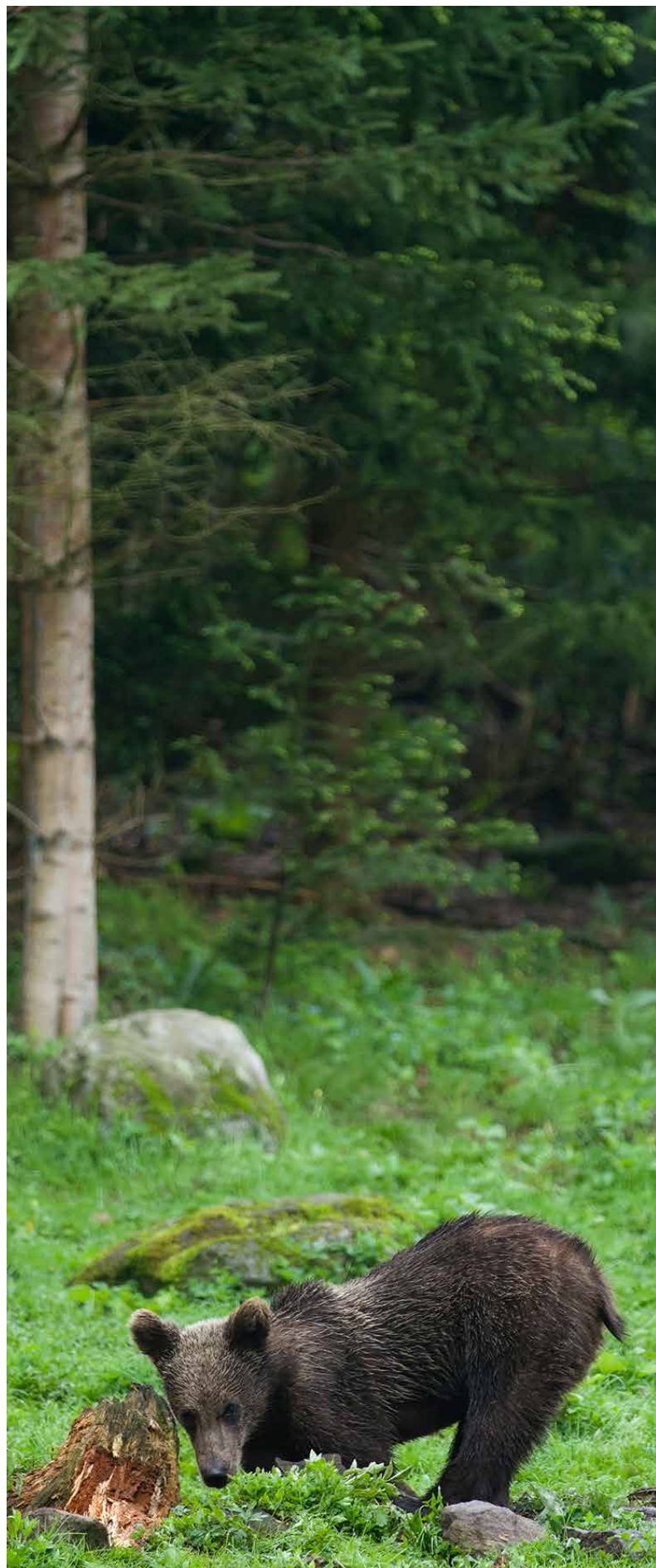
Bear cub looking for food