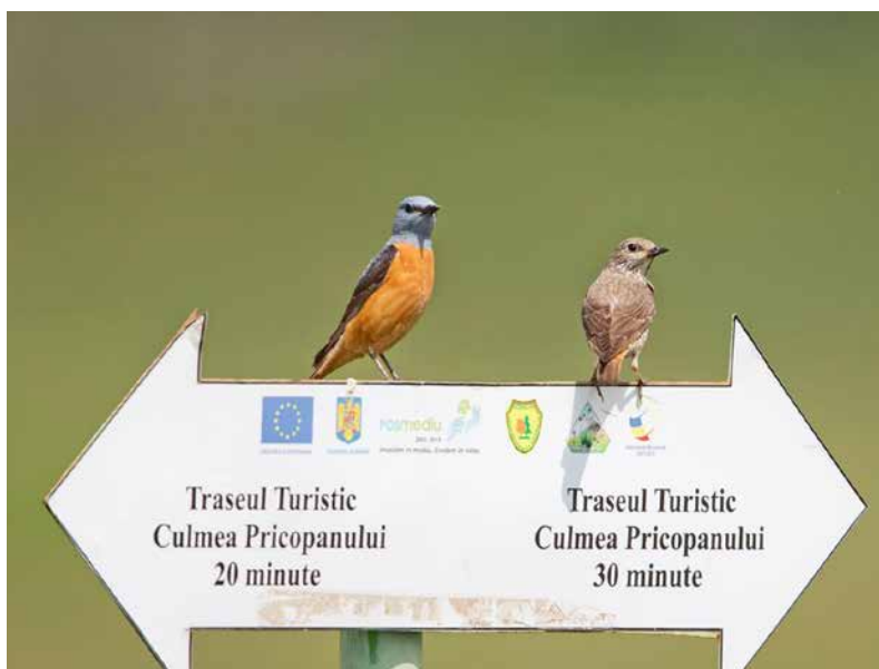
A pair of Rufous-tailed Rock Thrush