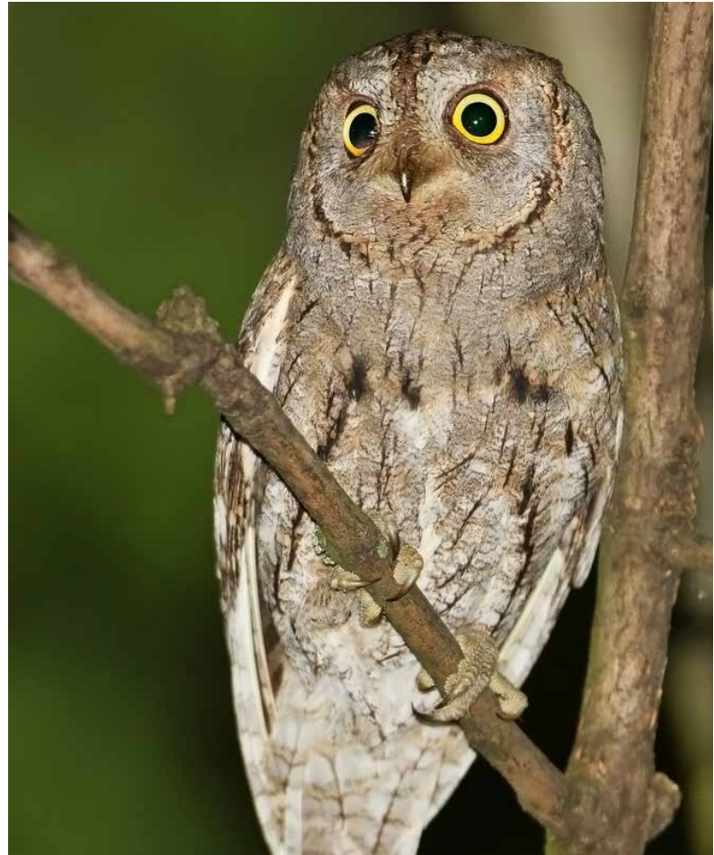
Scops Owl in Transylvania

• In 2017 we will welcome yet another birding tour on our itinerary. This is the Transylvania Birding Tour which has been developed to see this fantastic area in the very best time. It was created for those who wish to discover this region's exciting nature and birdlife within a full tour and it features highlights like Corncrake, Three-toed and White-backed Woodpeckers, Ural, Pygmy and Scops Owls, Wallcreeper, Shore Lark, Red-breasted and Collared Flycatchers, Rock Thrush etc. For more information click HERE .