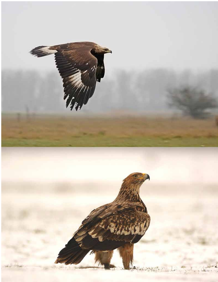
Golden and Imperial Eagle

The year started with the usual Eagle Photography and all the hides worked perfectly well. Everybody had seen and photographed White-tailed Eagles, some had the chance to take pictures in real winter because we had several weeks of cold frosty conditions and even snow cover in January. Also more and more Eastern Imperial Eagles are seen from the hides! The most unique morning however was when White-tailed Eagle, Imperial Eagle and a Golden Eagle were seen on one tree right in front of the hide! Special!