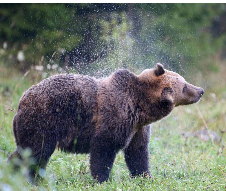
Brown Bear after rain in Transylvania

Please visit our HIDE PHOTOGRAPHY TOUR CALENDAR for dates, availabilities and extra information!