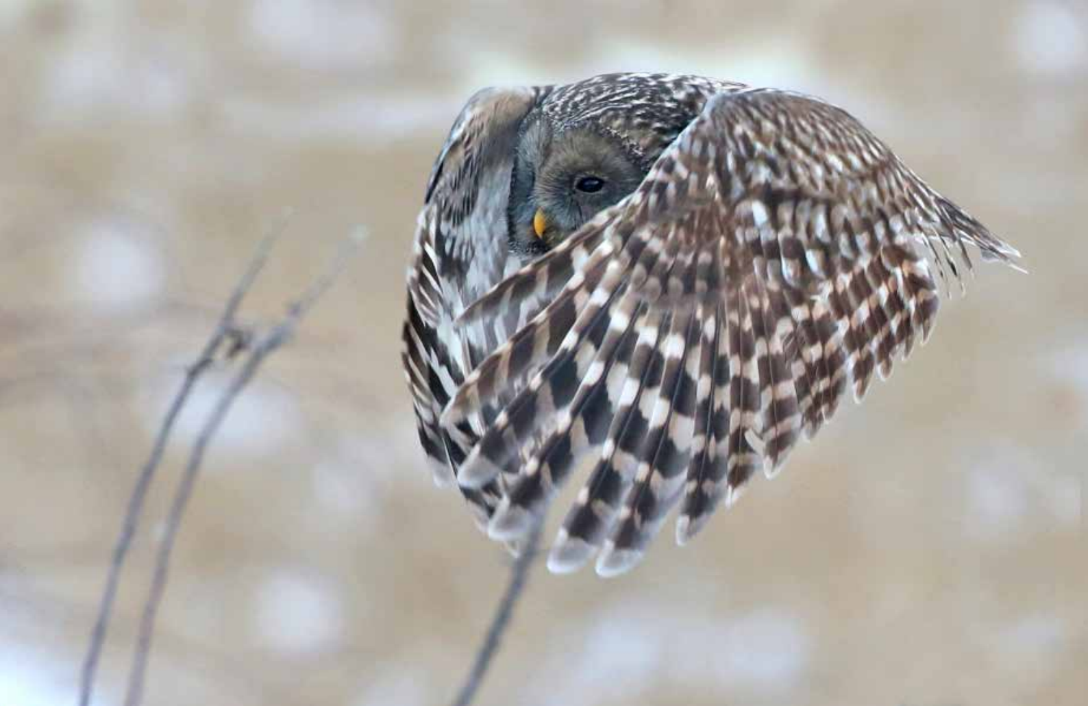
Ural Owl in winter

With best wishes for Christmas and the New Year from everyone at SAKERTOURS