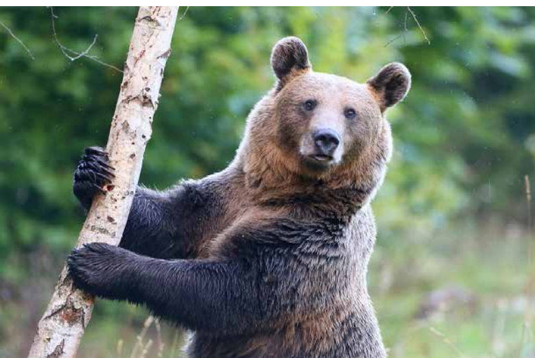
Brown Bear

We are looking forward to a great season again in 2017. Please visit our Transylvania BLOG for more pictures.