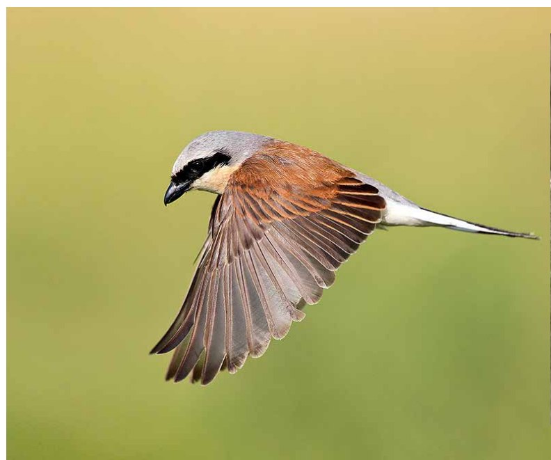
Red-backed Shrike from a new 'Shrike' hide