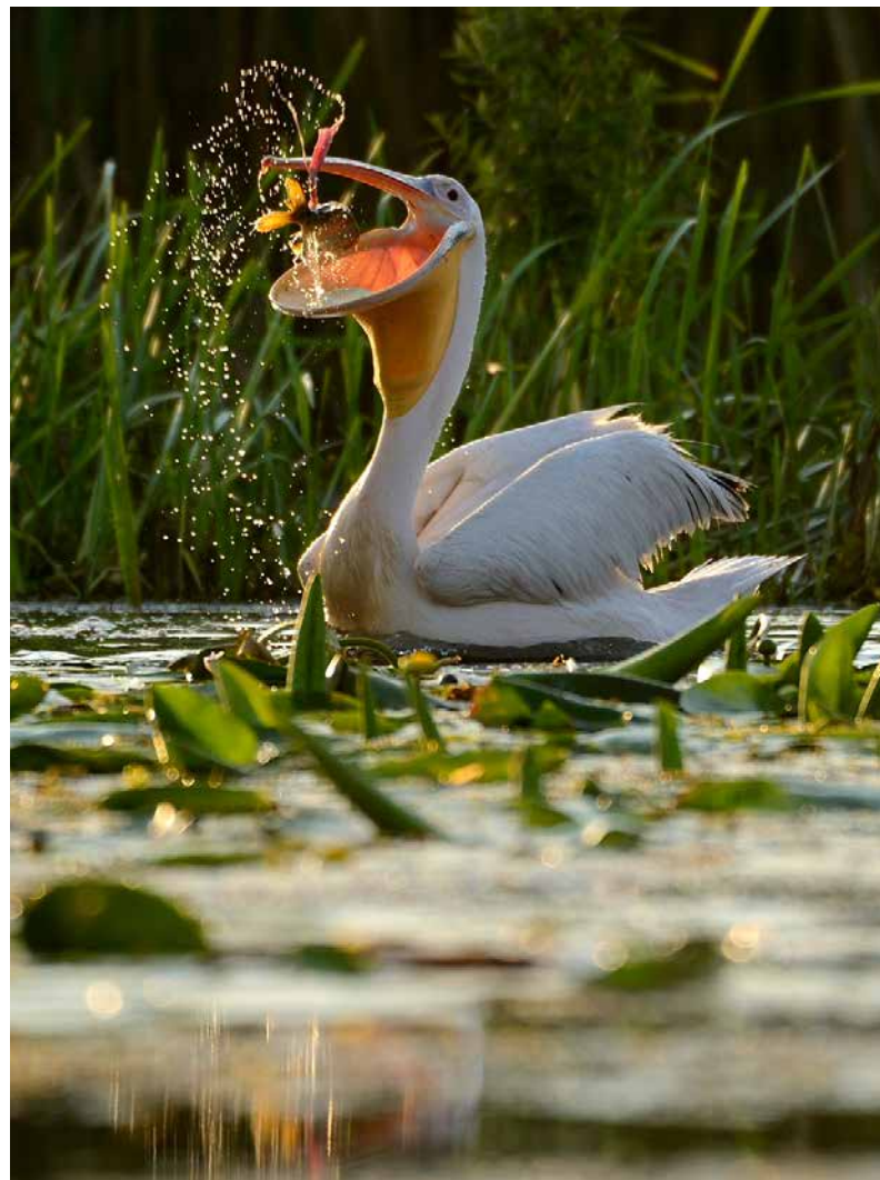
Fishing White Pelican