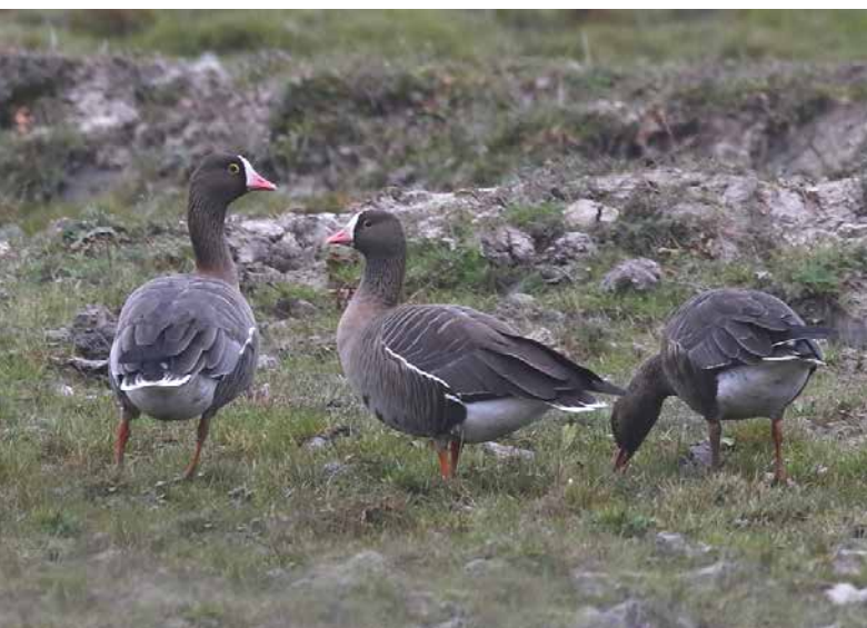
Lesser White-fronted Goose from the Hortobágy

• In 2017 we will welcome yet another birding tour on our itinerary. This is the Transylvania Birding Tour which has been developed to see this fantastic area in the very best time. It was created for those who wish to discover this region's exciting nature and birdlife within a full tour and it features highlights like Corncrake, Three-toed and White-backed Woodpeckers, Ural, Pygmy and Scops Owls, Wallcreeper, Shore Lark, Red-breasted and Collared Flycatchers, Rock Thrush etc. For more information click HERE .