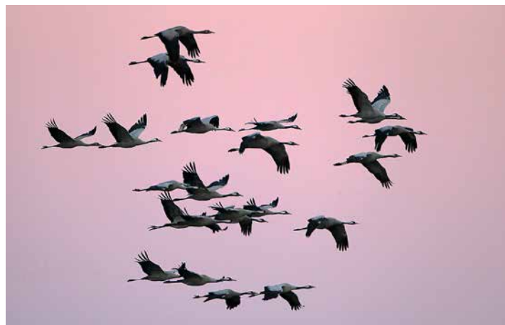
Cranes in the sunset

Late August and early Septmeber is the short period when drinking, bathing and roosting Cranes can be photographed.