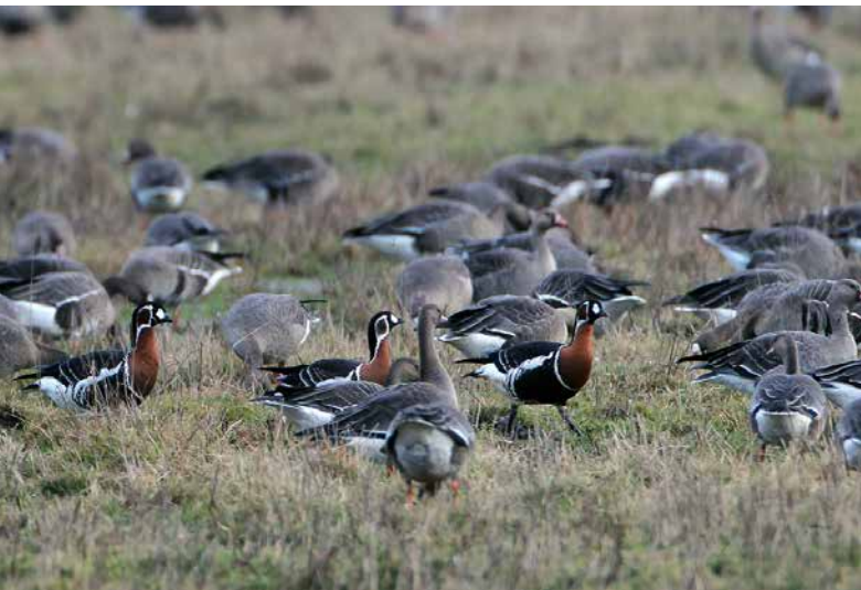
Red-breasted Goose from the Hortobágy