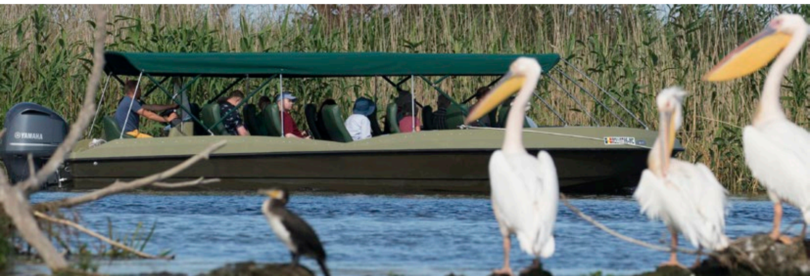
The "Harrier" wildlife watching boat of Sakertours

The 'Harrier' wildlife watching boat was designed and custom-built in 2019 and quickly become a first class boat to discover the Danube Delta wildlife in the most comfortable and safe way on our tours!