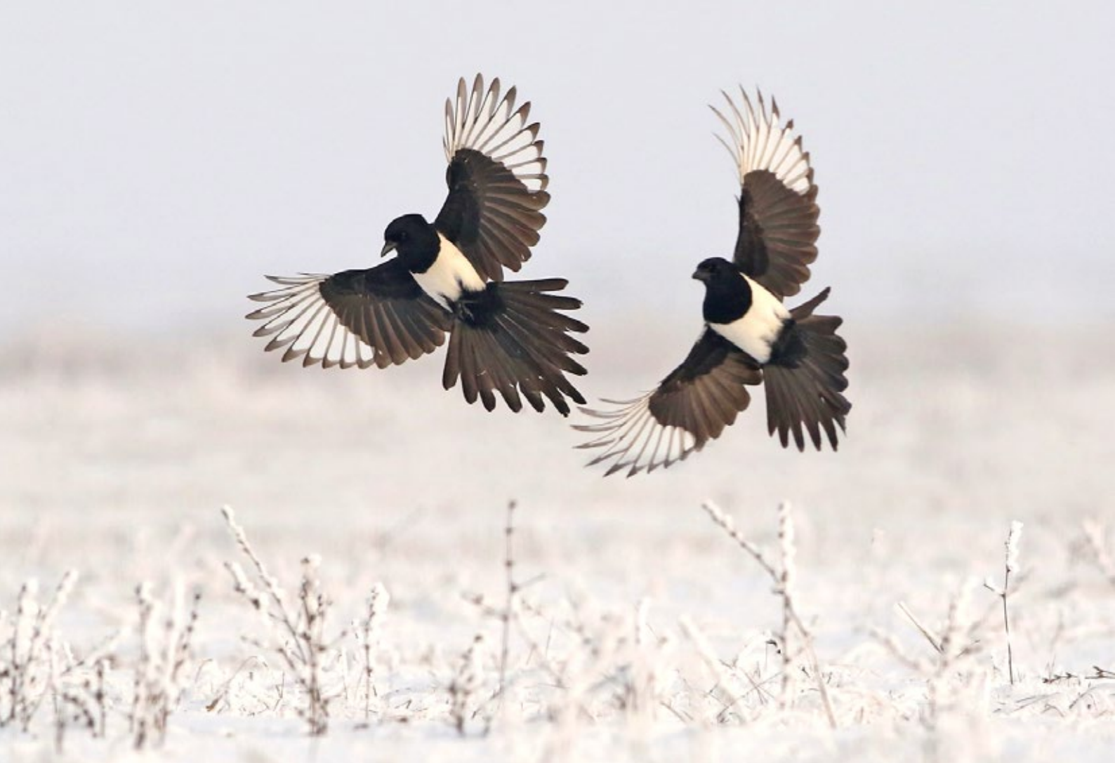
Magpies in flight

With best wishes for Christmas and the New Year from everyone at SAKERTOURS