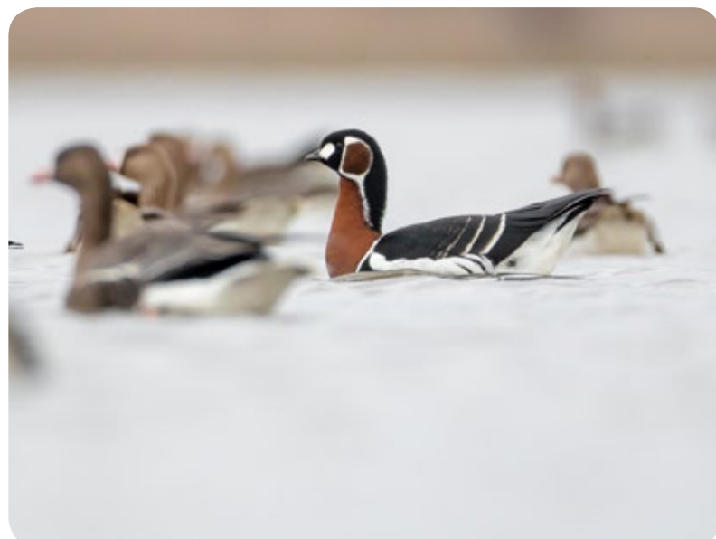
Red-breasted Goose in the Hortobágy