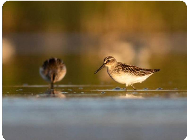
Broad-billed Sandpipers from the Danube Delta