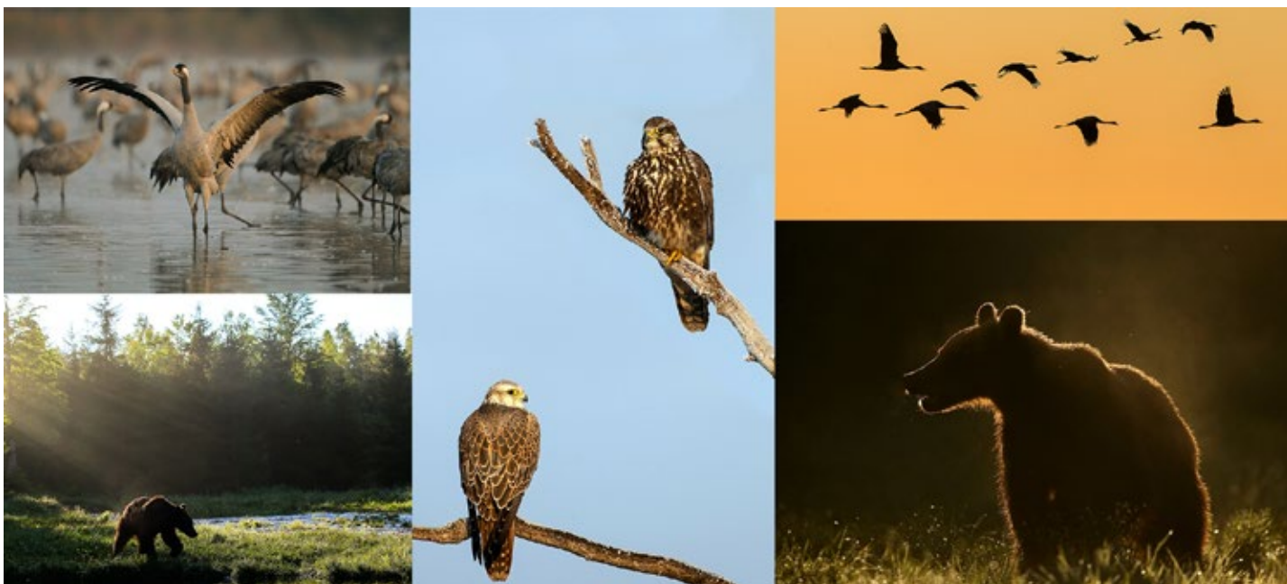
Cranes at roosting site, Brown Bear in backlight and Saker Falcon amongst 2020 new offers

• Pallas's Gull Photography. On all our Danube Delta tours in 2020 we will make special efforts to photograph Pallas's Gull around the inner lakes of the Delta, where they usually hang around with Pelicans and Cormorants. In 2019 we were successful and keep working on this truly special subject!