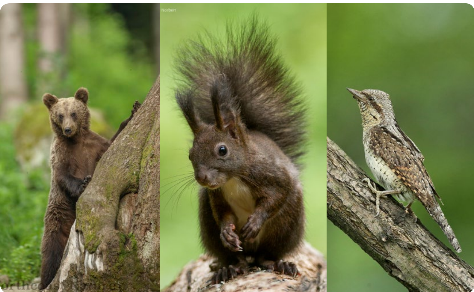
Brown Bear; Red Squirrel and Wryneck

Please visit our Transylvania Blog for more pictures!