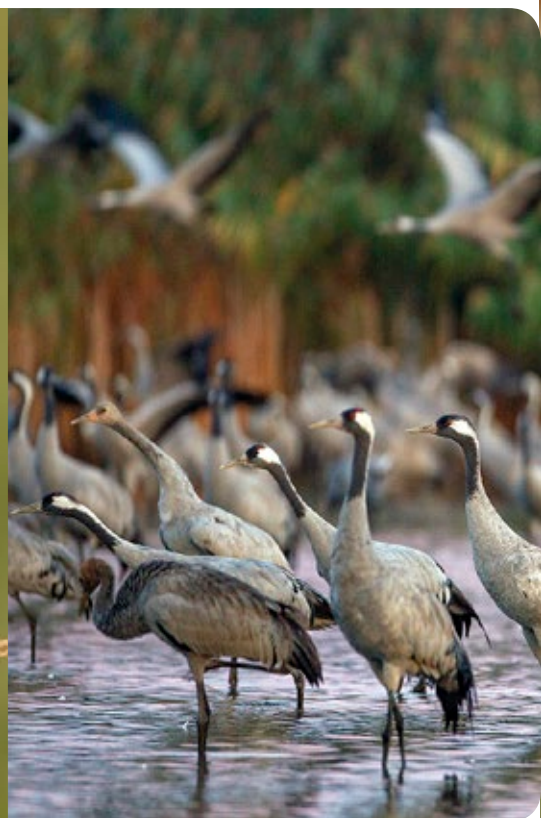
Saker Falcon; mating Red-footed Falcons; and Common Cranes