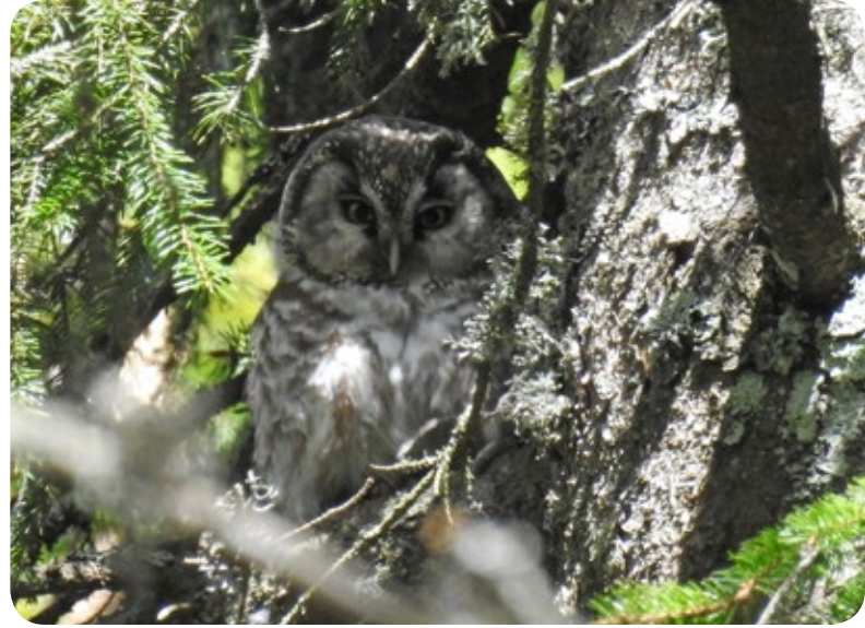
Tengmalm's Owl in Transylvania