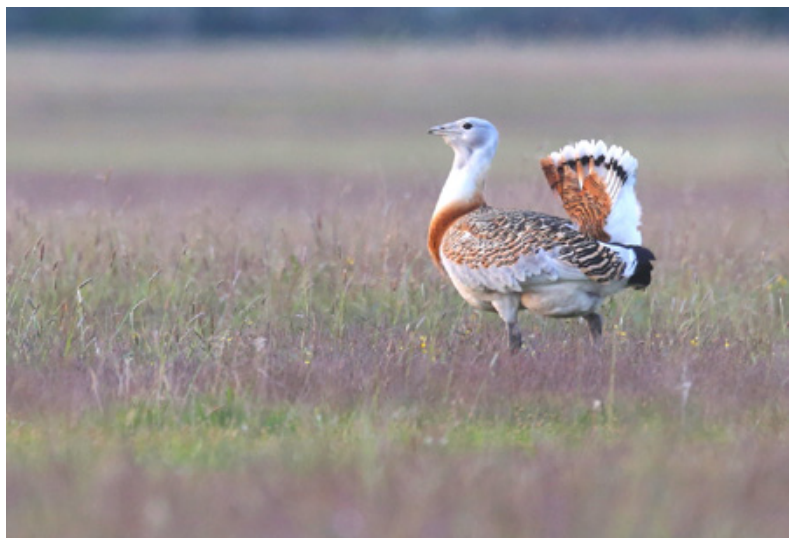
Displaying Great Bustard from Hortobágy