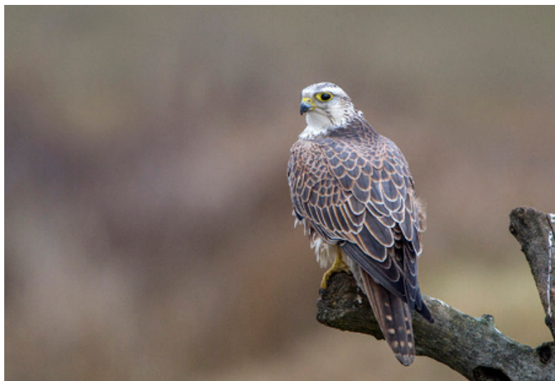
A male Saker Falcon in front of our photo hide

In such year like 2020 we could spend some time in our Great Bustard hide . Not an easy subject to photograph it but late April offered us the best results so far and clearly the more time you spend in a hide the more results you get! It is a great experience to watch these amazing birds as the huge males are filling their gular sacks and displaying to the females.