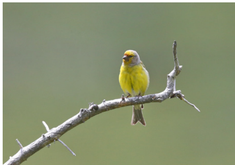
Citril Finch

Please visit our BIRDWATCHING TOUR CALENDAR for dates, availabilities and extra informations!