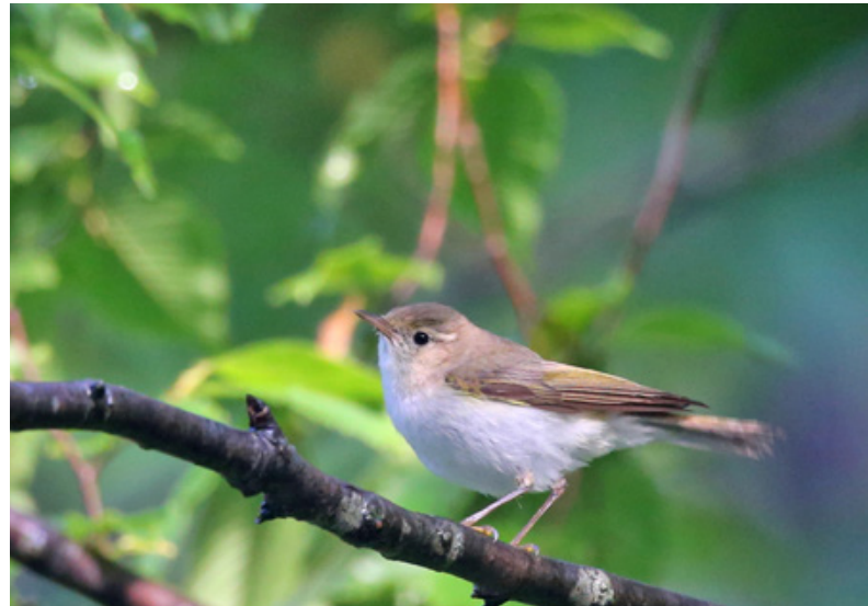
Western Bonelli's Warbler

You can find more informations in our website. The 2021 birding dates are online.