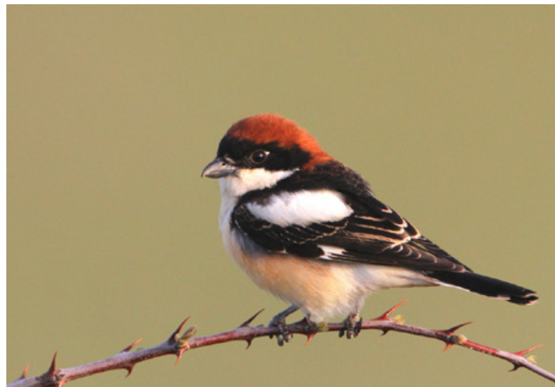
Woodchat Shrike