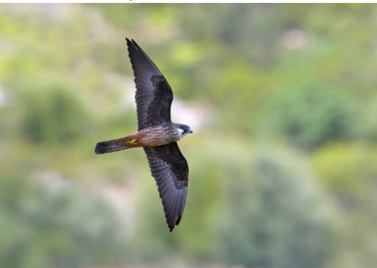
Eleonora's Falcon is a Mediterranean specialty