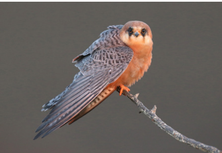
A superb looking female Red-footed Falcon