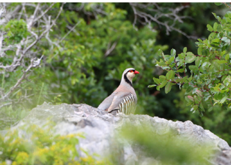
Rock Partridge, another specialty of the region