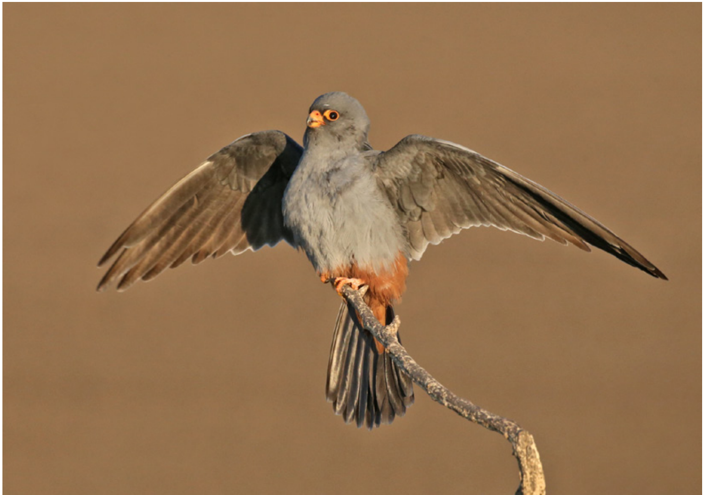
A male Red-footed Falcon enjoying the first ray of sunlight back in April 2020