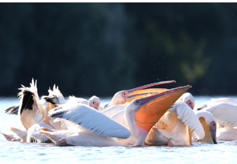
Fishing group of White Pelicans