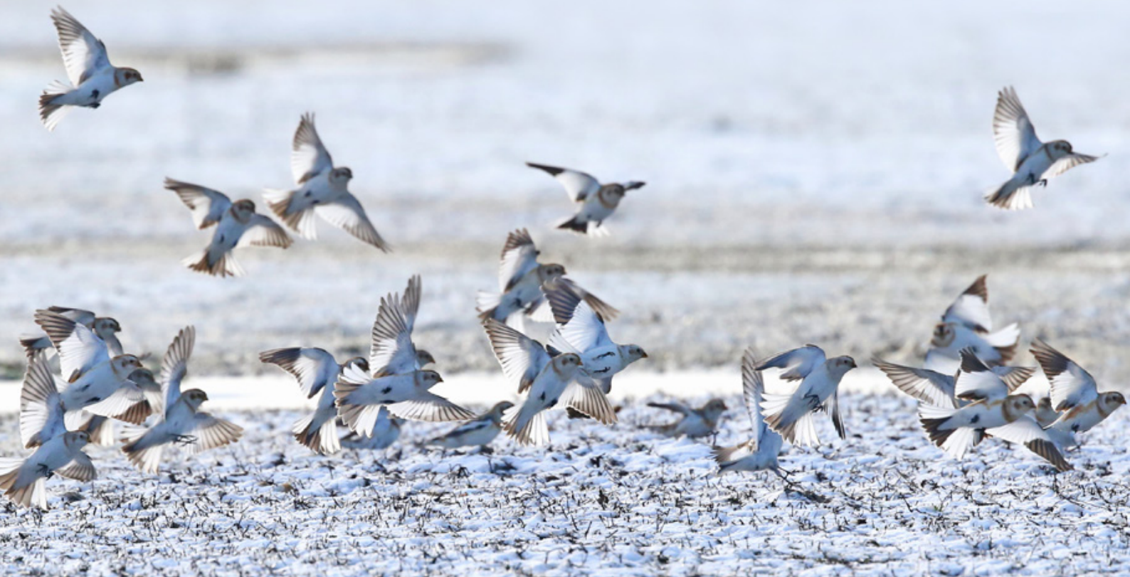
A flock of Snow Bunting from the Hortobágy National Park

With best wishes for Christmas and the New Year from everyone at SAKERTOURS