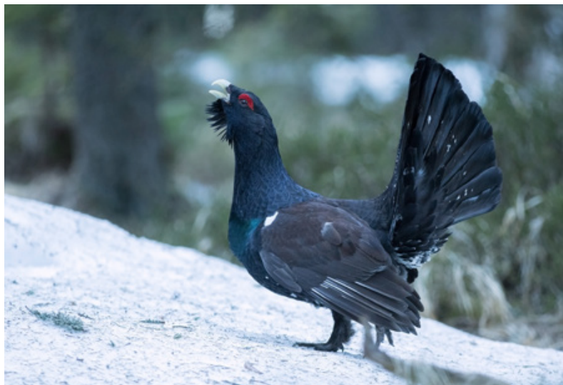
Displaying Caparcaillie from Transylvania