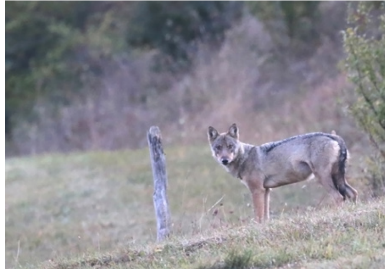
The highlight in Transylvania was a pack of 4 Wolves by a fresh Red Deer kill