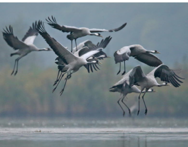
Common Cranes leaving the roosting site

May and June we had our standard hides for great birds like Red-footed Falcons, Rollers, Bee-eaters, Hoopoes, Lesser Grey Shrikes, Little Owls and a selection of waterbirds in the Hortobágy..