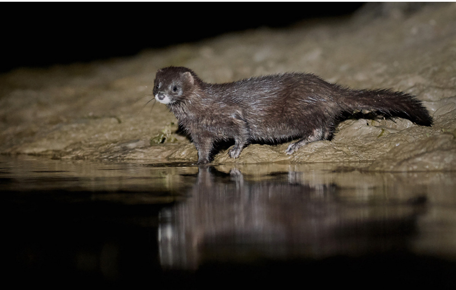
An unforgettable highlight on our first Mammal watching tour was this beautiful European Mink in the Danube Delta

Please visit our BIRDWATCHING TOUR CALENDAR for dates, availabilities and extra informations!