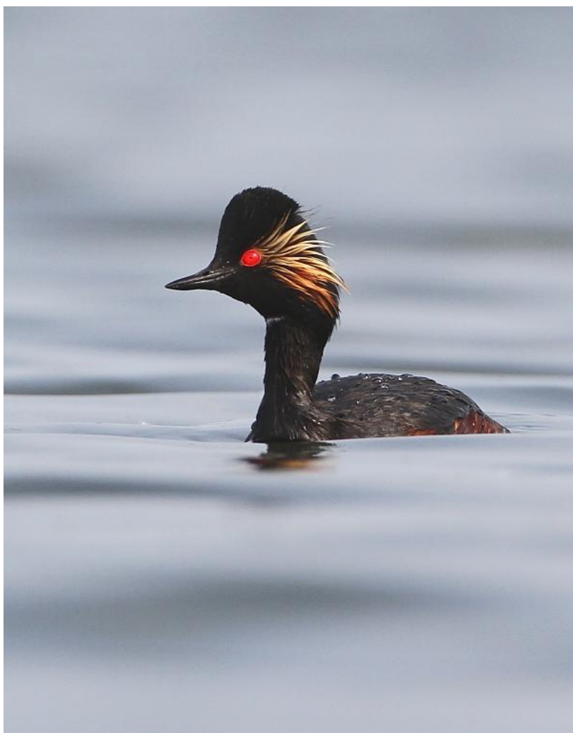
Black-necked Grebe