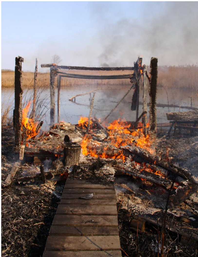
Sad moments: Pygmy Cormorant Hide in early March 2012