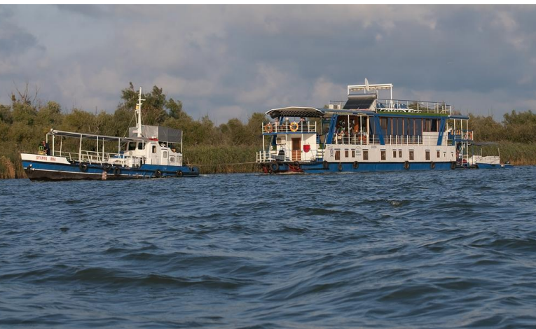
A 'floating hotel' on the move

House boats or pontons are special accommodations of the Danube Delta. Actually it is a floating hotel with different room capacity. The most widely used ones has place for 18 to 20 persons on double rooms. In fact that nowadays a birding group size rarely reaches 12+ participants, smaller boats can be much more cost effective. Smaller house boats have a capacity for 10 persons on 5 double rooms. For more information's or a customized offer please ask our office.