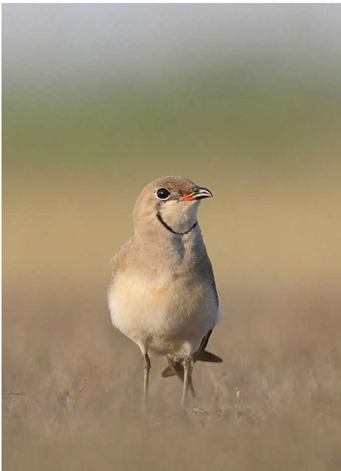
Adult Collared Pratincole

We had an exceptionally good year and hopefully lots of satisfied guests, with a huge variety of excellent images!