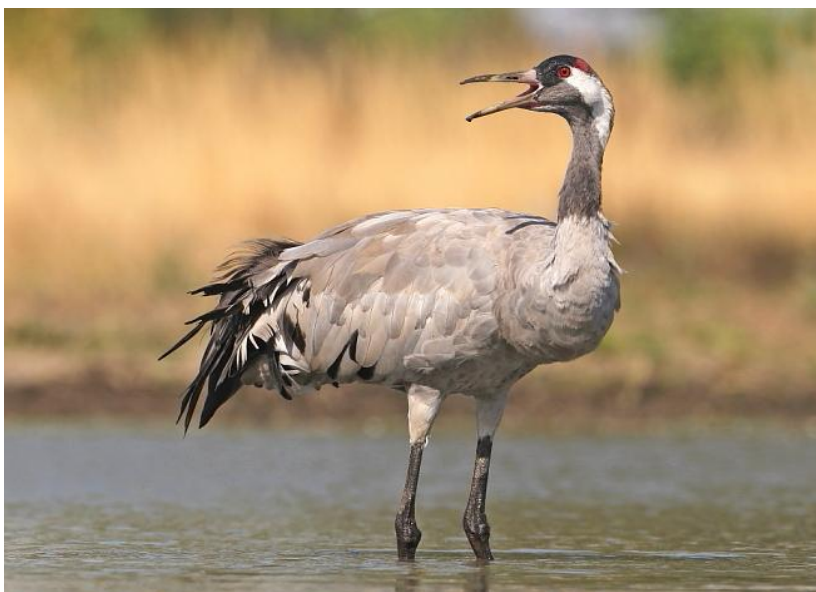
A thirsty Common Crane from the past season