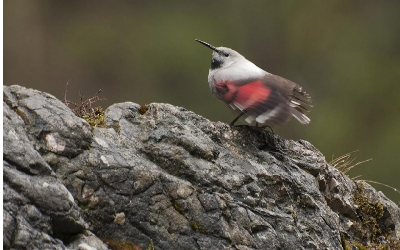
Wallcreeper in Transylvania

You can read the full trip report here .