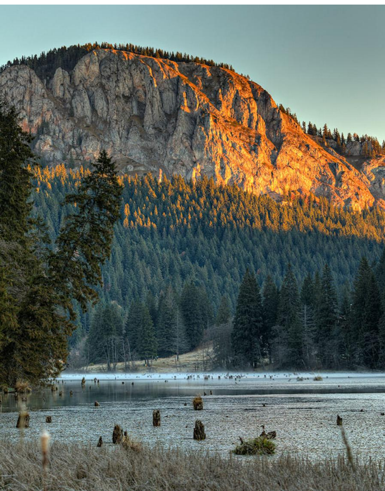
The Bicz Gorges National Park