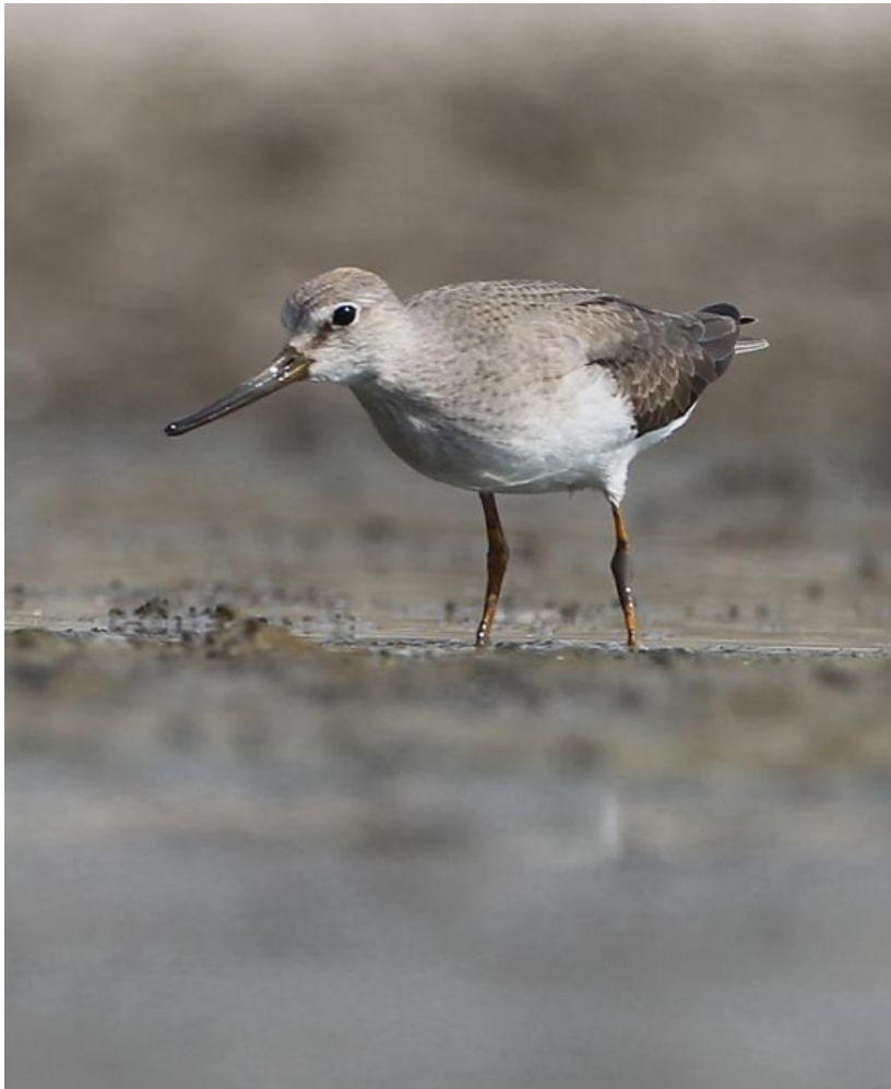
Juvenile Terek Sandpiper in the Hortobágy

Our 2013 dates to Hungary and Romania are online!