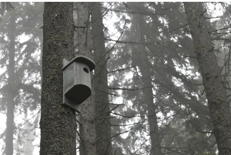
Nestbox for Tengmalm's Owl in Transylvania

Two years ago we found a more accessible Tengmalm's Owl territory, where several nest boxes were installed in the autumn of 2012.