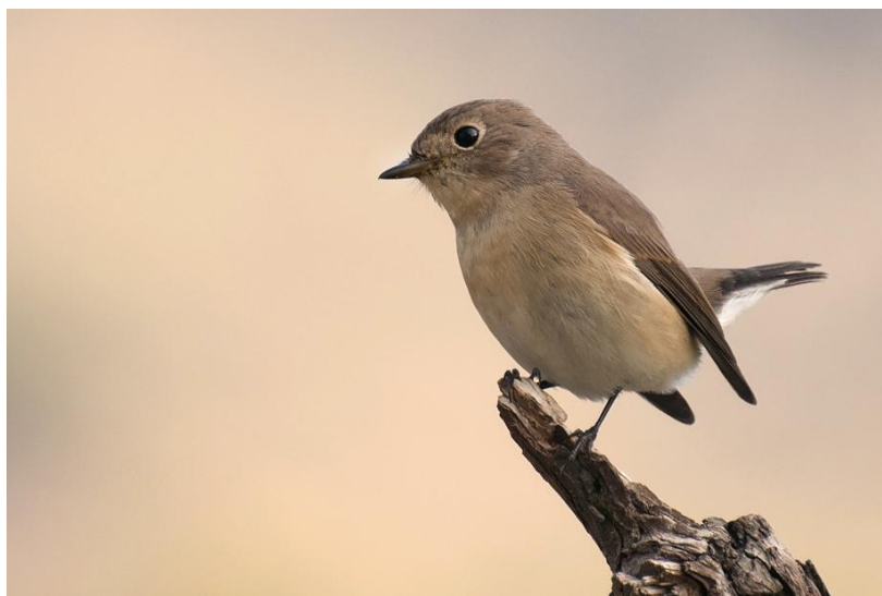
Red-breasted Flycatcher on migration