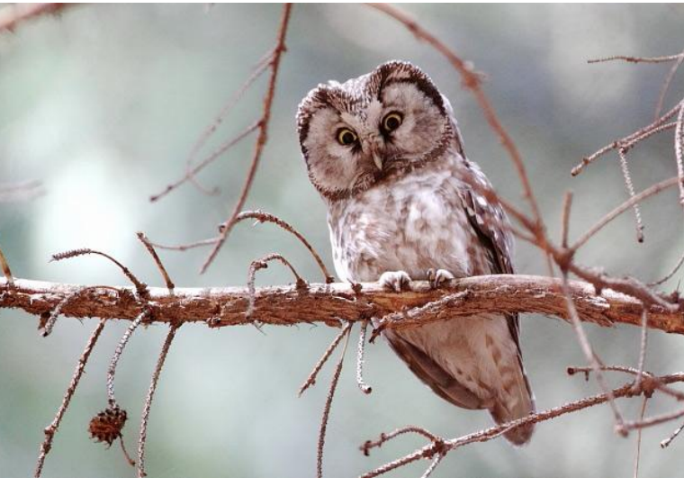
Male Tengmalm's Owl in Slovakia

Our 2013 and 2014 dates for this superb GT tour is online!