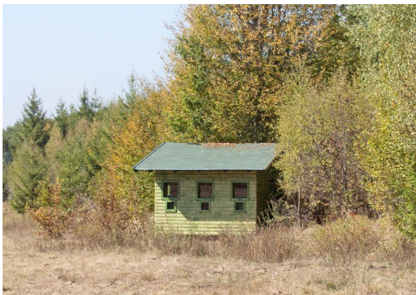
Brown Bear photo hide in Transylvania