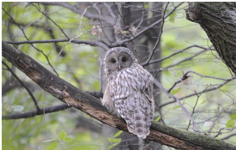
Ural Owl in the Zemplén