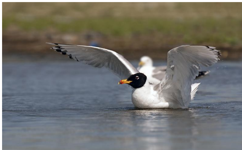
'King of the Gulls'