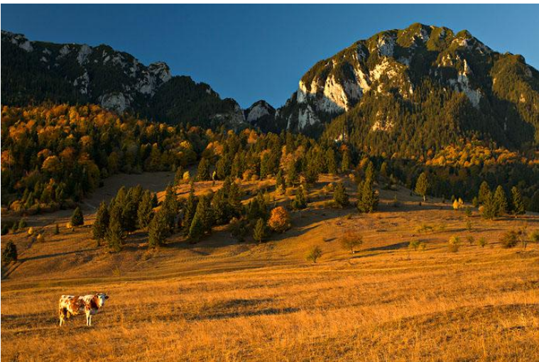
The Pietra Craiului / Királykő National Park