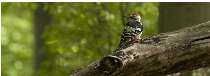
White-backed Woodpecker in Transylvania

This species is regularly seen on our trips when we visit the Zemplén Hills where an impressive population of about 150 pairs present.