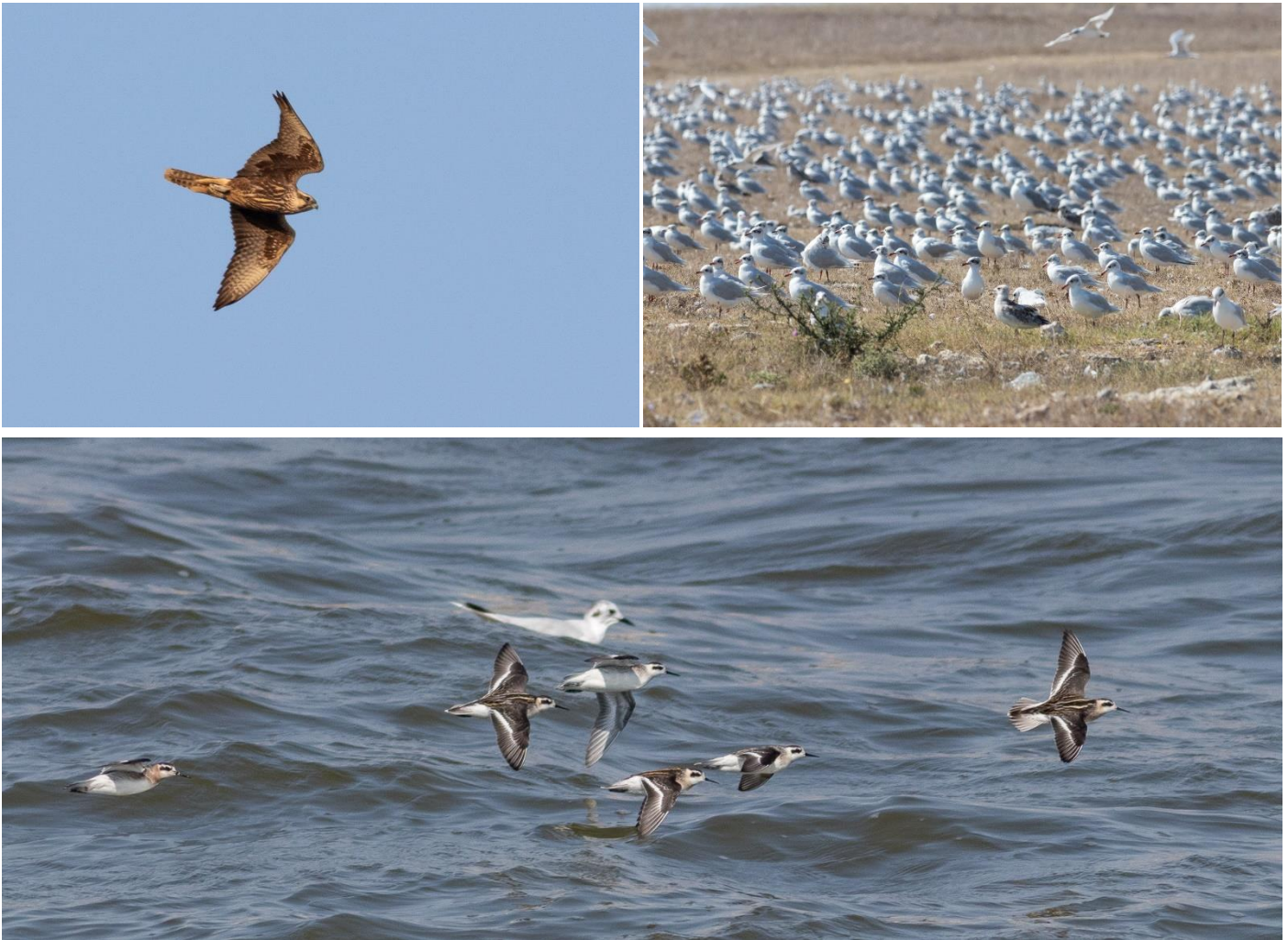
Saker Falcon seen on the first day (top left), tiny part of a huge Mediterranean Gull flock (top right) and Red-necked Phalaropes (Dániel Balla)

After meeting each other on the airport near Bucharest we straight drove to a small bay with a shallow wetland nearby close to Constanta. Here we saw the first flock of Broad-billed Sandpipers of the tour just to have a cracking start. We had great views of Marsh Sandpipers and other waders as well as Red-rumped Swallows at the same site. On the sea we spotted the Black Sea Harbour Porpoise from an unusually close distance just before leaving. Driving towards our first hotel we had time so just stopped at the usual quarry we are always visiting, where we collected Pied Wheatear and Northern Wheatear just after close views of a magnificent Saker Falcon hunting in front of us. We watched Short-toed Eagles circling up and a Long-legged Buzzard just to complete the list of raptors here. As we were quite close to the hotel, we could visit one more wetland just near the road where we picked up the first Red-necked Phalaropes and Ferruginous Duck.