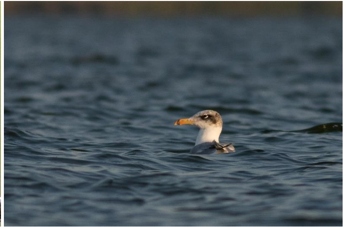
Semi-collared Flycatcher and Pallas's Gull (Dániel Balla)

We had a lunch and a short break in the middle of the day to skip the hottest period of the day and went out to the Sachalin Island in the afternoon. The area has not disappointed us as the shore and water were covered with birds for several kilometres. We saw hundreds of Spotted Redshanks, Black-tailed Godwits, groups of Great White Pelicans and Dalmatian Pelicans. A huge mixed flock of different terns including Gull-billed, Sandwich, Black and Caspian Terns were around from a few individuals were always hanging around our boat. We had very good scope views on several Grey Plovers a few in stunning breeding plumage as well as a Bar-tailed Godwit which was simply shining on the shore in the best afternoon lights. The crown on the afternoon however were the Pallas's Gulls which we counted a total of 8 individuals from a close distance.