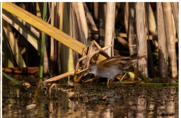
Red-necked Grebe (left) and male Little Crake (right) from our boat (Dániel Balla)