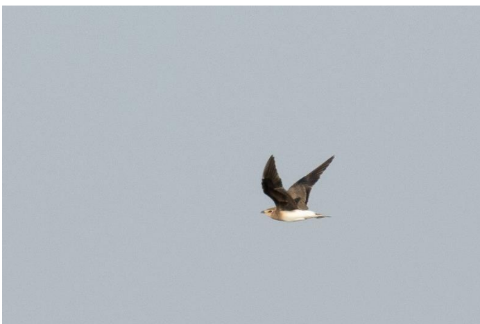
Black-winged Pratincole (Dániel Balla)

It was time to go back to Bucharest to reach everyone's flight. On the way to the airport we had a lunch in a restaurant where we voted for the birds of the trip. After summarizing the points the TOP5 of the trip become the following: