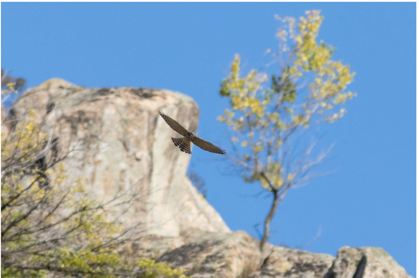
Levant Sparrowhawk (Dániel Balla)

Early morning, we had a fast visit to a bushy area where we heard Thrush Nightingale in the past days to get better views which we succeeded with. After breakfast we rapidly got back to the car by boat to have enough time for the Macin Mountains area. In the Macin area we put Wood Warbler, Black Redstart and Rufous-tailed Rock Thrush in the bag had Hawfinch and Mars Tit again and had prolonged views of an immature Levant Sparrowhawk circling above us sometimes together with Kestrel giving good opportunity for comparison. After lunch we crossed the Danube with a ferry and drove into the middle of the Baragan Lowland to search for Dotterels. As we arrived to the site, we immediately spotted a small flock of this magical shorebird as they were feeding on the grazed steppe area. While getting close to them we spotted other smaller parties around us giving a total count of 27 bird on the site at least. While enjoying the Dotterels a pair of Eurasian Stone Curlew just appeared in front of a flock of sheep beautifully lighted by the sun behind us. We left the site in early sunset and got the last Lesser Grey Shrike and Long-legged Buzzard of the tour on the way to our hotel.