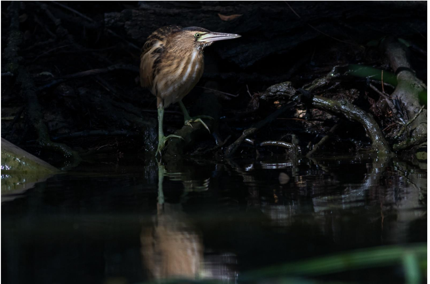
Juvenile Little Bittern (Dániel Balla)