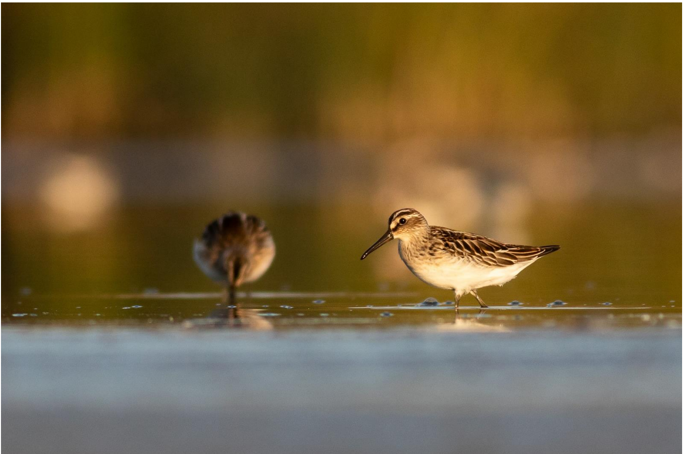
Broad-billed Sandpiper in the Dobrudja area (Dániel Balla)