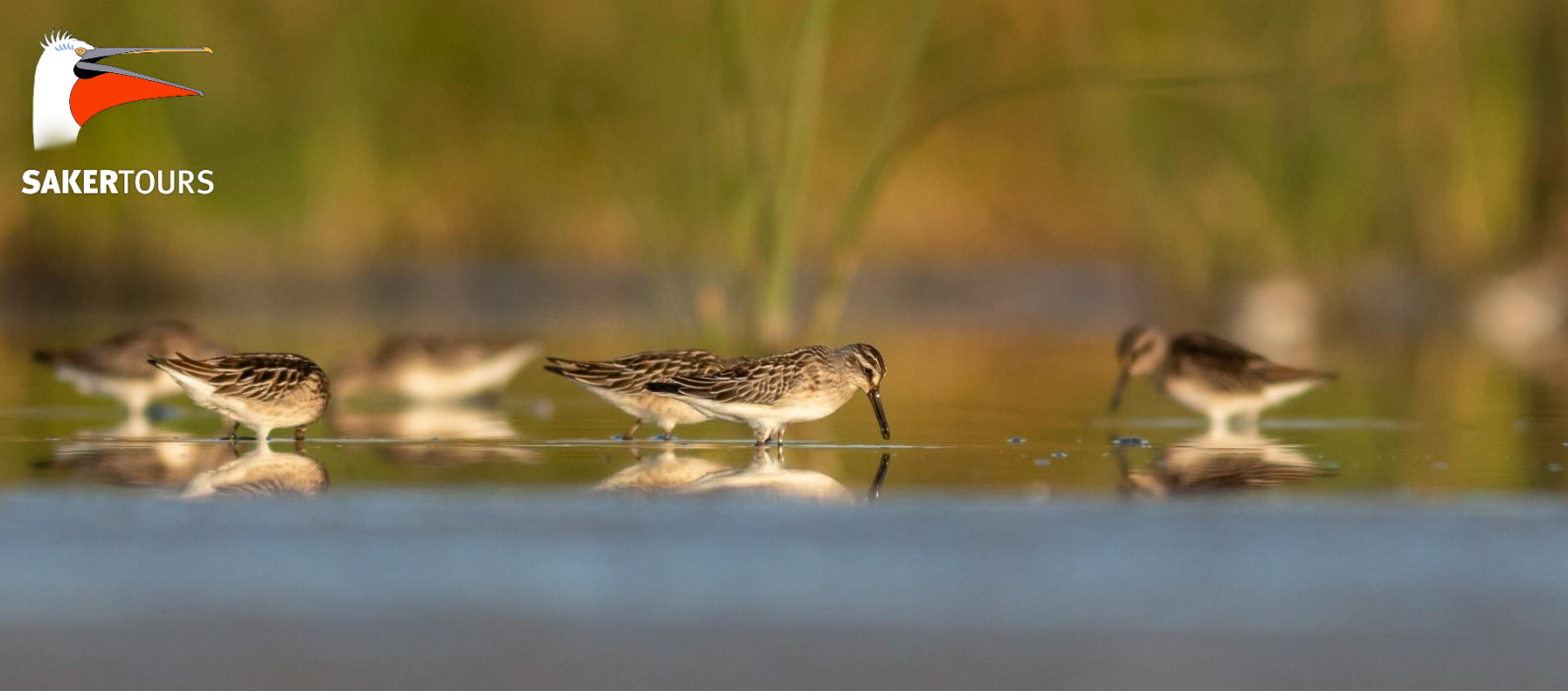
Juvenile Broad-billed Sandpipers (Dániel Balla)