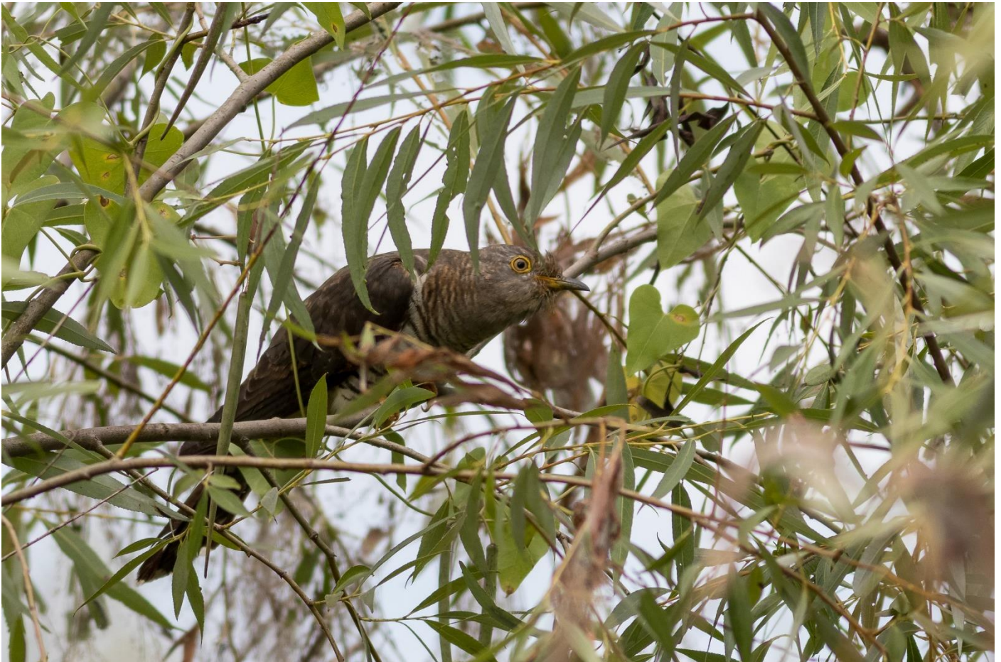
A curious Common Cuckoo (Dániel Balla)