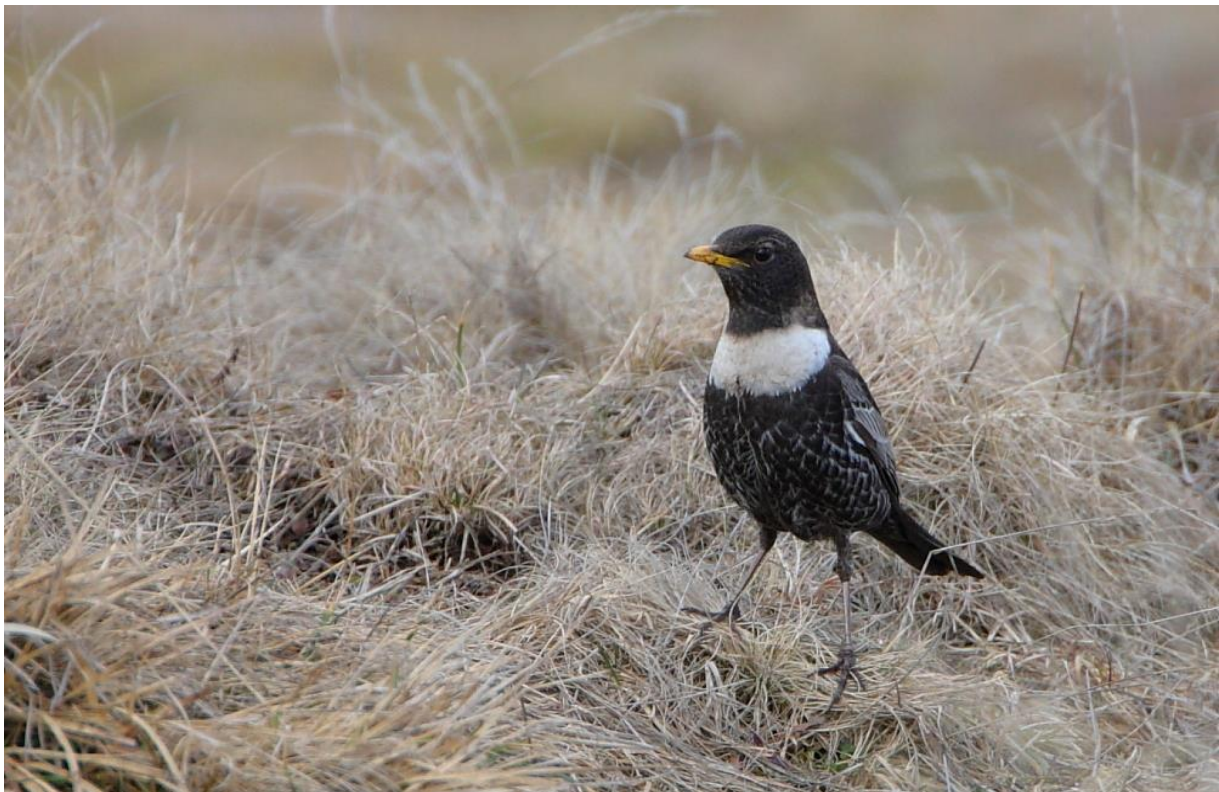
The scaly-bellied alpestris race of Ring Ouzel in the Carpathians

Ring Ouzel Turdus torquatus : We had a singleton on the Hargita Mountain in Transylvania. This is the more scaly 'alpestris' race here.