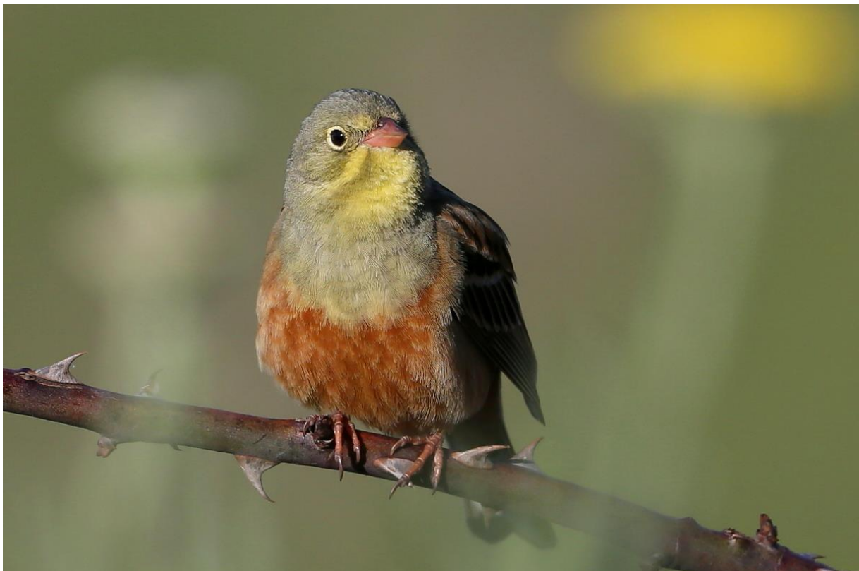
Ortolan Bunting (János Oláh)

After breakfast we had to leave for Transylvania as we had some distance to cover. A small but very productive detour just before the border produced the trio of Great, Common and Jack Snipes as well as an unexpected Spotted Crake and even a few Red-throated Pipits were flushed! After an unusual long border cross due to the migrant crisis we arrived to Élesd Reservoir just to have our packed lunch. The reservoirs were quite empty comparing with the previous years with almost only Common Terns, Great Crested Grebes and Little Gulls were on the reservoirs. Nearby we got very good looks of several singing male Ortolan Buntings and best of all we had a pair of the now scarce Gray Partridge. After this stop we continued towards Torda, where we had good looks on Alpine Swifts and a single Golden Eagle. We arrived to Torockó for dinner. After having dinner we tried for Eurasian Scops Owls, which we only heard briefly most probably they were inactive due to the rather cold evening.