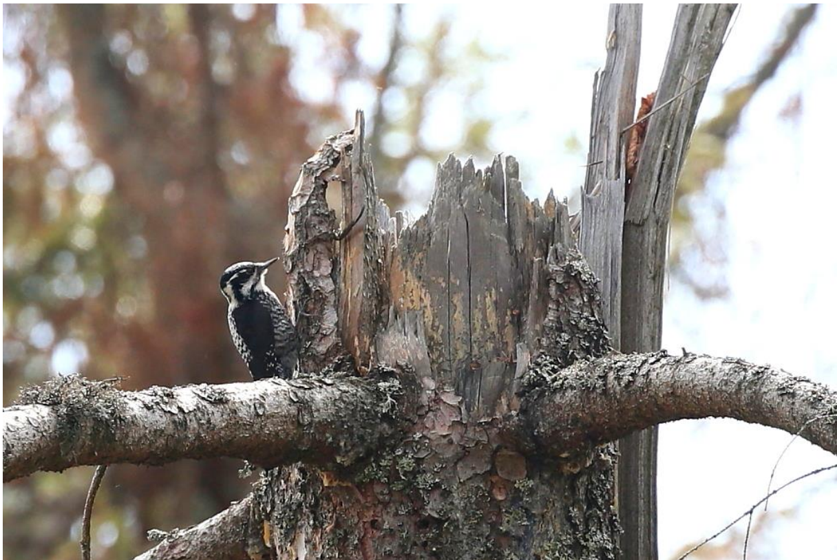
Three-toed Woodpecker (János Oláh)