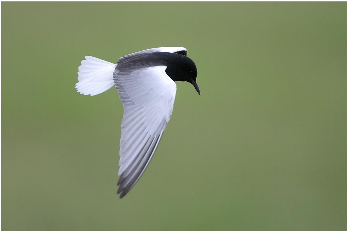
White-winged Tern (János Oláh)