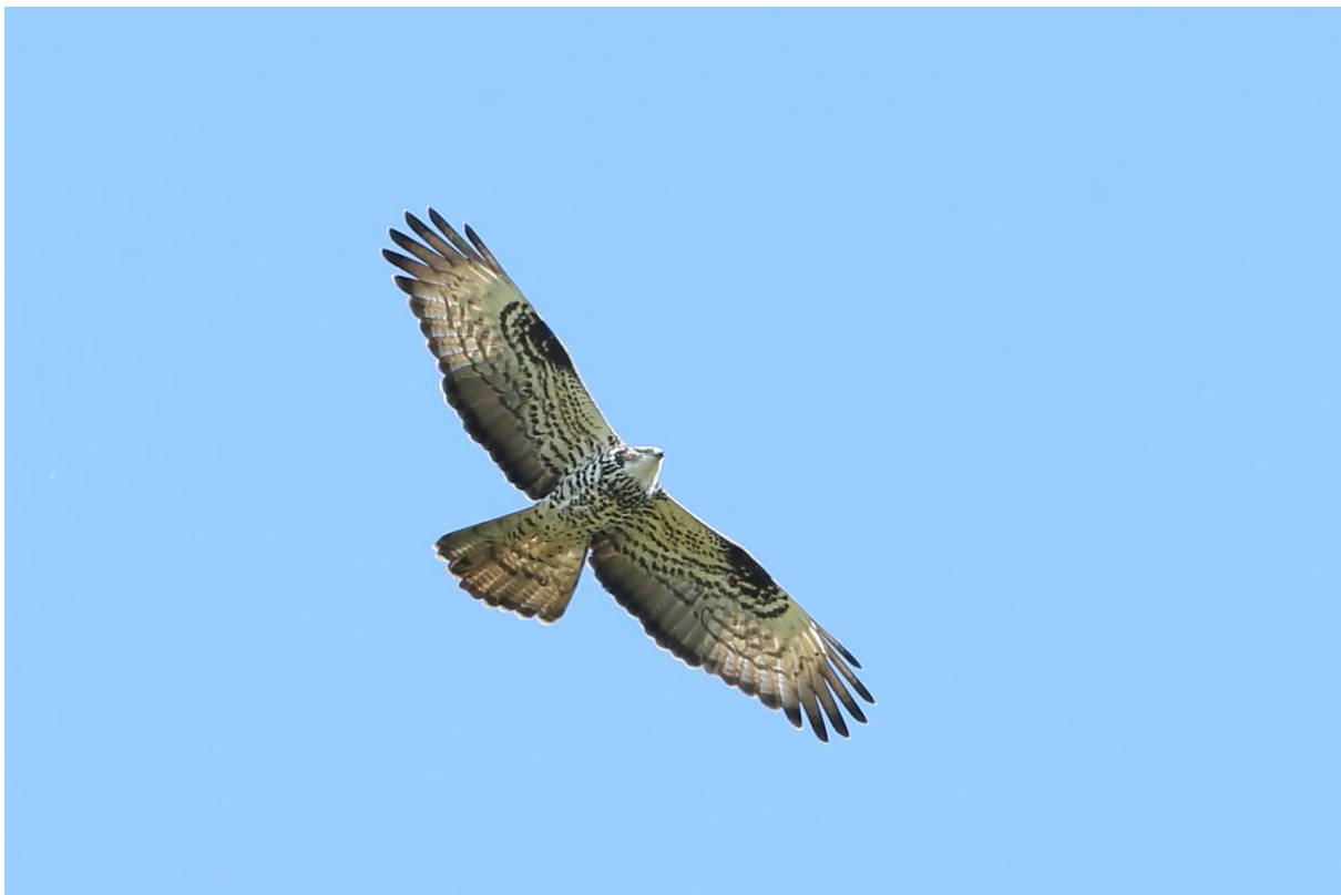
Honey Buzzard (János Oláh)

For the late afternoon we still had time to visit a rock face where we located a family of Eurasian Eagle Owls and our first Lesser Spotted Eagle. The owls gave us excellent looks and it was a great start to a first 'travellin' afternoon. Our luck was not over yet as just before we got to our hidden accommodation in the central Zemplén Hills we managed to find a superb and rather scarce Eurasian Nightjar.