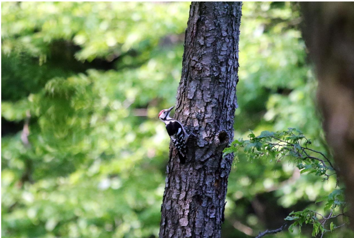
Male White-backed Woodpecker (tour participant Hector Galley)

White-backed Woodpecker Dendrocopos leucotos : Excellent views of this rare and declining species in the Zemplén Hills. A pair was seen at a breeding hole. Later a female was observed at Aggtelek Hills.