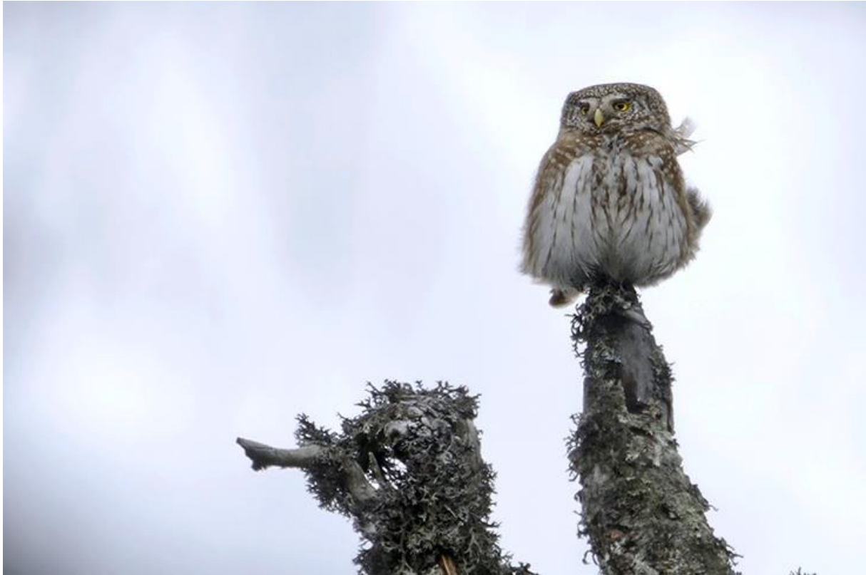
Eurasian Pygmy Owl in Transylvania (Nagy Zoltán Gergely).