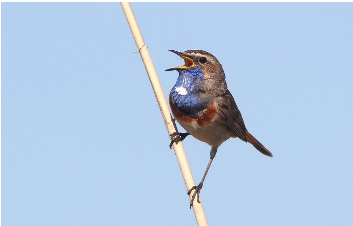
Singing Bluethroat (János Oláh)

Our last full day birding was spent again in the Hortobágy National Park. In the morning we visited a wetland we did several days ago but seems almost all the marsh terns left the area, but still managed to see a Glossy Ibis and a Turnstone. After a lot of searching finally we managed to find a pair of Long-legged Buzzard. We had our lunch at the nicely situated and just opened Bíbic Ecolodge, where we enjoyed some birdwatching too. From Balmazújváros we crossed the Hortobágy and stopped for an immature pair of Eastern Imperial Eagle. The dirt road to the marshy area was unpassable by our van so we needed to take a walk to the best marshy areas. On the walk we had a singing Bluethroat and a Water Rail as a good sign. As soon as we arrived to the certain spot we immediately heard two Moustached Warblers singing and it didn't take a long to have a fine male in the scope as did a superb male Bluthroat minutes later. On the way back we saw several fine Mountague's Harriers and had a good look of a male Little Crake. Before we arrived back to our hotel checked a roosting place for Barn Owl and it took only a minute to succeed.