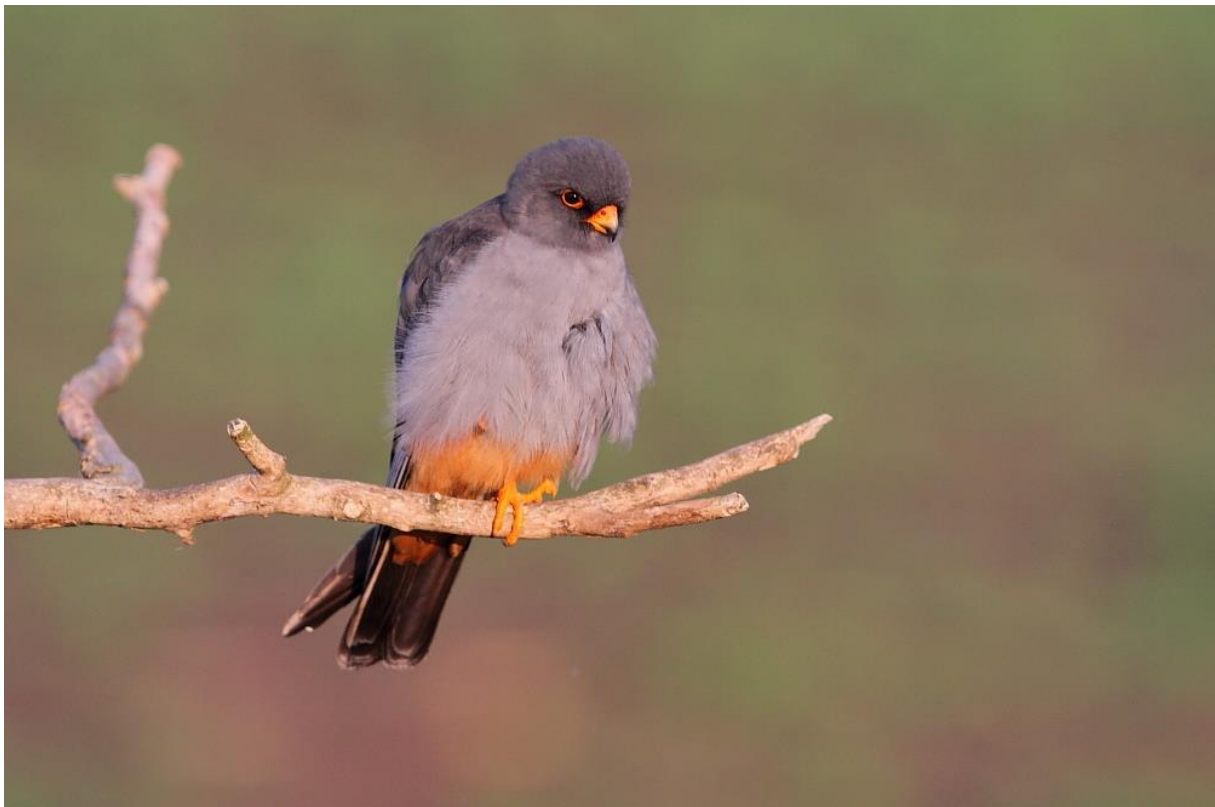
Male Red-footed Falcon. There are many great raptors on this tour

Red-footed Falcon Falco vespertinus : Daily sightings of these very special colonial breeders on the Hortobágy. Sometime we had up to 20 circling together or occupying their abandoned rook nest or an artificial nest box for breeding.