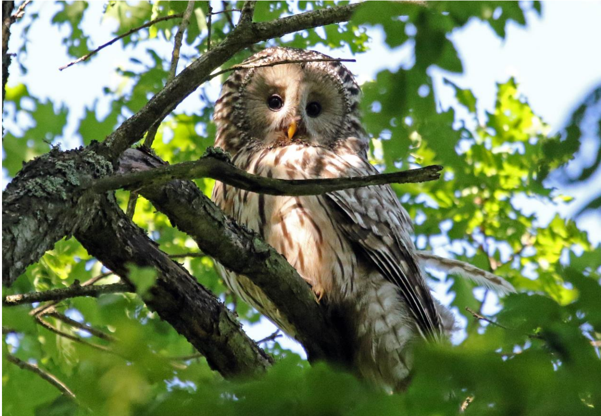
Ural Owl (tour participant Hector Galley)

nice open oak forest where we quickly located a pair of both Lesser and Middle Spotted Woodpeckers, a shy Grey-headed Woodpecker and glimpsed a Tawny Owl too, but failed to locate the much hoped for Ural Owl. Here we had our first encounter with Collared Flycatchers and Eurasian Treecreepers. To celebrate our first bird-packed day we had an enjoyable wine tasting with dinner in the World Heritage Tokaj region.