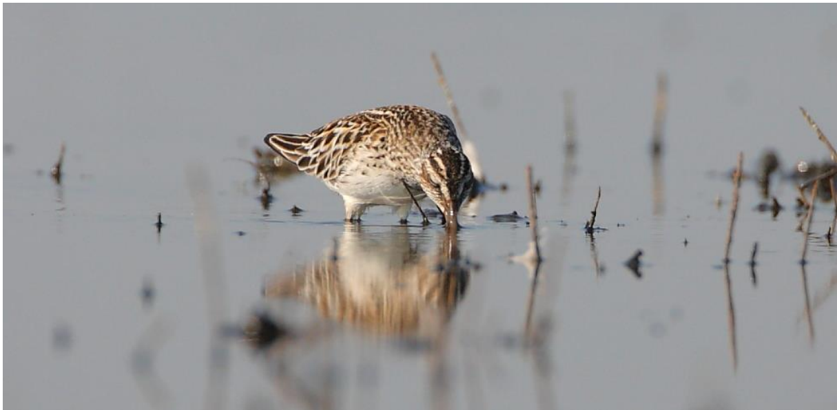
Breeding plumaged Broad-billed Sandpiper feeding (János Oláh)

Broad-billed Sandpiper Limicola falcinellus : A fine summer plumaged adult was observed the edge of the Hortobágy on a drained fishpond.