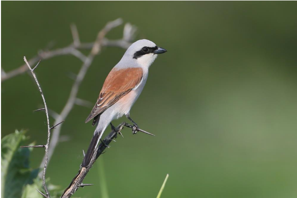
Male Red-backed Shrike is a common sighting along this tour (János Oláh)

Red-backed Shrike Lanius collurio : This lovely bird was commonly encountered on the tour.