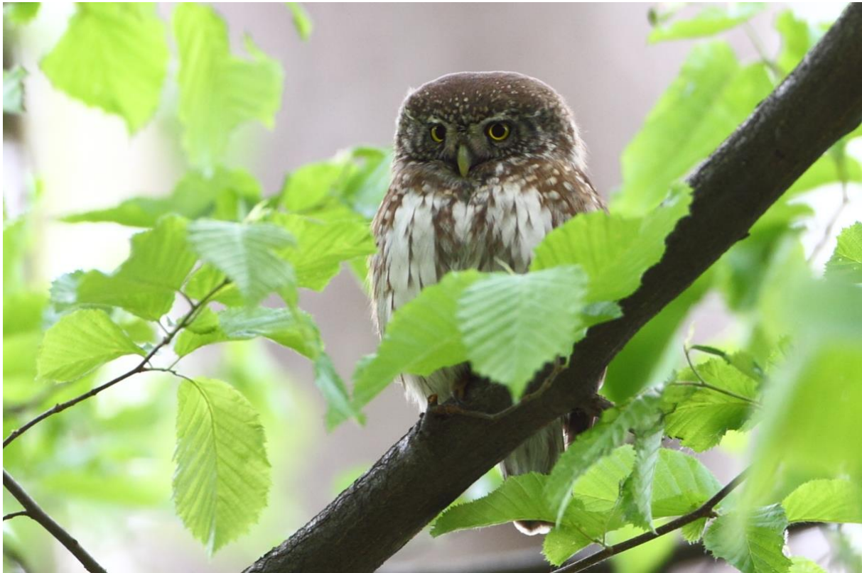
Eurasian Pygmy Owl (János Oláh)

After breakfast we had to say goodbye to the Hortobágy and started our drive towards the Liszt Ferenc Airport of Budapest where the tour ended. We had one stop en route on the fields near Karcag where we had good looks of the lovely Collared Pratincole. While we were checking the colony a fine male Black-winged Pratincole - a rare bird in Hungary – was spotted. The bird was courting a Collared Pratincole, and we had good scope views on the ground and also the flying bird to study all the important identification features and eliminate a hybrid possibility. This was the last new bird to our list so the grand total settled on 228 species on the tour. This was a truly memorable tour with the second ever biggest list through the transect of the Carpathian range from the steppes of the Hortobágy to the high mountains! It was a true insight of the birdlife and the great natural heritage of three Central-Eastern European countries.