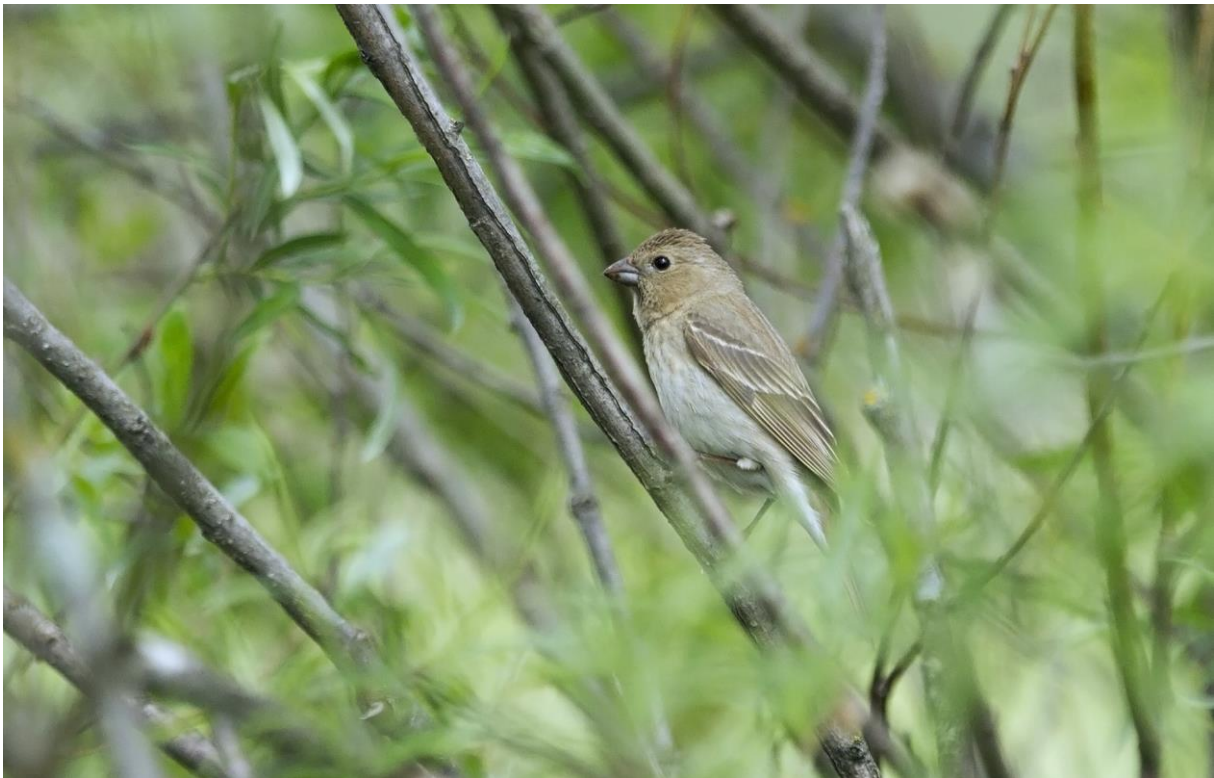
Immature Common Rosefinch (Zoltán Baczó)

Yellow Wagtail Motacilla flava : Some “feldegg” type birds at Szentpál Fishponds. Grey Wagtail Motacilla cinerea : It was a widespread bird. White Wagtail Motacilla alba : It was fairly common throughout the tour. Tree Pipit Anthus trivialis : Several birds were seen. Water Pipit Anthus spinoletta : The commonest bird on the top of the Bucegi mountains. Common Chaffinch Fringilla coelebs : A very common bird in most wooded habitat. European Serin Serinus serinus : Several were seen in the forested parks. European Greenfinch Carduelis chloris : It was seen frequently in human settlements. European Goldfinch Carduelis carduelis : It was seen frequently in human settlements. Common Linnet Carduelis cannabina : It was fairly common. Eurasian Bullfinch Pyrrhula pyrrhula : Excellent looks of three birds close to our accommodation at Sinaia. Common Crossbill Loxia curvirostra : We saw a few birds in the Carpathian Mountains throughout the tour. Hawfinch Coccothraustes coccothraustes : We had a few birds at Segesvár forest. Common Rosefinch Carpodacus erythrinus : We had a single subadult male near the cable car at Sinaia. We were lucky with that observation, because we had no choice to visit our regular place later on.