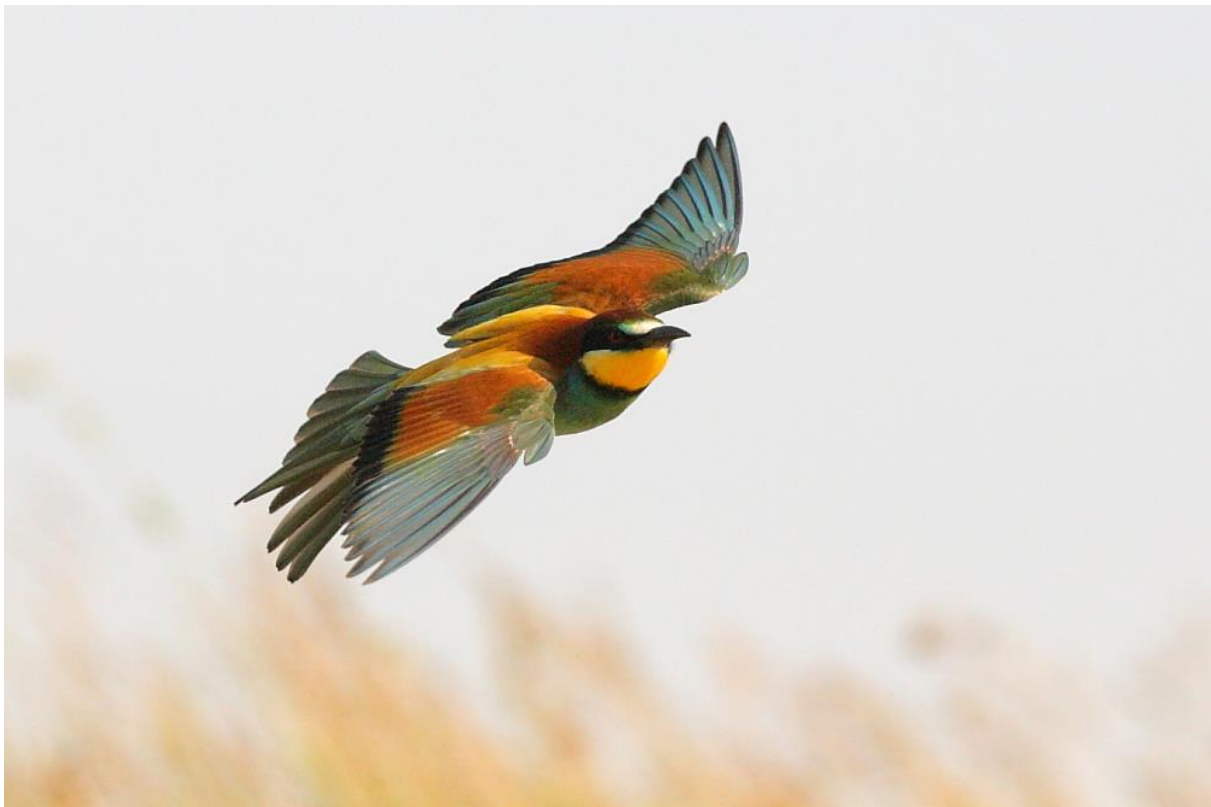
Bee-eaters are amazing (János Oláh)

Whiskered Tern Chlidonias hybridus : A few were seen in a colony near Brassó. White-winged Tern Chlidonias leucopterus : Two late individuals were seen at Szentpál Fishponds. Stock Dove Columba oenas : A few were seen in the Hargita region. Common Wood Pigeon Columba palumbus : Fairly common throught the tour. European Turtle Dove Streptopelia turtur : Two were seen in the Küküllő-valley near Kiskapus. Eurasian Collared Dove Streptopelia decaocto : Very common in the villages. Common Cuckoo Cuculus canorus : A few heard throught the tour and three were seen at Torockó. Tawny Owl Strix aluco : We had a family party at Segesvár forest. Ural Owl Strix uralensis : Long scope views of a single bird on our first full day near Sinaia. Eurasian Eagle Owl Bubo bubo : Prolonged scope studies of a bird perched on a cliff. Little Owl Athene noctua : We picked up one individual in the Küküllő-valley. European Scops Owl Otus scops : Excellent looks of a bird near Torockó. Common Swift Apus apus : Small numbers were seen at Bucegi and Békás Gorge. Alpine Swift Apus melba : Seen at Bucegi, Torockó and Békás Gorge in small numbers. European Bee-eater Merops apiaster : We had good looks at several individuals in a colony just next to the road.