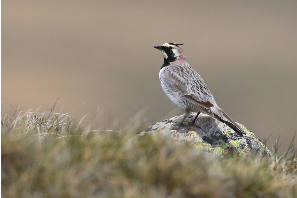
'Caucasian' Shore Lark (János Oláh)