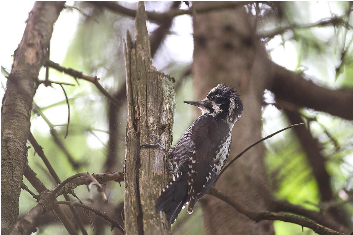
Female Three-toed Woodpecker on te Hargita Mountains (Attila Szilágyi)