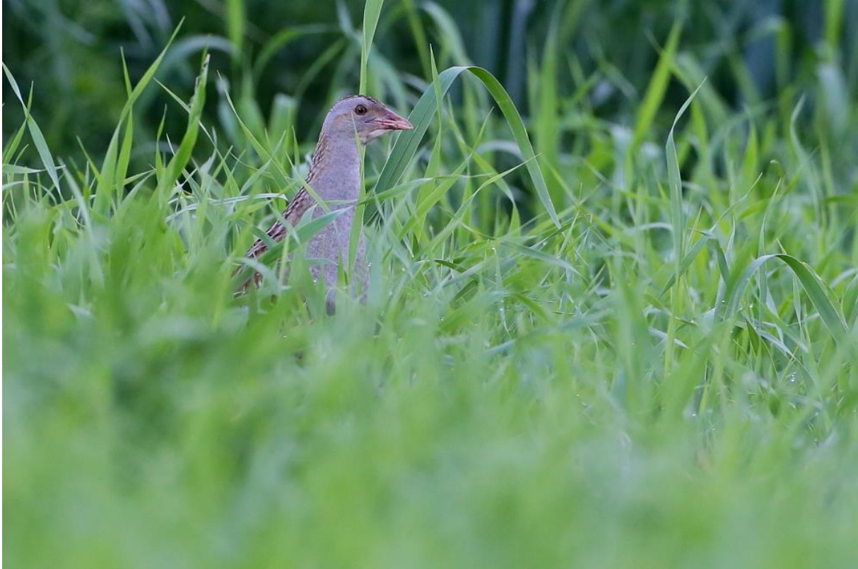
Corncrake was showing well near Torocko