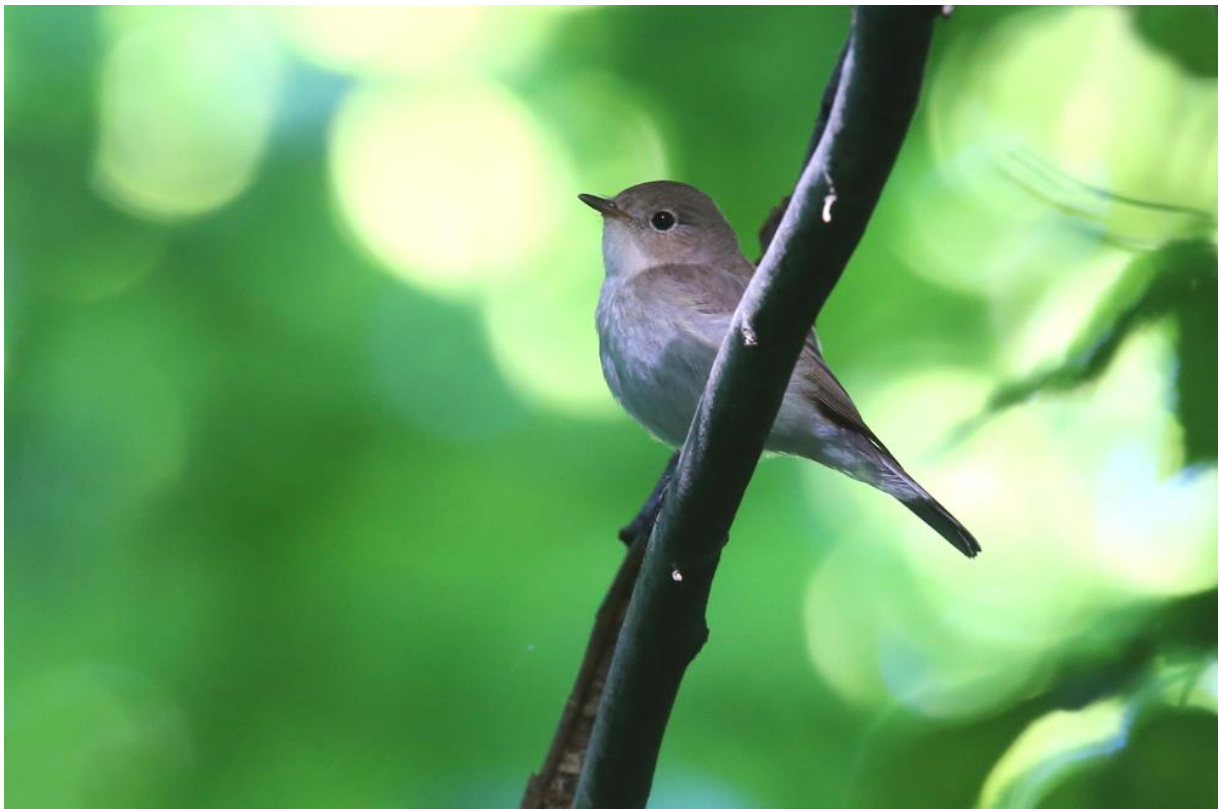
Immature male Red-breasted Flycatcher (János Oláh)

Song Thrush Turdus philomelos : A common bird in the Carpathians. Mistle Thrush Turdus viscivorus : A few were seen in the Hargita. European Robin Erithacus rubecula : Several sightings of this shy forest bird. Thrush Nightingale Luscinia luscinia : Almost everyone had a look on a single singing male. Common Nightingale Luscinia megarhynchos ( H ): A distant bird sang near Torockó. Black Redstart Phoenicurus ochruros : A very common birds of the villages all along the tour. We saw several at various places but usually in small numbers. Common Redstart Phoenicurus phoenicurus : Several birds were seen near our accommodations at Sinaia and Zetelaka. Whinchat Saxicola rubetra : Only a pair we had near Torockó. Common Stonechat Saxicola torquata : A fairly common bird. Northern Wheatear Oenanthe oenanthe : A few were seen on the higher elevations. Rufous-tailed Rock Thrush Monticola saxatilis : We managed to see a male near Torockó. Spotted Flycatcher Muscicapa striata : Several were seen in a forested park of Székelyudvarhely. Red-breasted Flycatcher Ficedula parva : A singing subadult male was giving excellent looks near Sinaia.