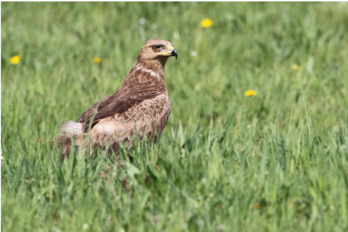
Adult Lesser Spotted Eagle (János Oláh)

Lesser Spotted Eagle Aquila pomarina : A total of some 40 were seen, but the best view were obtained on our last day as we travelled towards the airport. We saw some 20 near a recently mowed field. The flagship bird of the Carpathians with over 2000 breeding pairs!