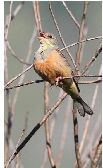
Male Grey Partridge (left) and Ortolan Bunting (János Oláh)