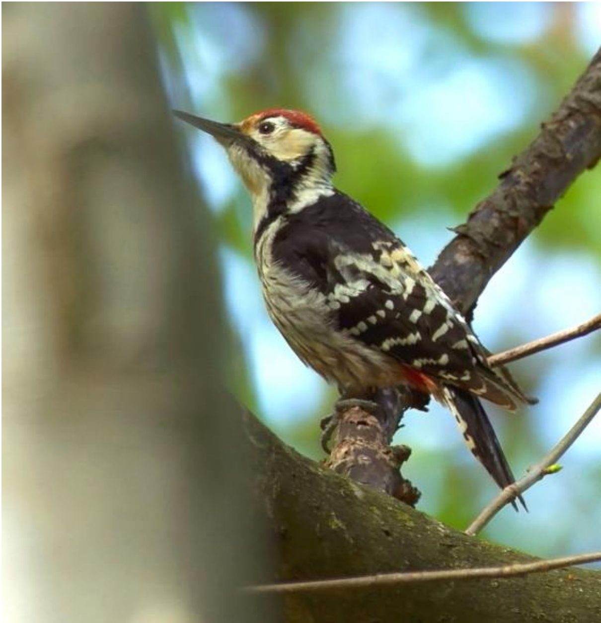
Male White-backed Woodpecker near Segesvár (Zoltán Baczó)

Dracula. Our last stop of the day was by the Küküllő river, where we saw a singing Thrush Nightingale and several Garden Warblers. We were ready for a nice dinner by the time we arrived to our final accommodation in the base of the Hargita Mountains.