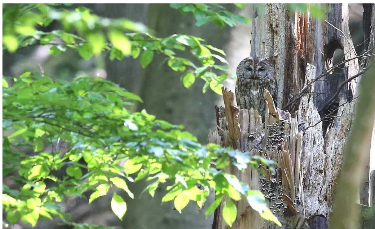
Twany Owl (János Oláh)

Despite it was raining when we got up and did our pre-breakfast birding and had a similar selection to the previous morning with nice views of Corncrake again! After breakfast we left the Torockó area behind and drove towards our last base: the mighty Hargita Mountains. We stopped a few times along the way, first for a roadside perched Lesser Spotted Eagle and later we had a nice time at a small colony of the colorful European Bee-Eaters where a Black Stork was a bonus. We continued our drive towards the Hargita Mountain and had our picnic lunch in a lovely old beech and oak woodland with Collared Flycatchers, Tawny Owls, Black and Middle Spotted Woodpeckers.