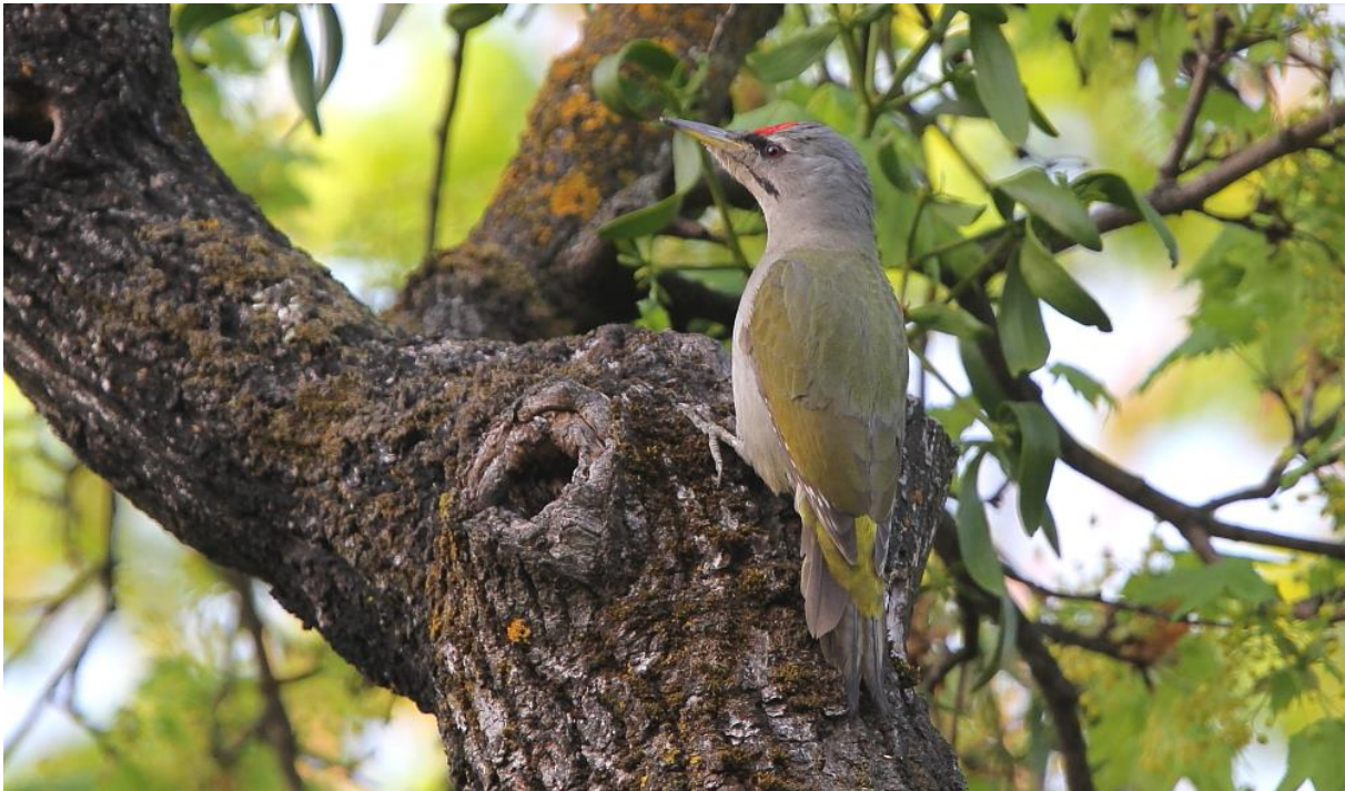
Male Grey-headed Woodpecker (János Oláh)

After we all gathered at Bucharest airport we left the hot lowlands behind as soon as we could and climbed up to the Eastern Carpathians. We saw Ferruginous Ducks and Whiskered Terns on the early part of the drive but not much else. Traffic was pretty bad as lot of people were heading to the cooler Carpathians for the weekend. Late afternoon we arrived to our comfortable accommodation just at the forest edge in the Bucegi Mountains. The temperature was very pleasant comparing the hot wheater we had in Bucharest. We had an optional walk in the forest but really it was getting too late so there was not much activity. We had a nice dinner and an early night.