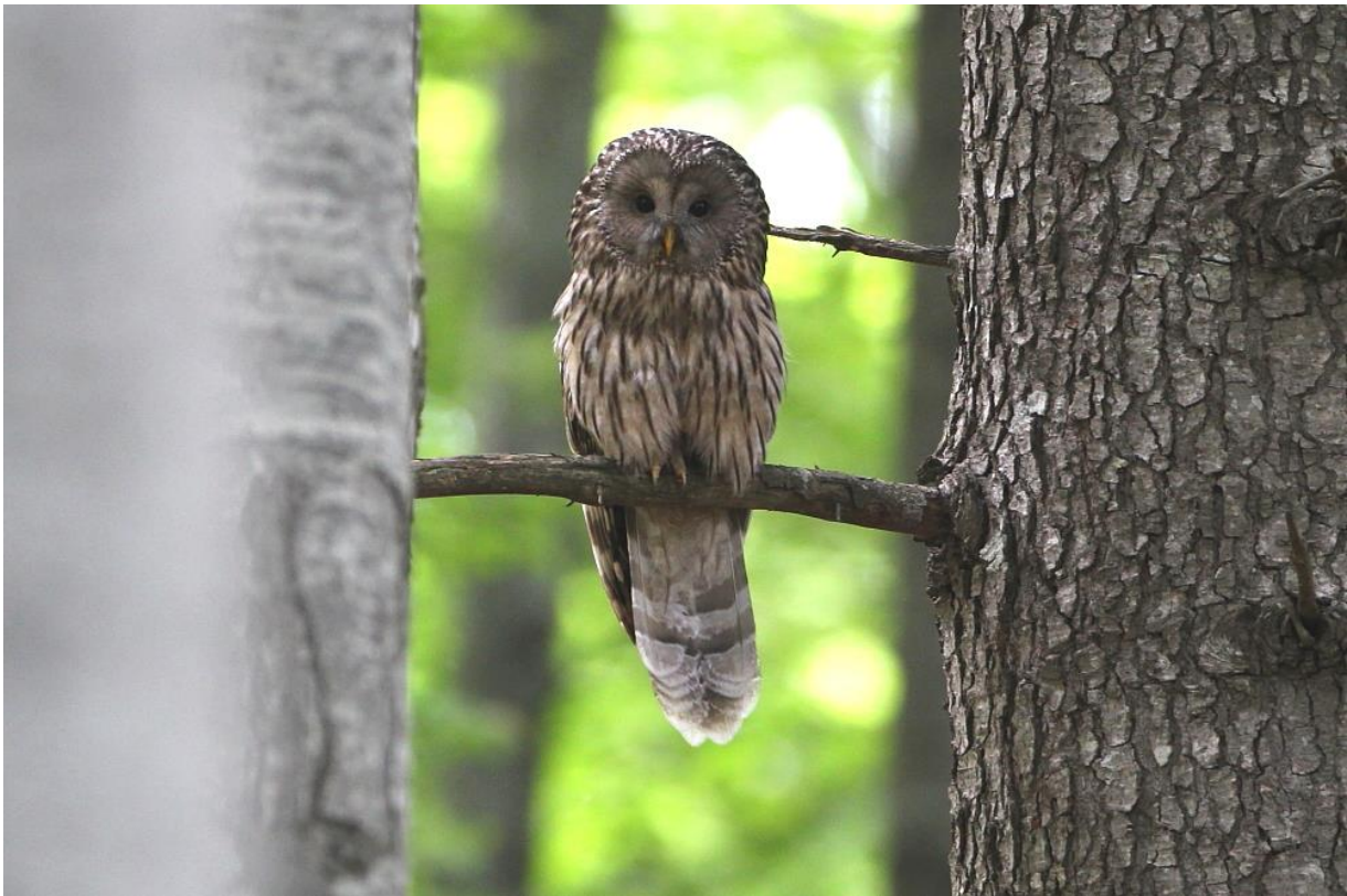
Adult Ural Owl in the Bucegi Mountains (János Oláh)

from the bus. The bird flew away but we got out and followed it until everybody had nice scope views of this large owl! What a fantastic bird to finish our first day birding!