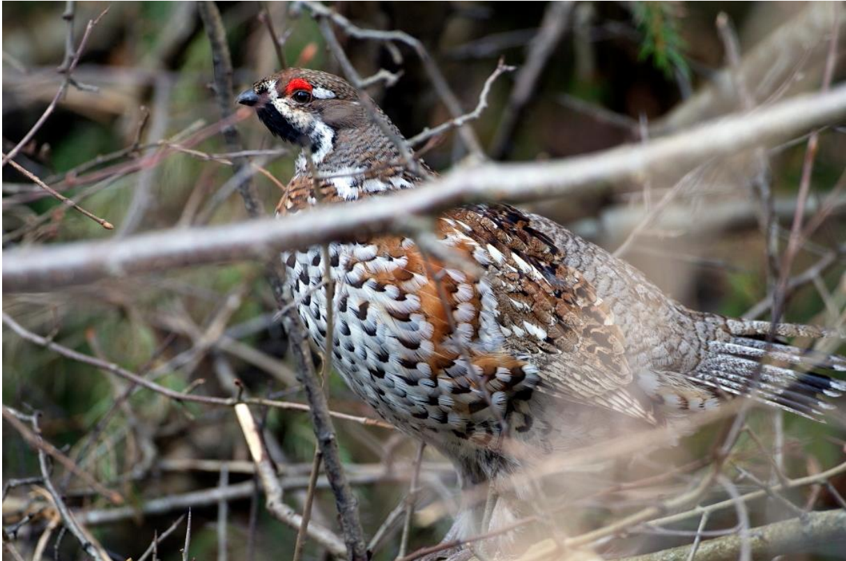
Male Hazel Grouse in the Hargita Mountains (Attila Szilágyi)

bear hides. The last few hundred meter we had to walk and as we approached the hide a male Hazel Grouse was glimpsed by some of us. The bear activity was amazing and we quickly forget the rainy day with hard work when we had six different Carpathian Brown Bears in front of the hide which was surely one of the most memorable experience for this tour. But the icing on the cake was finding probably the same male Hazel Grouse roosting as we were silently walking back to our bus. It is not often you can watch a male Hazel Grouse through the scope! It was a memorable day indeed!