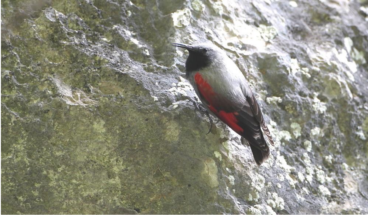
Wallcreeper in the Békás (Bicaz) Gorge (János Oláh)