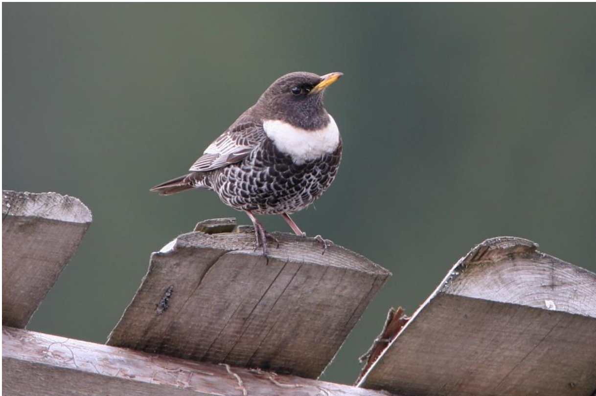
Ring Ouzel 'alpestris race' with extensive scaling (János Oláh)

Ring Ouzel Turdus torquatus : We saw two birds on the Hargita Mountain. This is the more scaly "alpestris" race here.