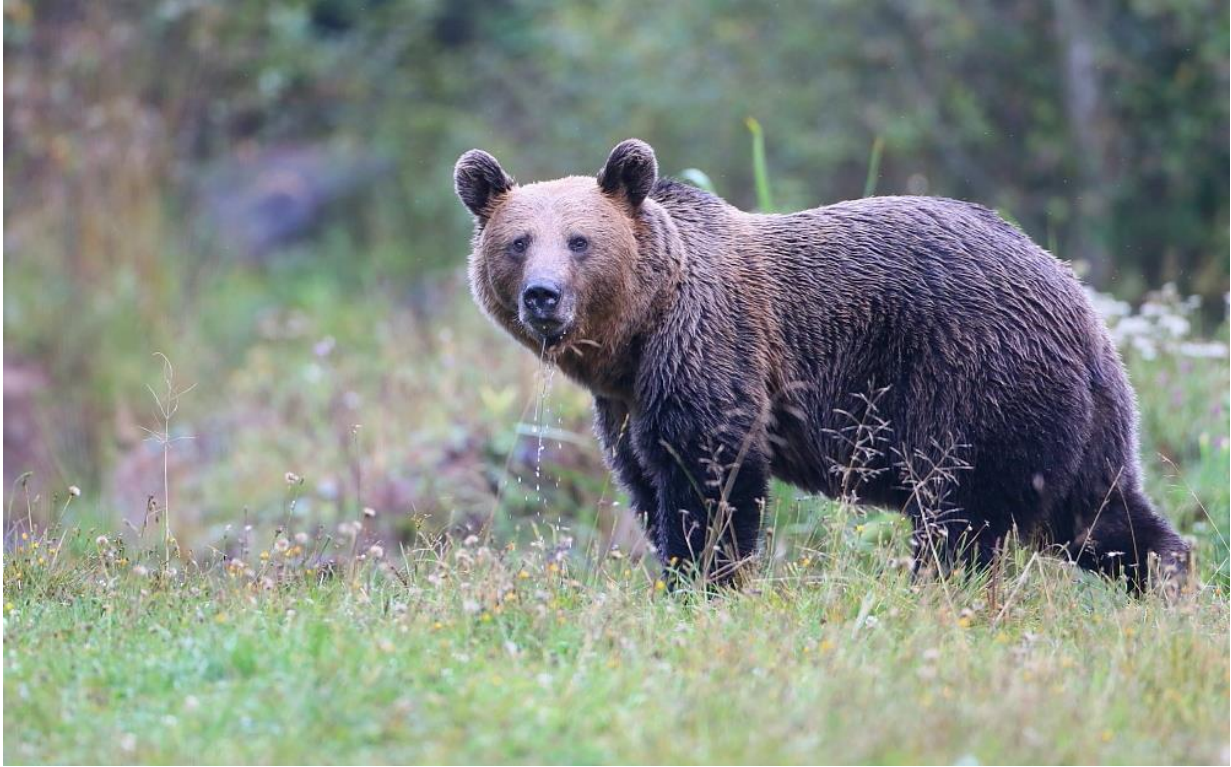
Carpathian Brown Bear in the Hargita Mountains