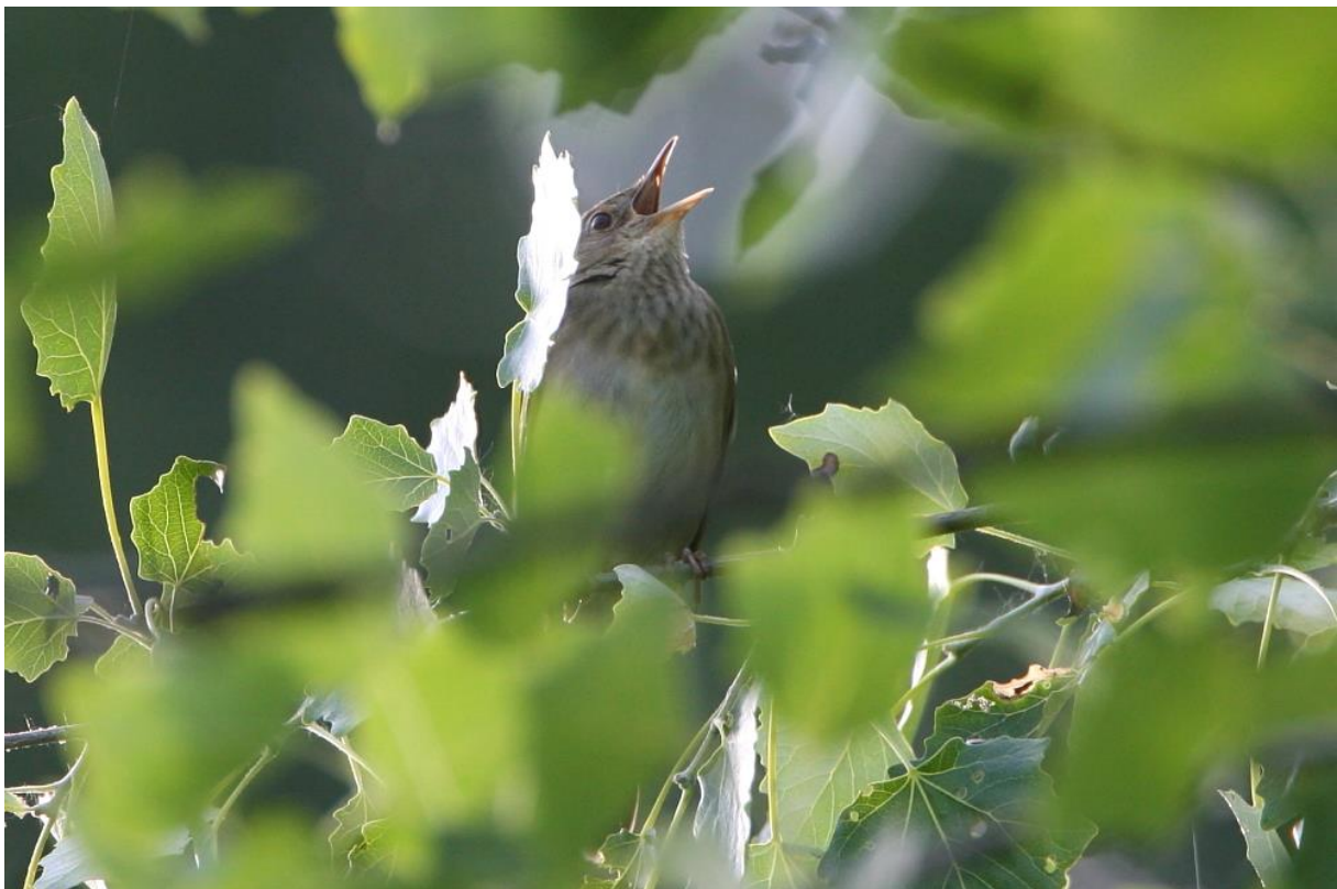
River Warbler is a real Central European speciality (János Oláh)

Willow Tit Parus montanus : It was regular in the higher elevation pine forests. Sombre Tit Parus lugubris : A fast moving bird was seen by the leader near Torockó (LO). Coal Tit Parus ater : Fairly common in the Carpathian Mountains. Crested Tit Parus cristatus : We had several good views of this magnificent little bird at higher elevations. Great Tit Parus major : It was common throughout the tour. Blue Tit Parus caeruleus : Only two were seen. Crag Martin Ptyonoprogne rupestris : Up to four birds were observed near Torockó. Barn Swallow Hirundo rustica : Very common throughout. Red-rumped Swallow Cecropis daurica : We had good views of at least six birds near Torockó. This is a rare breeder in the Carpathian Basin. Northern House Martin Delichon urbica : Very common throughout the tour. Long-tailed Tit Aegithalos caudatus : First we had a family party at Torockó. Horned Lark Eremophila alpestris : At least three were seen of this rare and striking subspecies. Crested Lark Galerida cristata : Not a common bird in Transylvania with a single observation during the tour. Eurasian Skylark Alauda arvensis : A widespread bird on the grassy areas. Wood Lark Lullula arborea : We had good views near Torockó, where still quite common. River Warbler Locustella luscinioides : We heard several near Torockó and scoped a single bird next to the road.