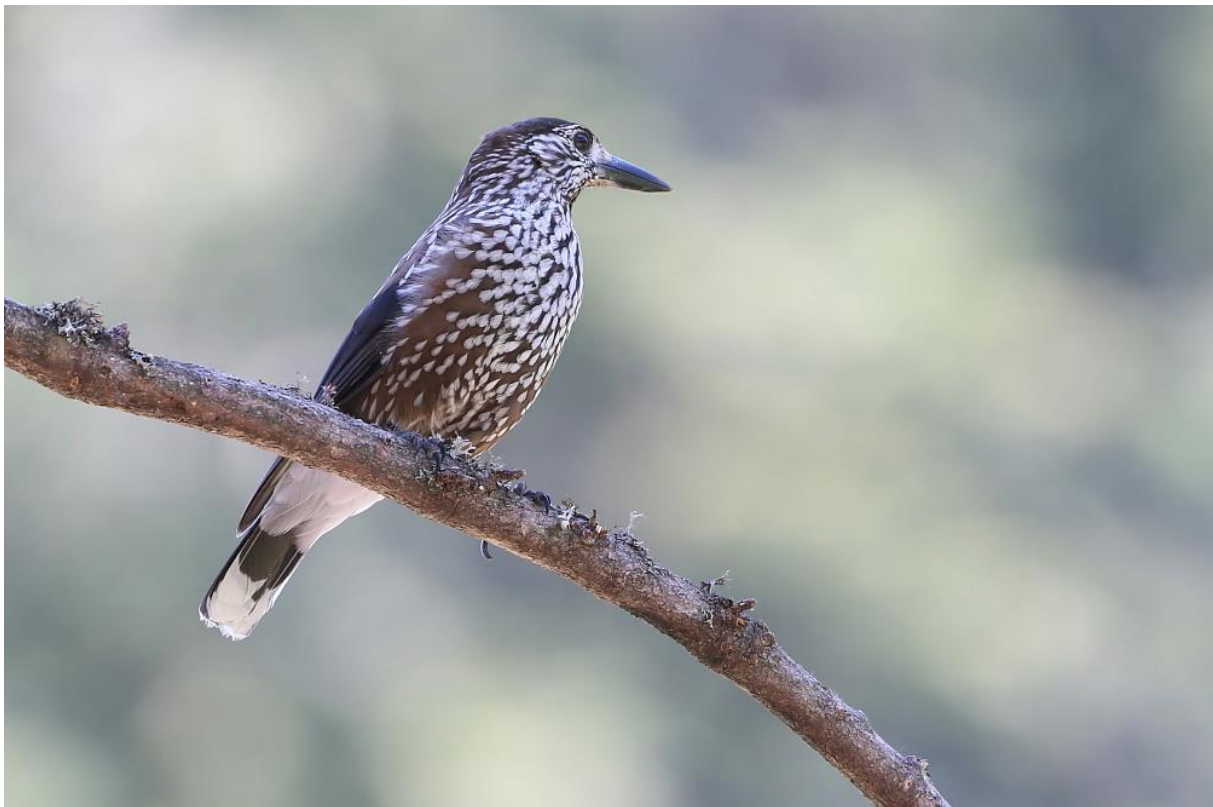
Eurasian Nutcracker is such a wonderful bird (János Oláh)

Great Spotted Woodpecker Dendrocopos major : Regularly seen throughout the tour. Eurasian Three-toed Woodpecker Picoides tridactylus : We had a brilliant prolonged looks of a female bird in the Hargita mountains. Black Woodpecker Dryocopus martius : Three sightings of this largest European woodpecker throughout the tour. European Green Woodpecker Picus viridis : A male perched on a telegraph pole near Torockó. Grey-headed Woodpecker Picus canus : A female and a male next day near Sinai gave excellent looks. Later heard near Székelyudvarhely. Red-backed Shrike Lanius collurio : This lovely bird was commonly encountered on the tour. Lesser Grey Shrike Lanius minor : We had a five birds in the Homoród-valley on our final day. Great Grey Shrike Lanius excubitor : We saw several birds on this tour. Eurasian Golden Oriole Oriolus oriolus : A few heard and seen, with some scope views for some of us. Eurasian Jay Garrulus glandarius : It was commonly seen throughout the tour. Common Magpie Pica pica : A frequently encountered bird throughout the tour. Spotted Nutcracker Nucifraga caryocatactes : Great views of this often secretive breeding bird in the Hargita. Several more were heard.