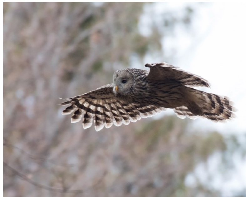
Ural Owl in flight