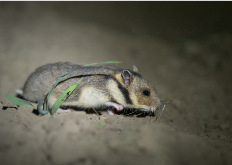
Romanian Hamster