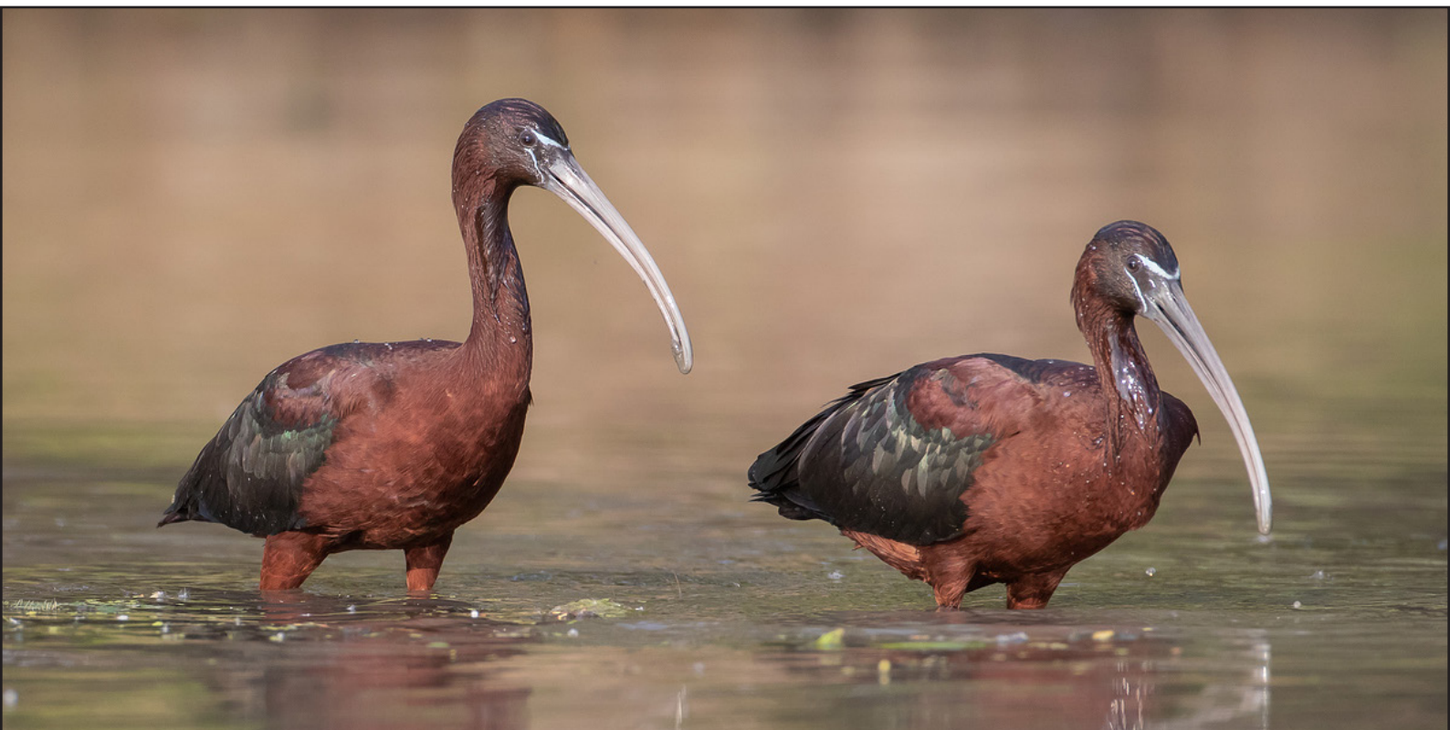
Glossy Ibises feeding on shallow water

Please visit our Danube Delta Blog for more pictures from the last season!