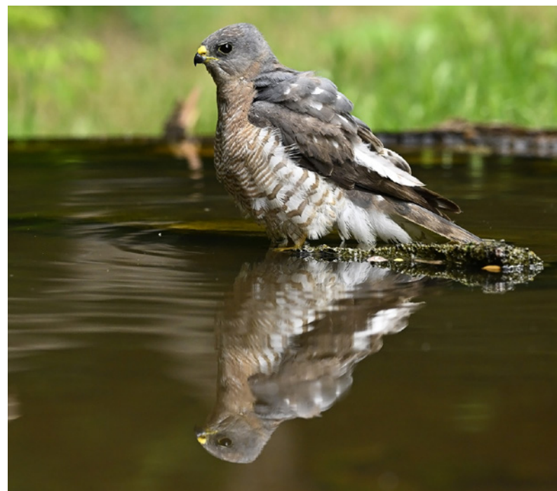
Male Levant Sparrowhawk