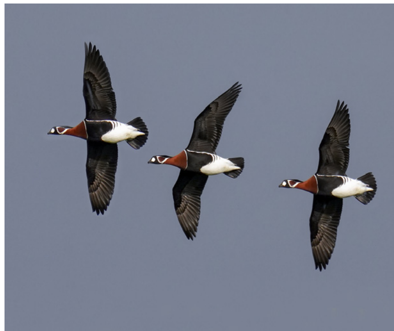
Red-breasted Goose in flight