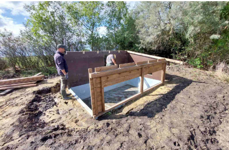
New and improved Egret and Stork hide

Our Egret and Stork hide in the Hortobágy just recently has been rebuilt and improved! Also one of our drinking stations has a new design and ideas!