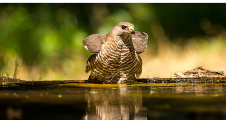
Female Levant Sparrowhawk

• Levant Sparrowhawk Photography in the Macin Mountains. Greater chances to capture this species form one of our drinking hide during our Danube Delta and Dobrudja Spring tours!