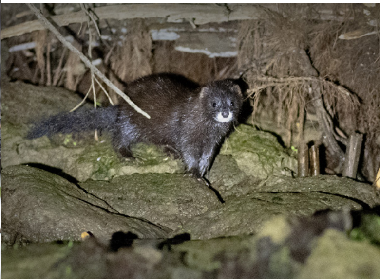
European Mink

In 2022 all our mammal watching tours were running!