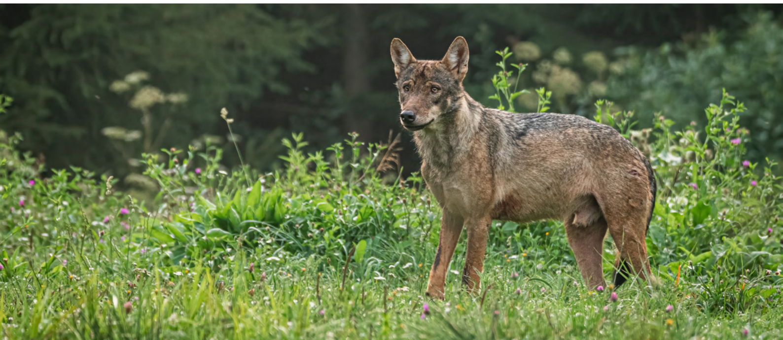
Grey Wolf in front of the Bear photography hide

Please visit our Transylvania Blog for more pictures!