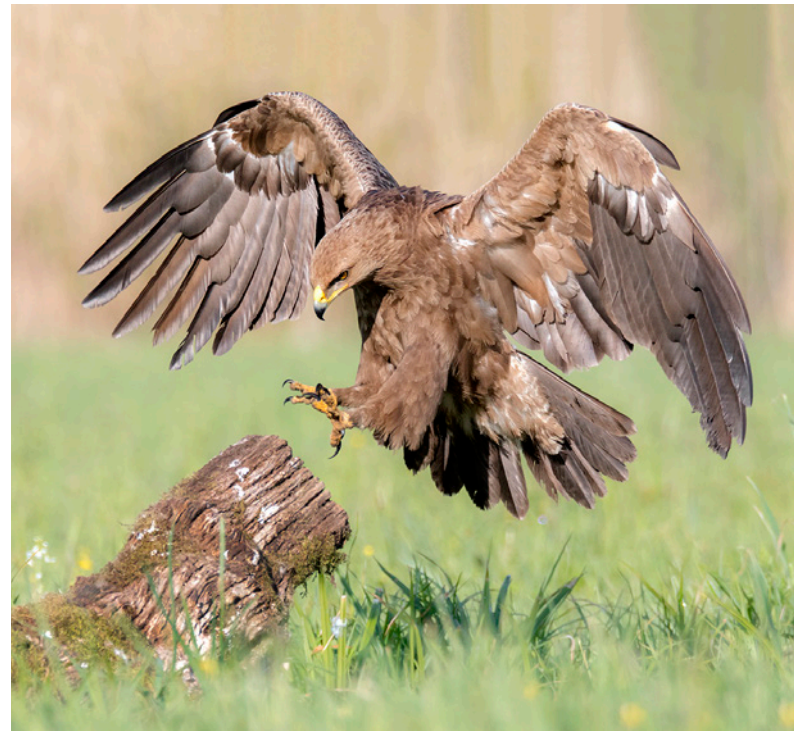
Lesser Spotted Eagle landing

• New photo tour: Winter Golden Jackals Photography tour in the Danube Delta ! We will be testing this new, short break tour in this upcoming winter! Golden Jackal is a common mammal species in the Danube Delta and this tour will be combined with bird photography possibilities too! Look out for the details from summer 2023!