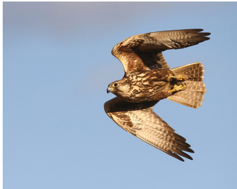
Saker Falcon in flight