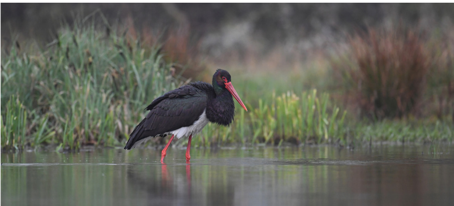
Black Stork fishing

Please visit our Hortobágy Photo Blog for more pictures!