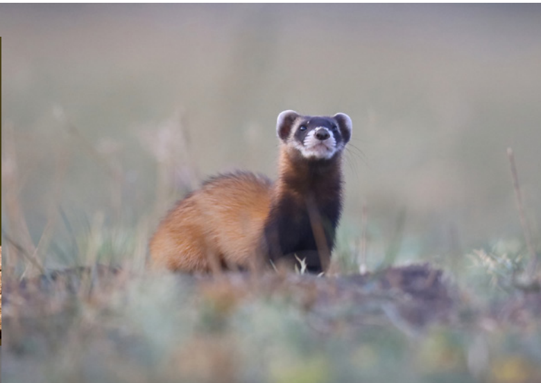
Steppe Polecat