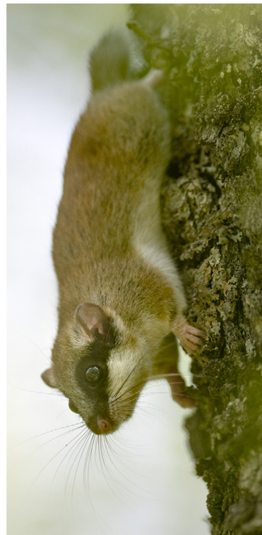
Ring Ouzel; Eurasian Lynx and Forest Dormouse

Please visit our HIDE PHOTOGRAPHY TOUR CALENDAR and BIRDWATCHING TOUR CALENDAR for dates, availabilities and extra informations!