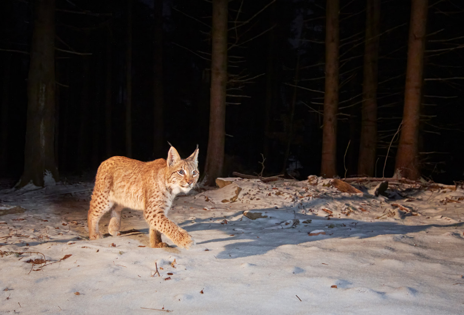
Ghost of the Carpathians, the Eurasian Lynx

With best wishes for Christmas and the New Year from everyone at SAKERTOURS